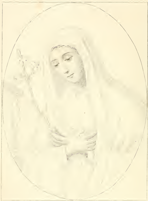
St. Elizabeth, Empress of the Romans by Michaelangelo