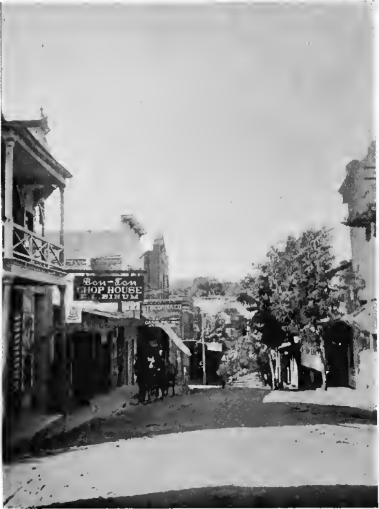
PLATE XV Main Street, San Andreas, "During the Mid-day Heat, Almost Deserted"