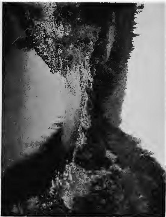
PLATE III Mokelumne River; "Whatever the Meaning of the Indian Name, One May Rest Assured It Stands for Some Form of Beauty"