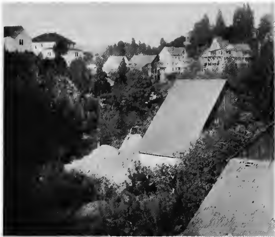
PLATE XXIII A Bit of Picturesque Nevada City, Embracing the Homes of Its Leading Citizens