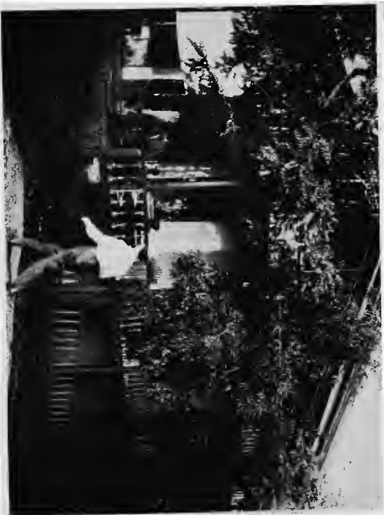
PLATE XVII Mokelumne Hotel, on the Summit of Mokelumne Hill, and at the Head of the Famous Chili Gulch