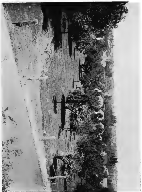
PLATE XXI An Apple Orchard, Grass Valley, “the Trees Growing in the Grass, as in England and the Atlantic States”