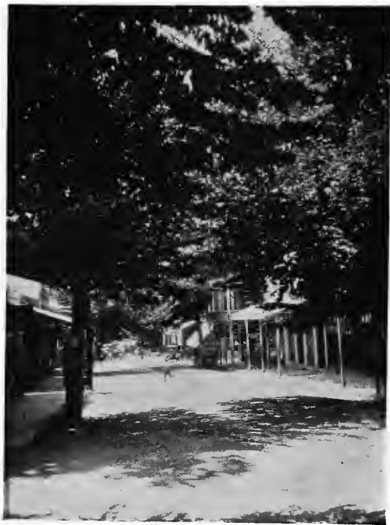
PLATE XIII Main Street, Sonora, "So Shaded by Trees That Buildings Are Half-hidden"