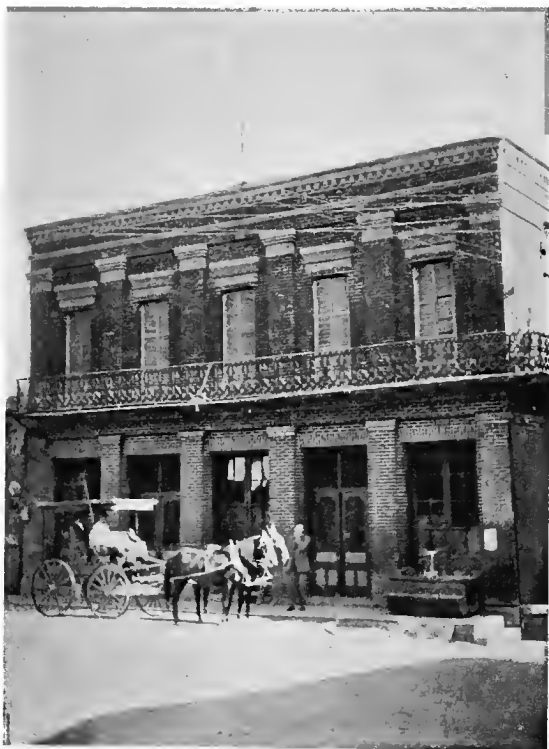
PLATE XVI Metropolitan Hotel, San Andreas; in the Bar-room of Which Occurred the "Jumping Frog" Incident