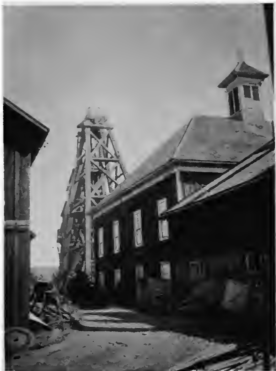
PLATE IX Main Hoist of the Utica Mine. Angel's Camp, Situated on the Summit of a Hill Overlooking the Town