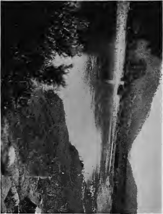
PLATE V South Fork of the American River, Coloma. The Bend in the River is the Precise Spot Where Gold Was First Discovered in California