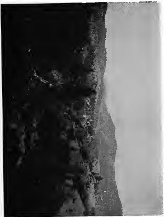
PLATE XIV Sonora, Looking South-east. "No Matter From What Direction You Approach It, Sonora Seems to Lie Basking in the Sun"