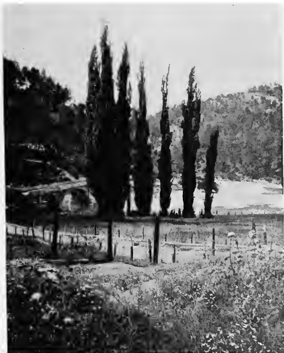
PLATE X The Stanislaus River, Near Tuttle town, "Running in a Deep and Splendid Cañon"