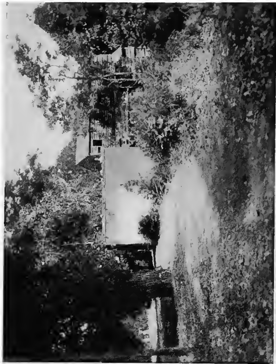
PLATE I Ruins of Coloma, a Name Forever Associated With the Wildest Scramble for Gold the World Has Ever Seen"