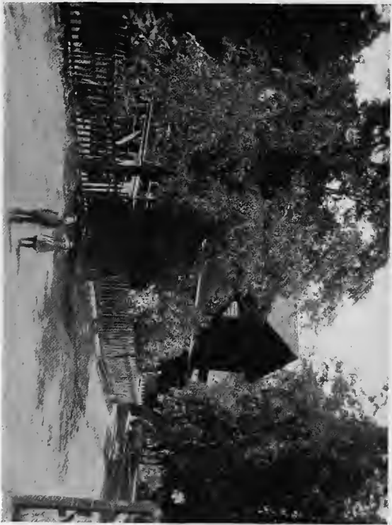
PLATE II The Tuttle town Hotel, Tuttle town; a Wooden Building Erected in the Early Fifties