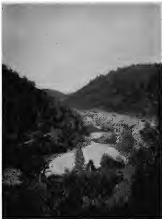
PLATE XX Middle Fork of the American River, Near Auburn, and Half a Mile Above Its Junction With the North Fork