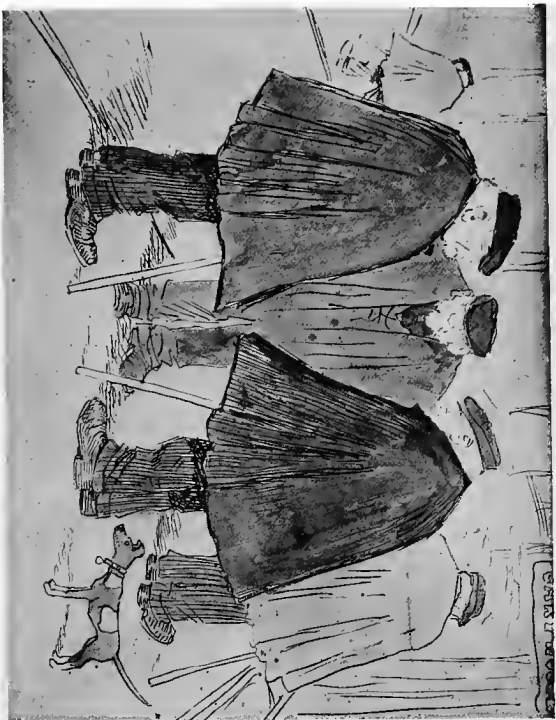
PLATE IV "A Mining Convention at Placerville"