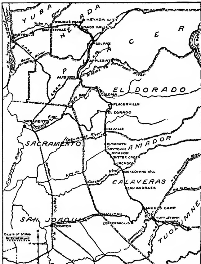
Map of the "Bret Harte Country," Showing the Route Taken by the Writer, Together With the Towns, Important Rivers, and County Boundaries of the Country Traversed