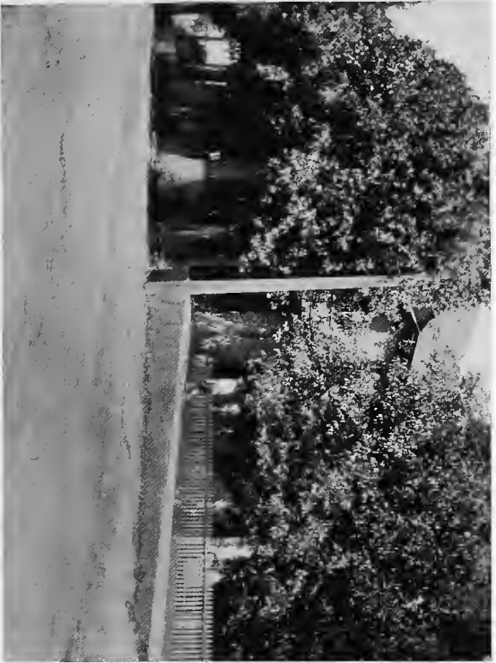
PLATE XXII The Western Hotel, Grass Valley. "The Wall and Pump Add a Quaint and Characteristic Touch"