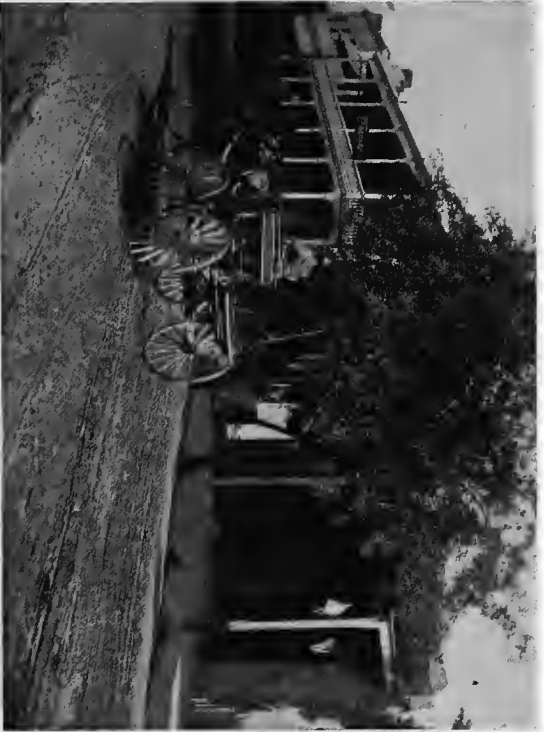
PLATE VIII Angel's Hotel, Angel's Camp, Erected in 1852, As Was the Wells Fargo Building Which Faces It Across the Street