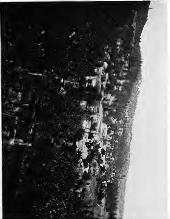
PLATE XVIII Placerville, the County Seat of El Dorado County, From the Road to Diamond Springs