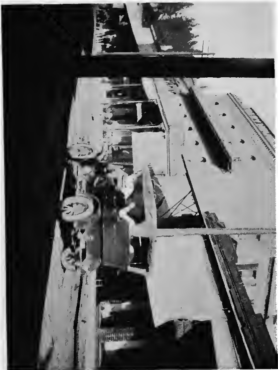
PLATE XIX The Cary House, Placerville. "It Was Here That Horace Greeley Terminated His Celebrated Stage Ride With Hank Monk"