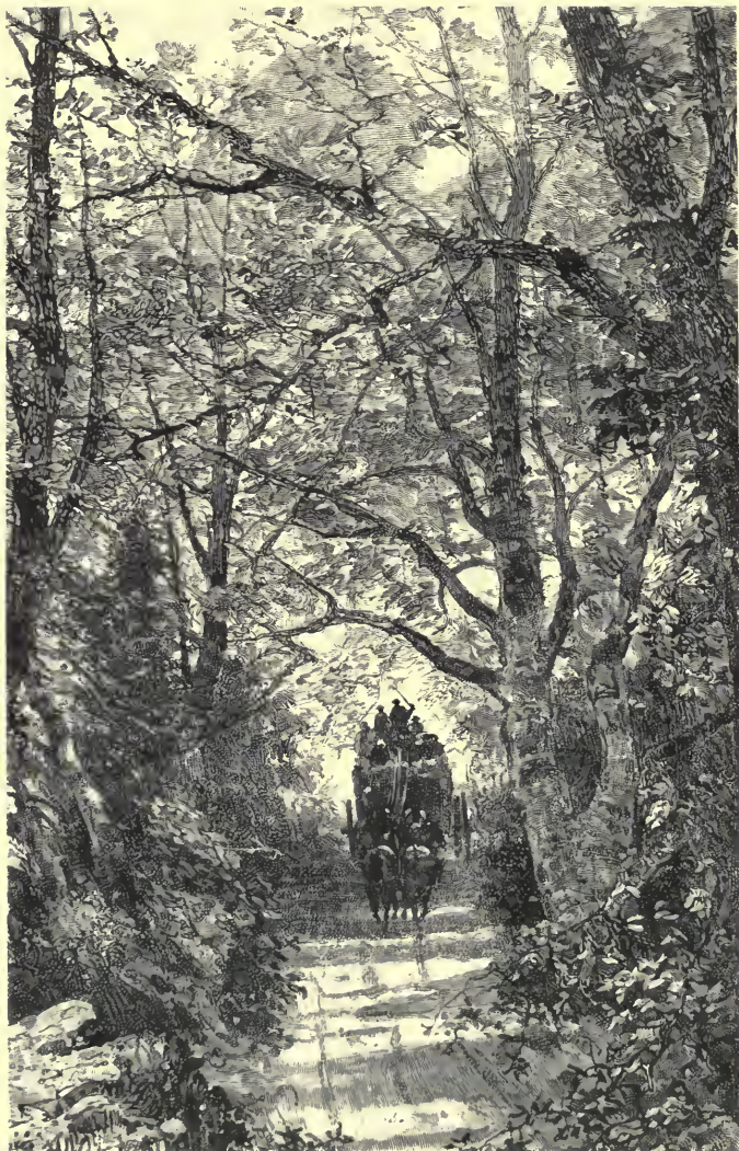
ON THE PROFILE ROAD