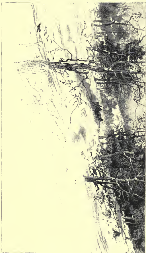
A MOUNTAIN ROAD