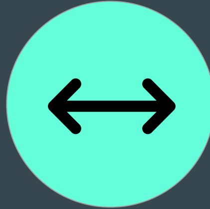
Adapted / Derivative works

The indicated is to use the CC License Compatibility Chart and, afterward, chose the most restrictive license among the ones adopted.