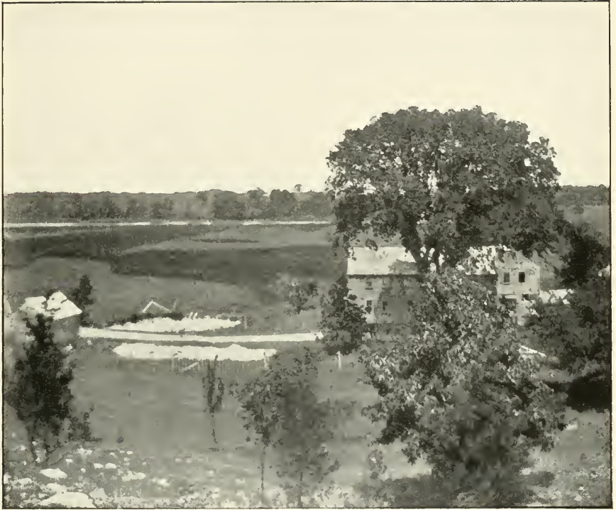
EDMUND RICE' HOMESTEAD, 1639 WITH VIEW OF THE OLD SPRING SUDBURY, NOW WAYLAND, MASS.