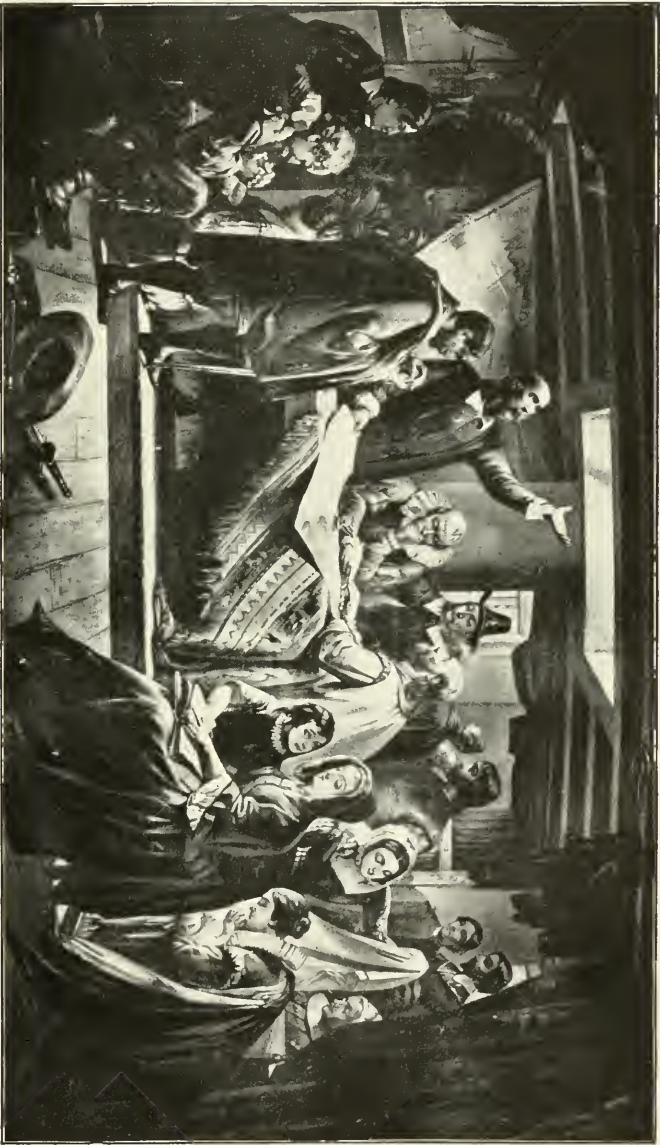
SIGNING THE COMPACT IN THE CABIN OF THE MAYFLOWER.