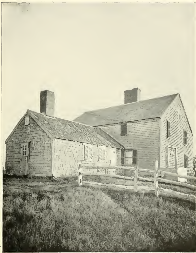
JOHN ALDEN 1 HOMESTEAD, DUXBURY, MASS.