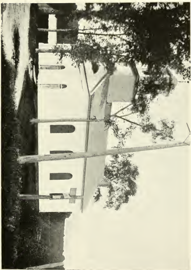
CONGREGATIONAL CHURCH, HOLDEN, MAINE.