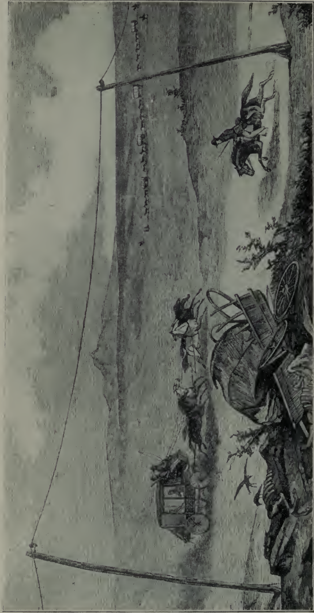
TRANSPORTATION AND COMMUNICATION ACROSS THE PLAINS THE TELEGRAPH, THE OVERLAND STAGE, THE EMIGRANT TRAIN, AND THE PONY EXPRESS RIDER