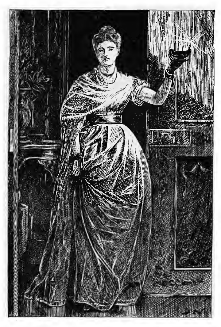
The lamps full ylow illumined and shadowed her CHAP 35