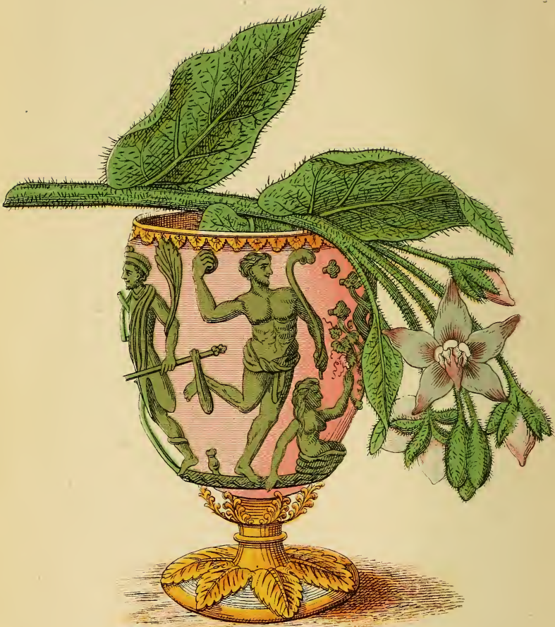
PRIG OF BORAGE IN GLASS CUP. OF THE THIRD OR FOURTH CENTURY.