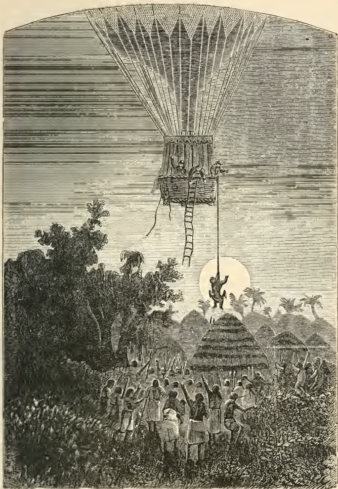
The astonishment of the people was great on seeing one of their number carried away.