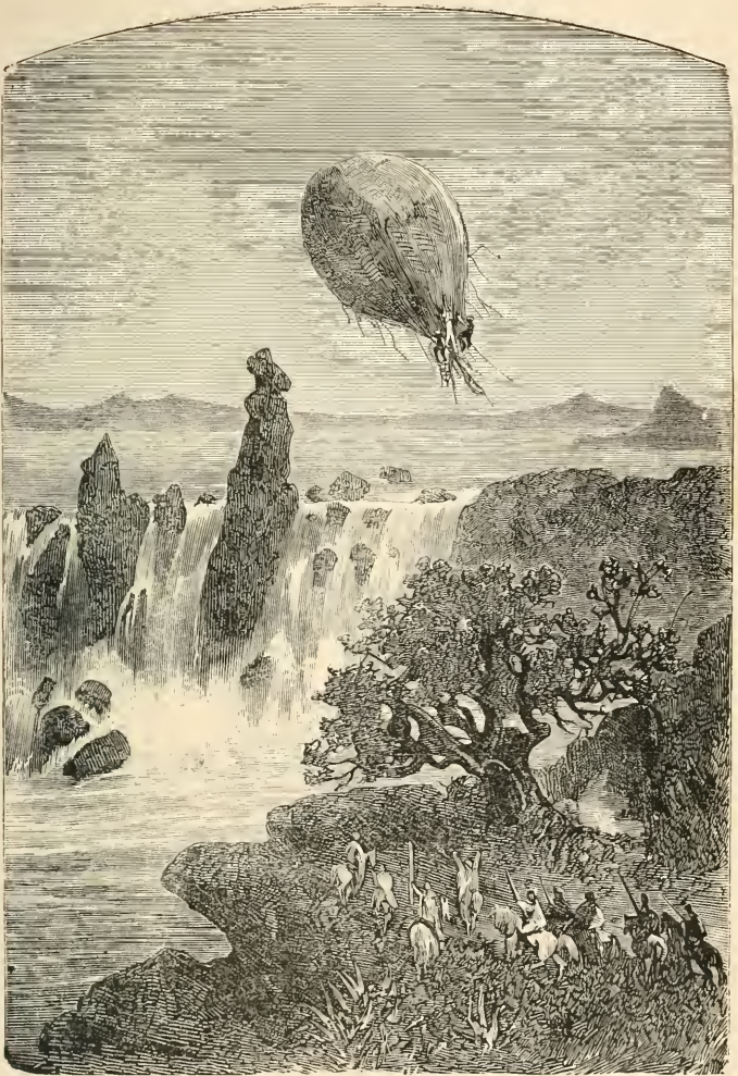
The balloon, entirely inflated by the rarefaction of the temperature, takes flight, touching the branches as it passes.