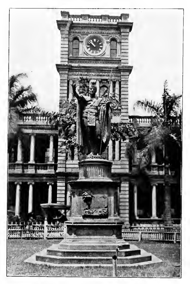
Statue of Kamehameha I, Honolulu.