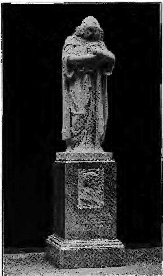
"MEMORY," BY WM. ORDWAY PARTRIDGE