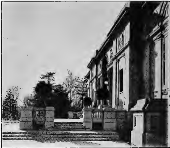
THE MEMORIAL ART GALLERY