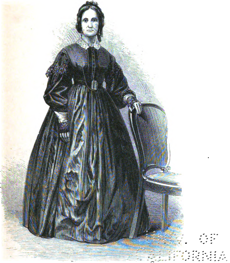
ELIZA SNOW, POETESS.