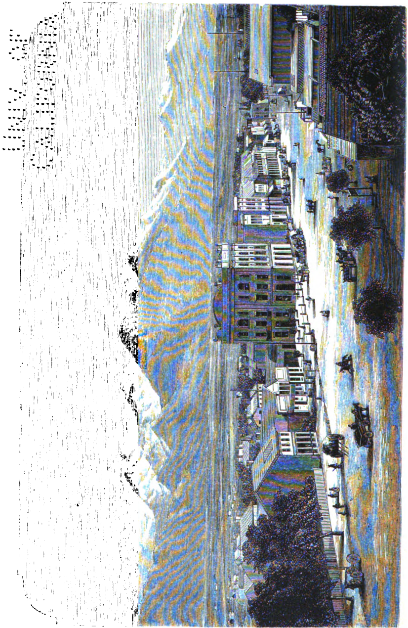
MAIN STREET, SALT LAKE CITY.