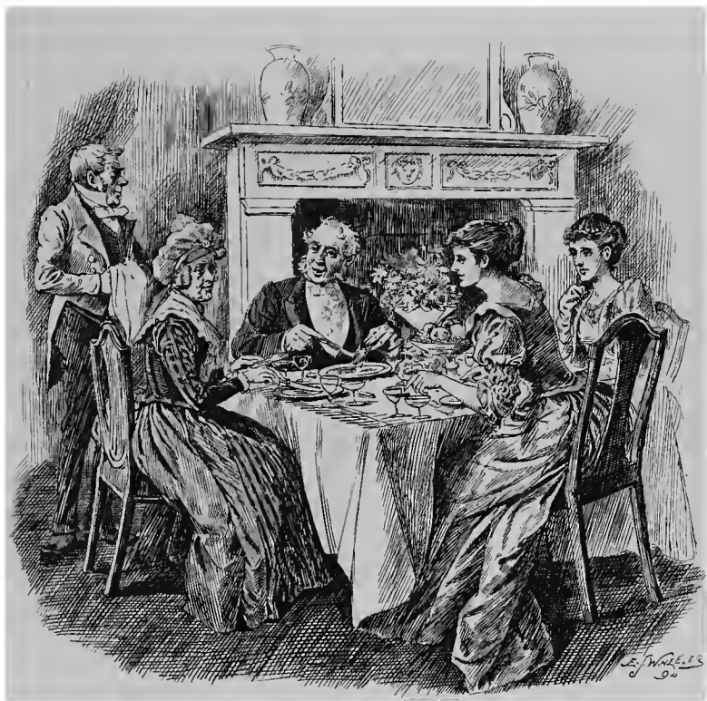
A small dinner party.