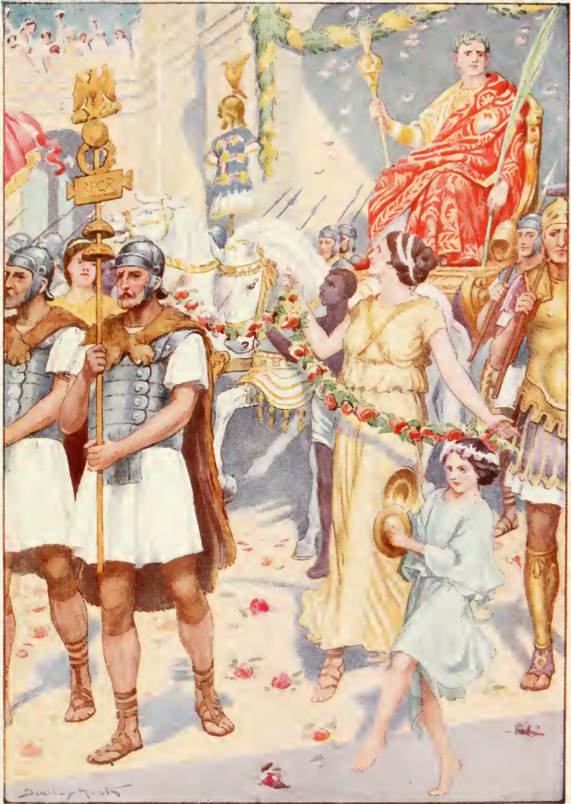
His progress was as that of a king.