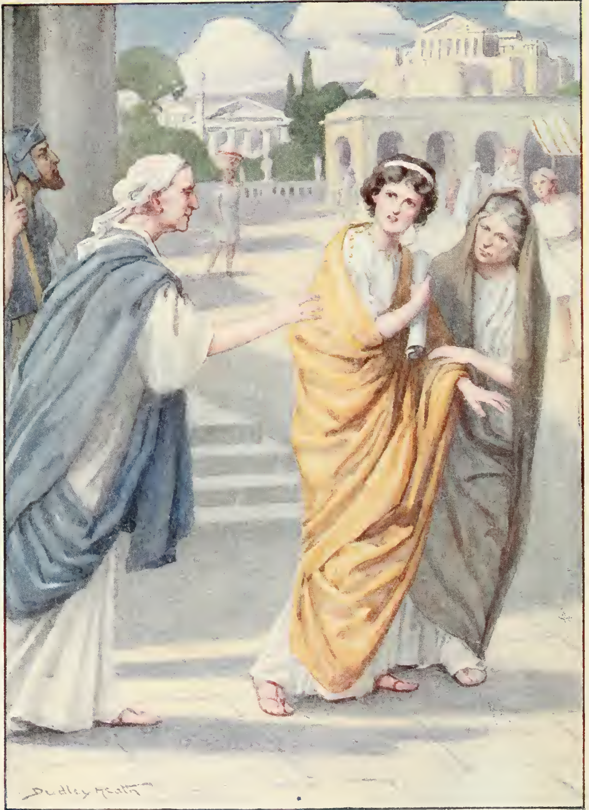
Verginius left his beautiful young daughter Verginia in the care of her nurse