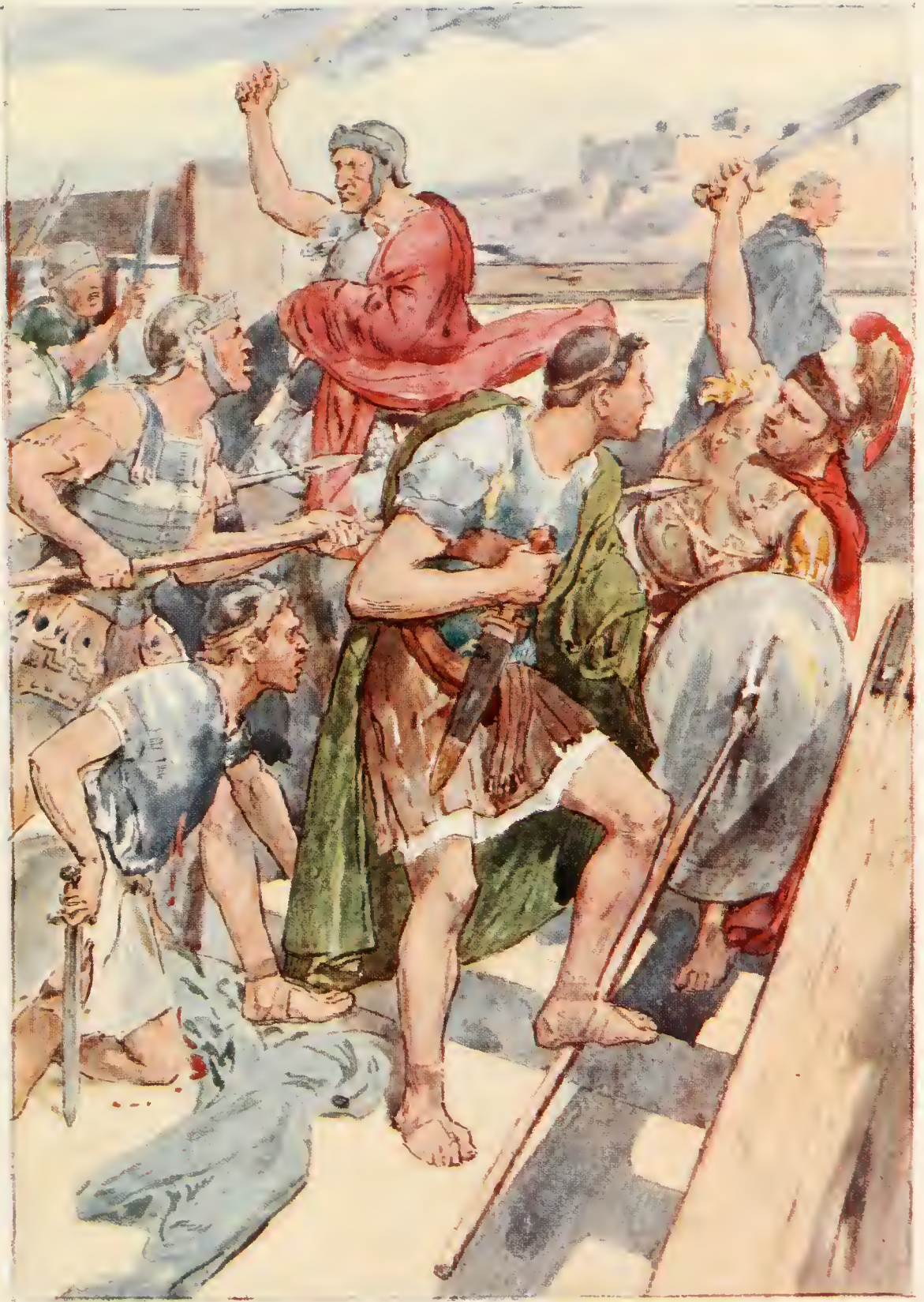
Here it would be possible, he thought, to hold the enemy at bay.