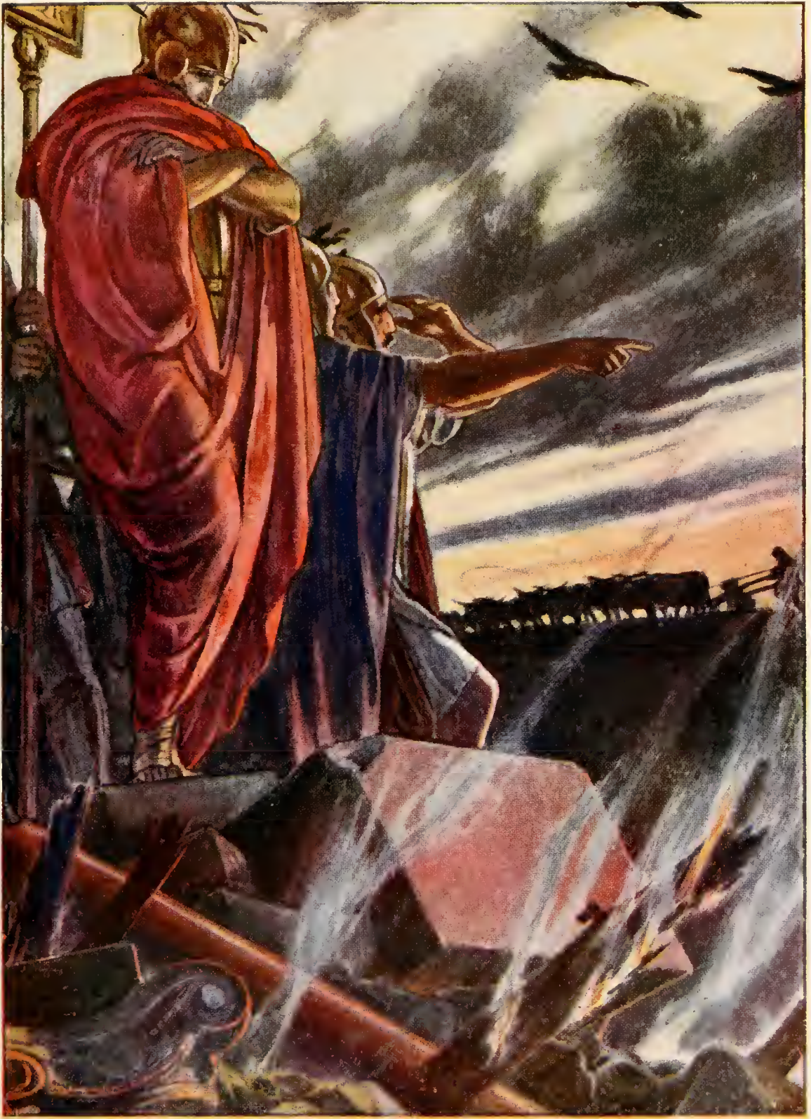
The City was given to the flames.