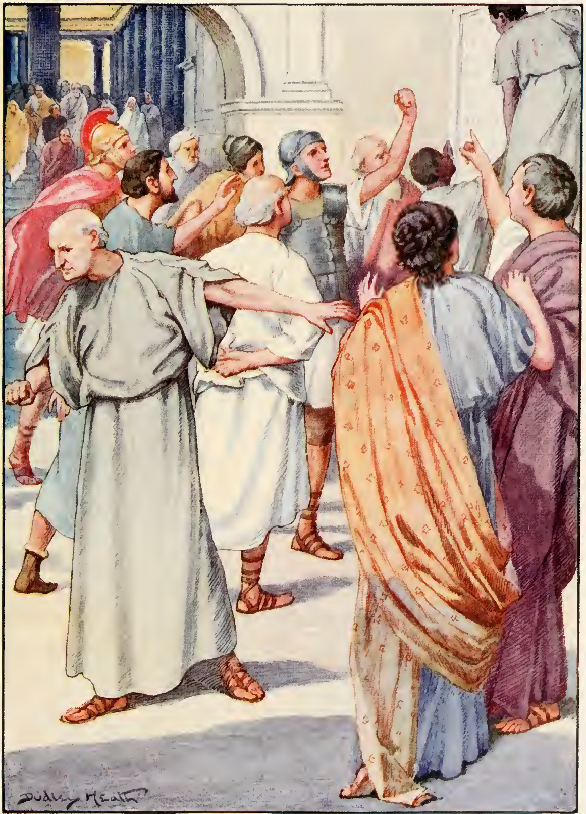
Lists of those who were doomed were hung up in the Forum.