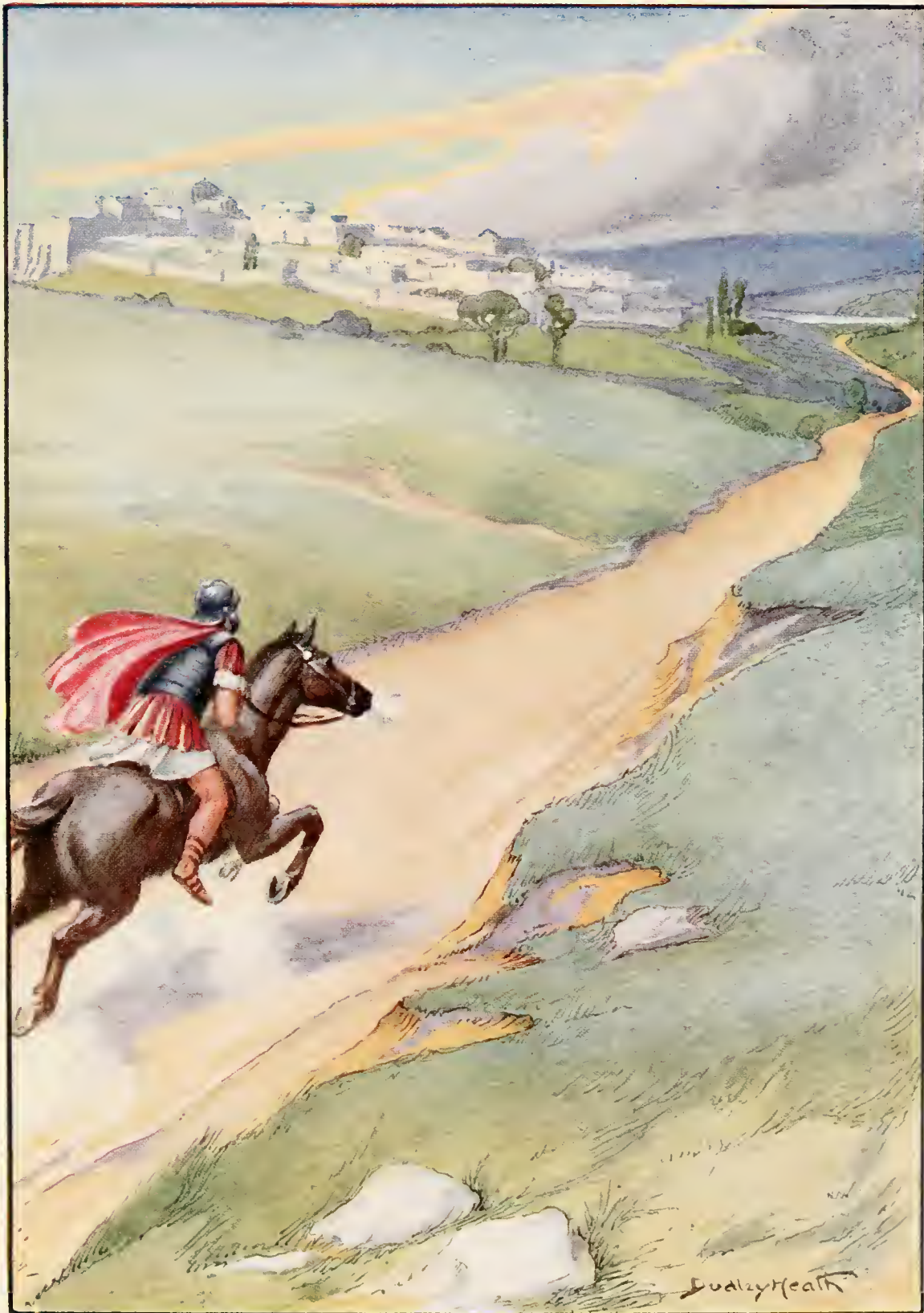
A messenger was seen spurring his horse toward the city.