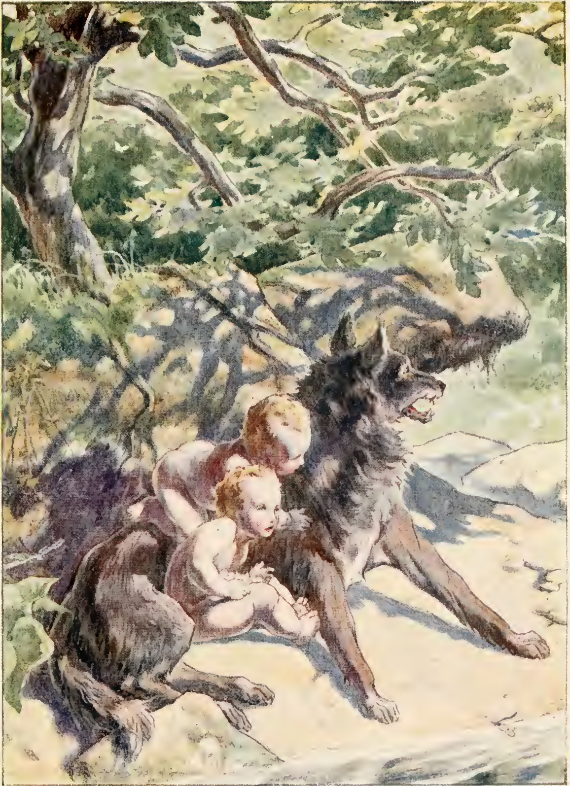
A she-wolf, coming to the edge of the river to drink, heard their cries.