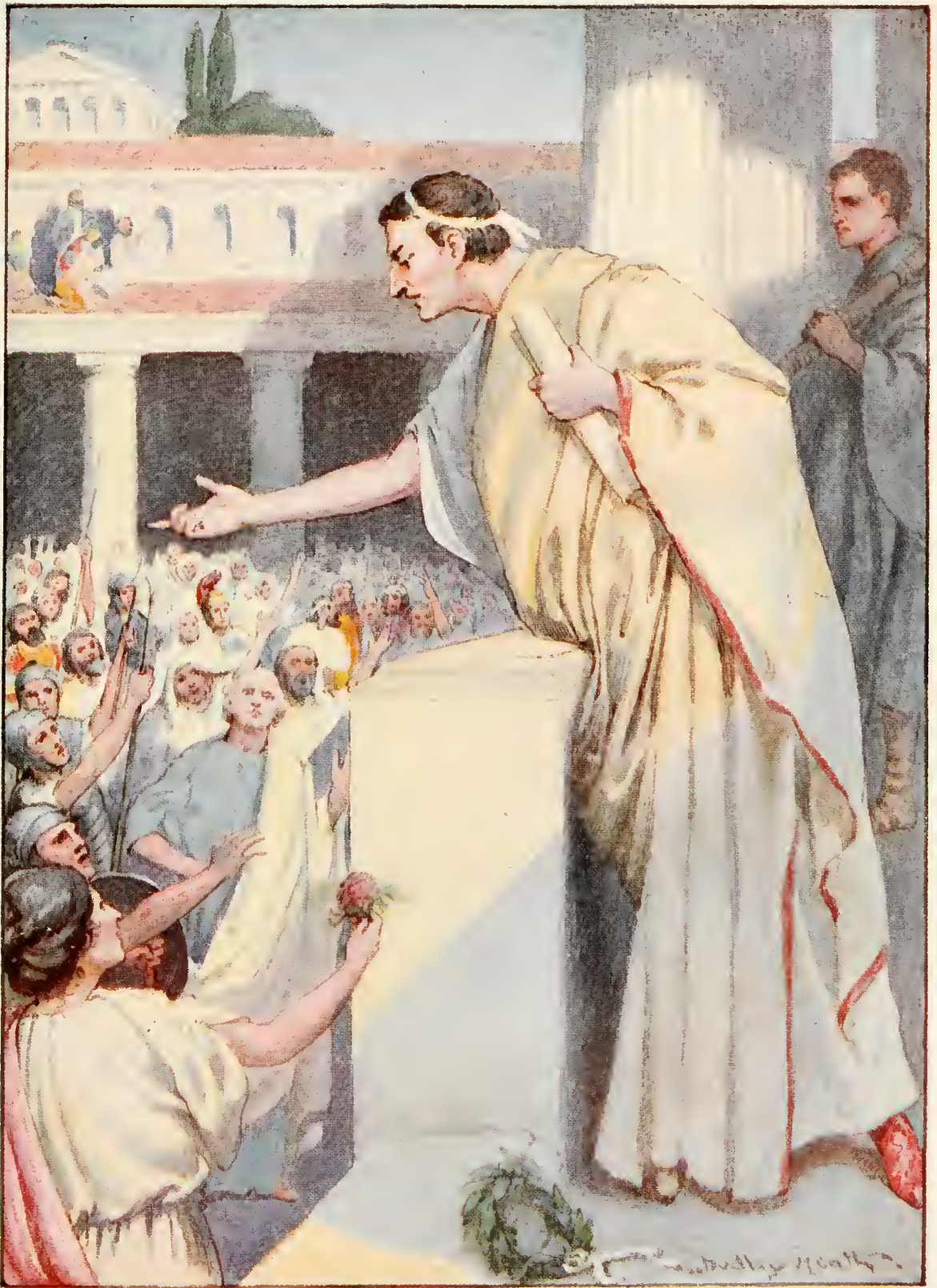
The following morning Cicero made another speech against Catiline.