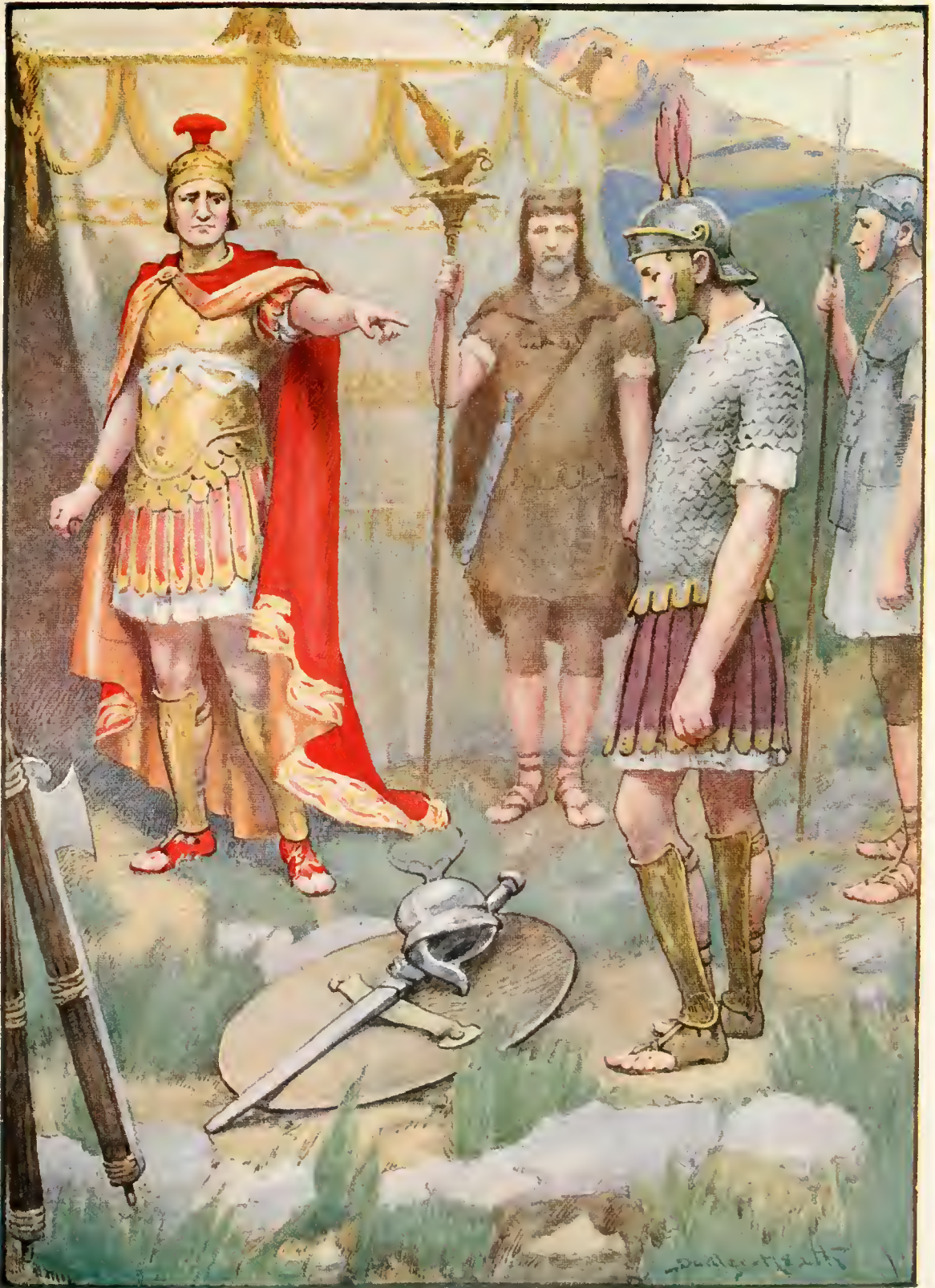
The youth laid the arms he had taken from his foe at his father's feet.