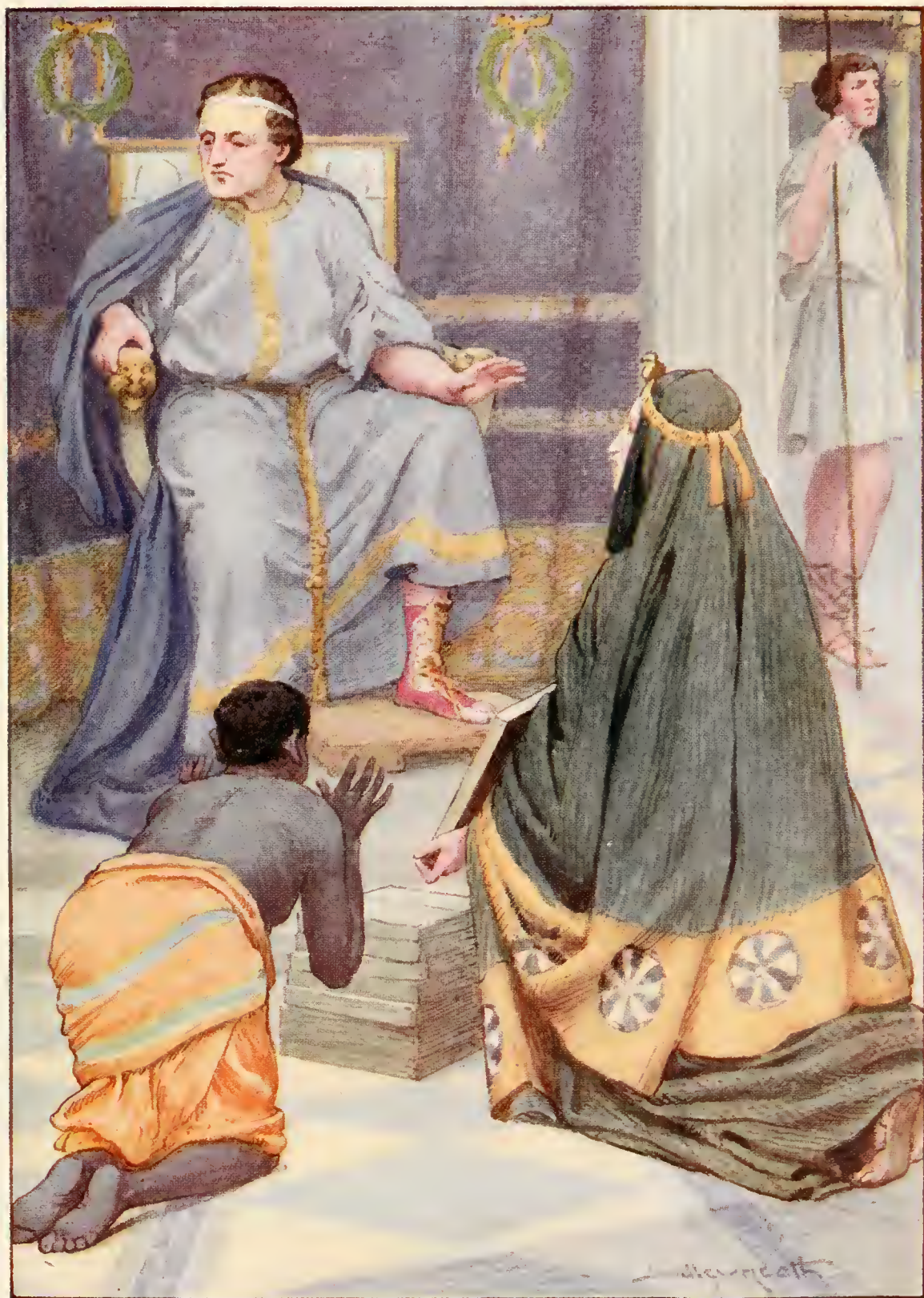
She carried in her arms nine books.