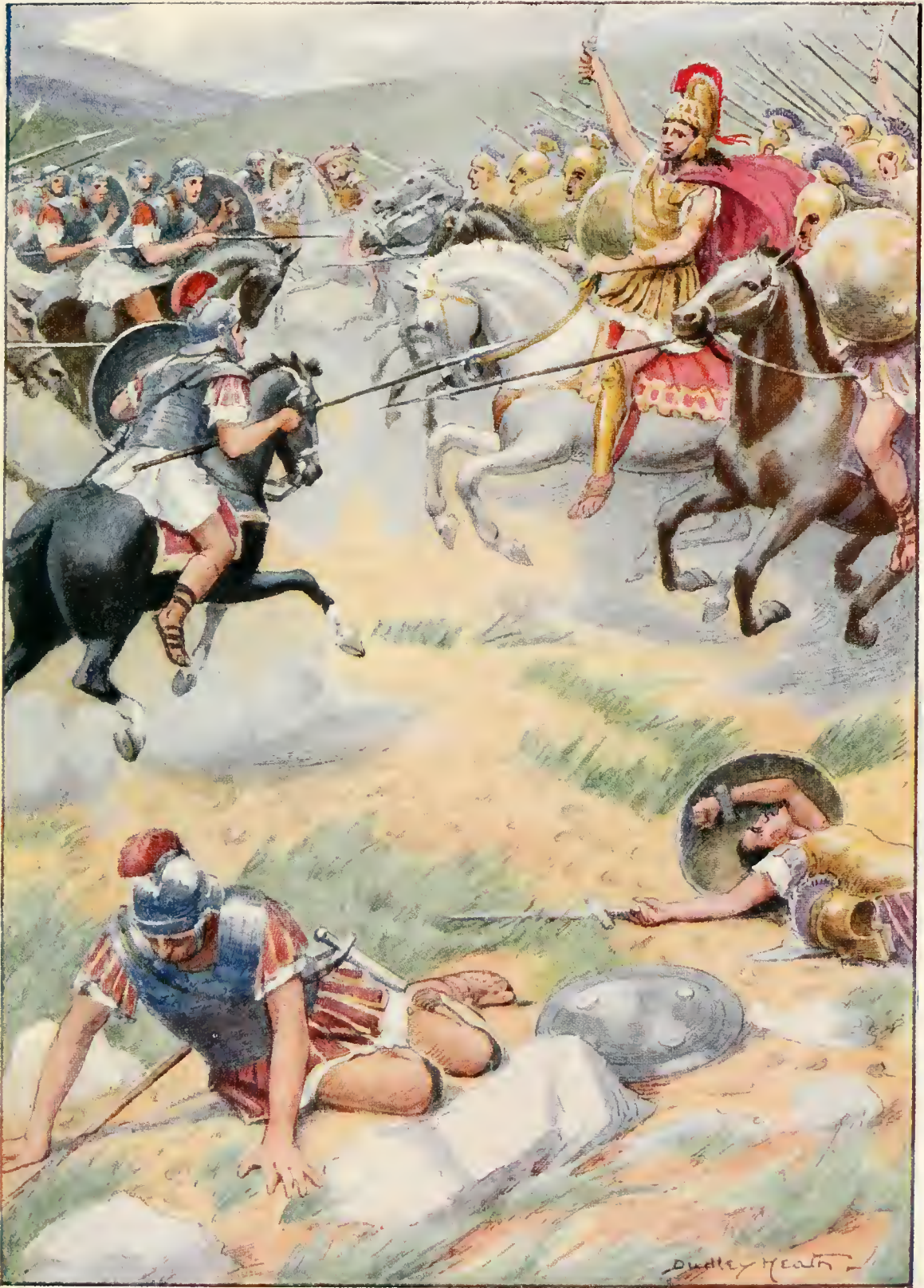
The armour of Pyrrhus was richer and more beautiful than that of his soldiers.