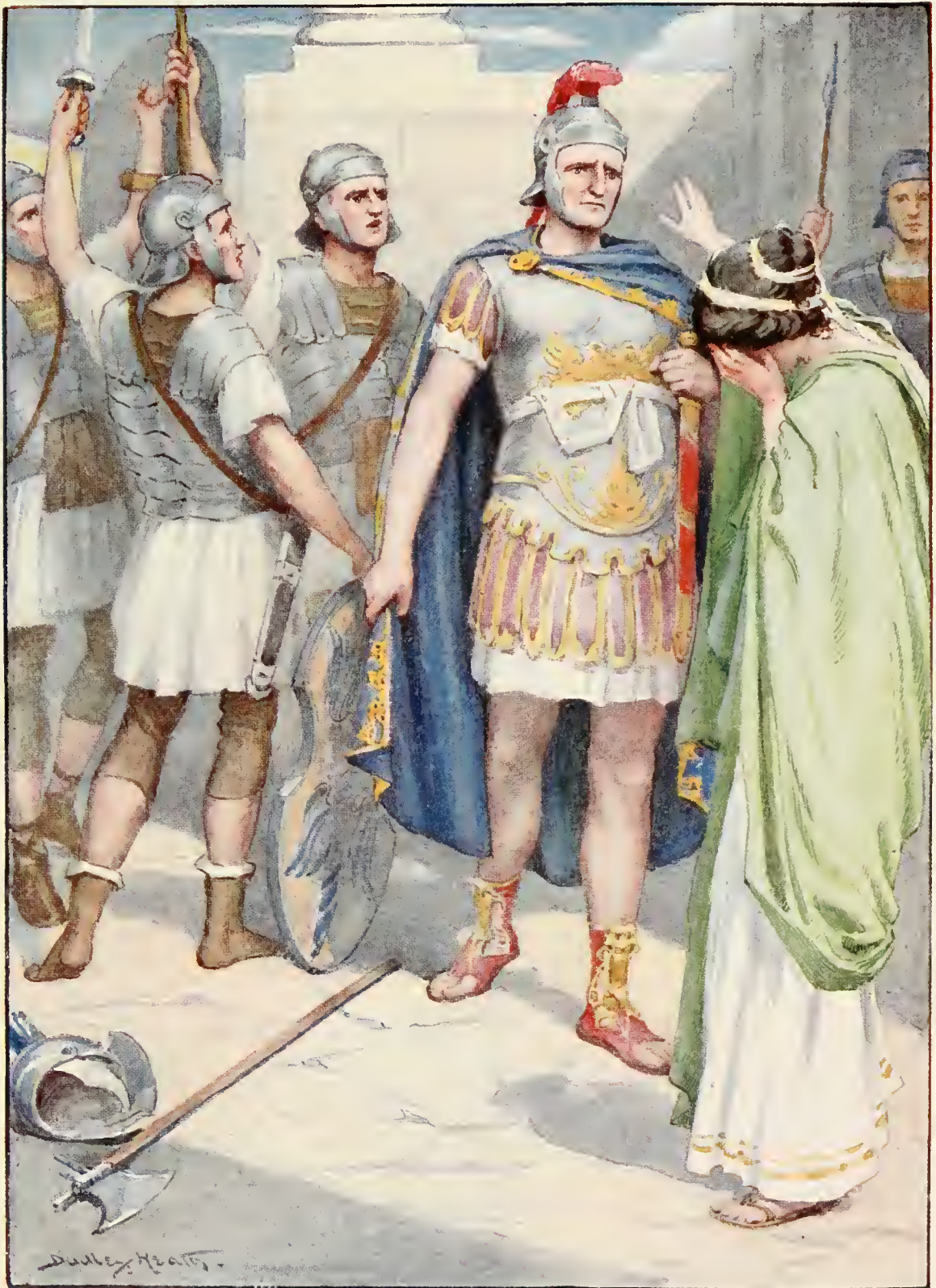
When she saw Horatius wearing on his shoulders the cloak of her betrothed, she broke into bitter sobs