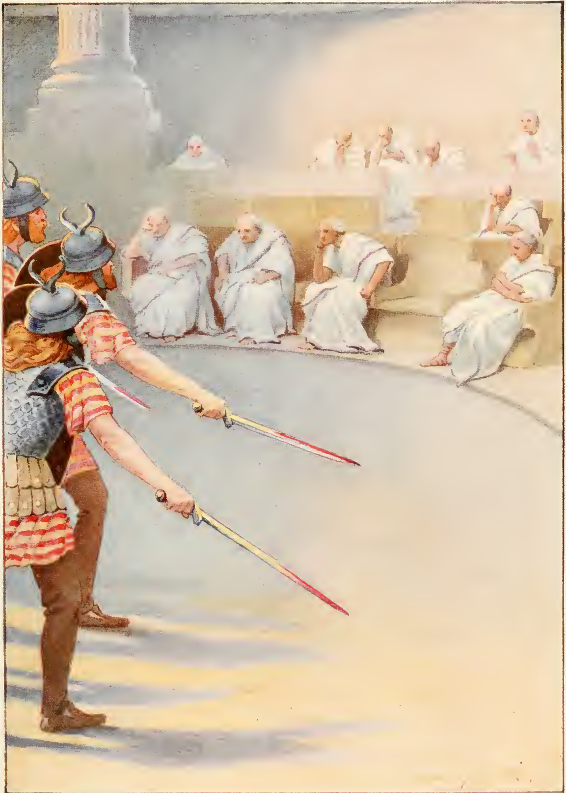
Seated in chairs of ivory, sat a number of strange, venerable old men.