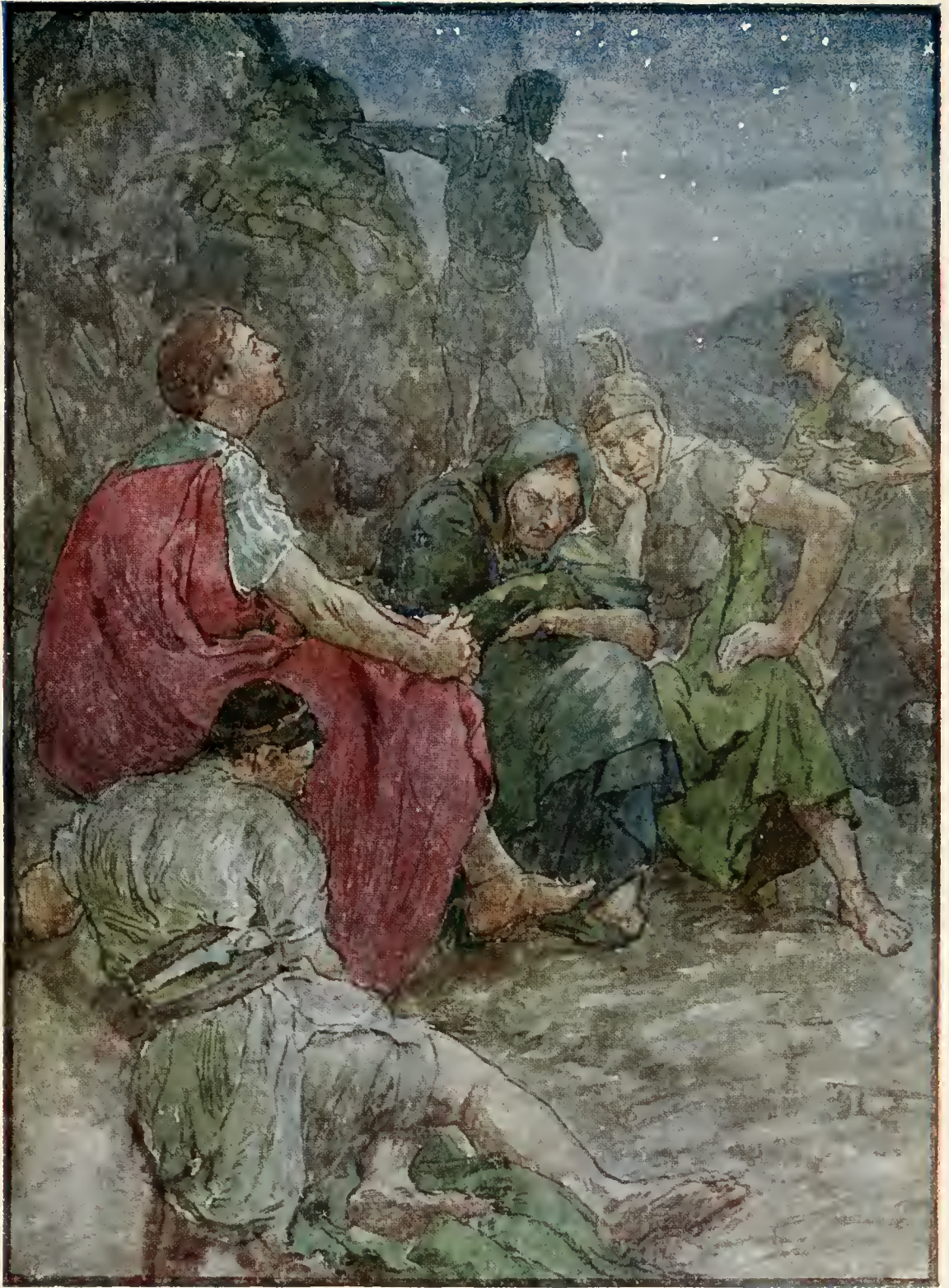
Here, sheltered by steep cliffs, he sat down to rest.