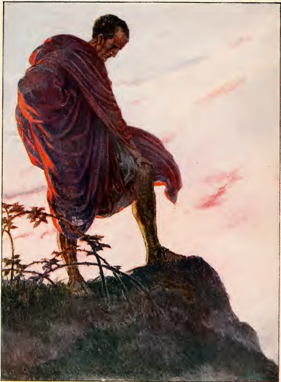
Looking down upon the stream, he stood awhile deep in thought.