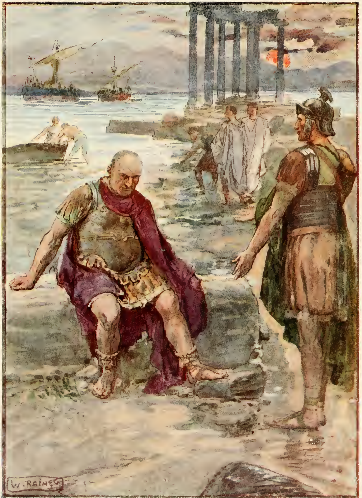
Gaius Marius sitting in exile among the ruins of Carthage.