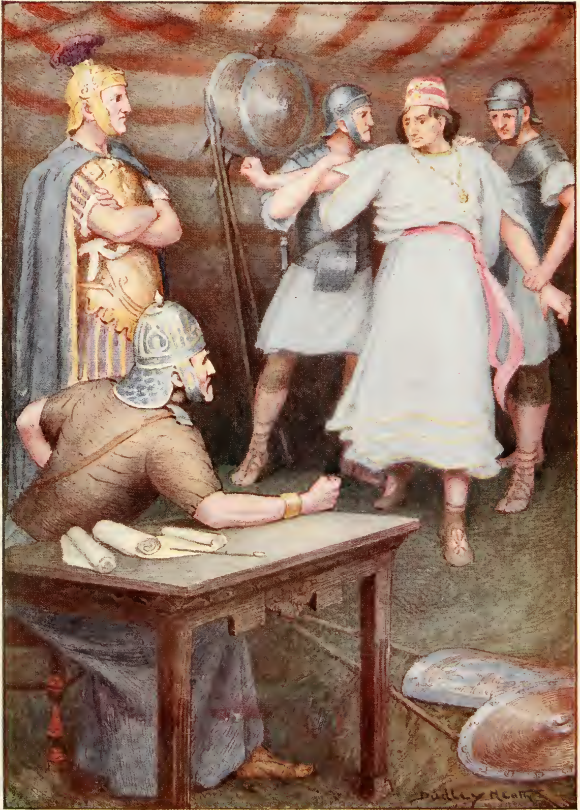
Jugurtha came to the tent of his father-in-law unarmed.