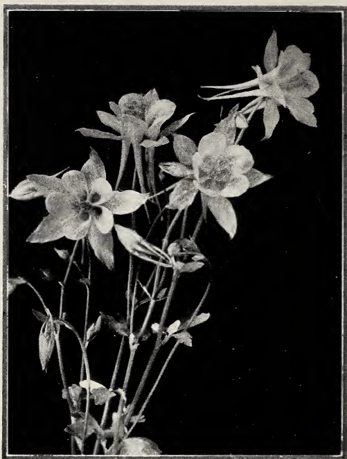
Long-spurred Hybrid Columbines