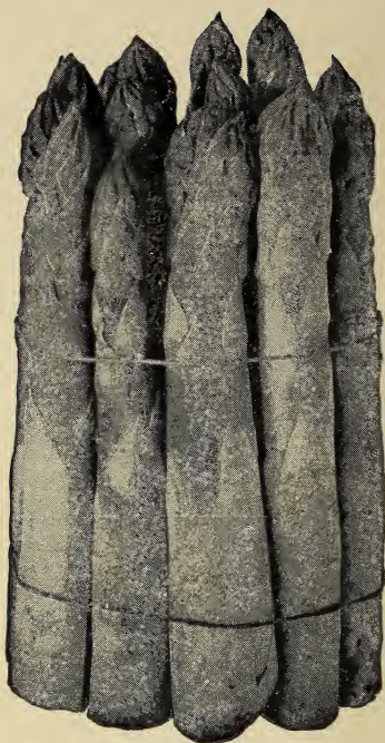
Washington Pedigreed Asparagus