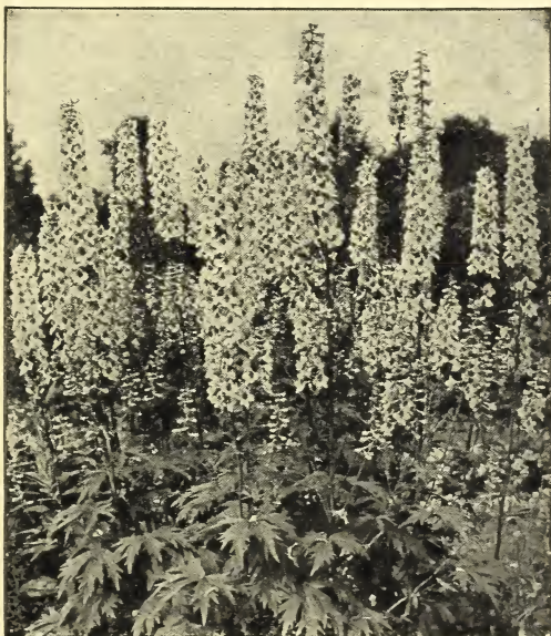
BRISTOL HYBRID DELPHINIUMS (See page 1)

DWARF FRUITS • BEDDING PLANTS FLOWERING SHRUBS