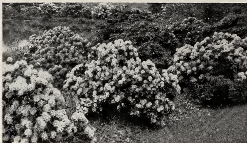
Planting of Rhododendrons