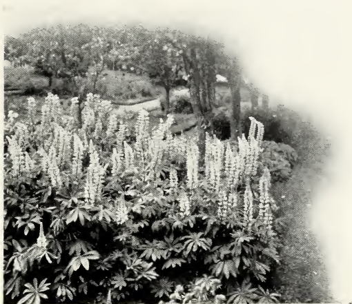
Planting of Lupinus polyphyllus