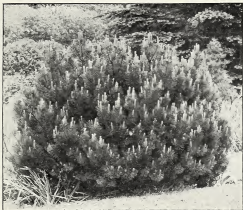
Pinus montana Mughus. See page 20