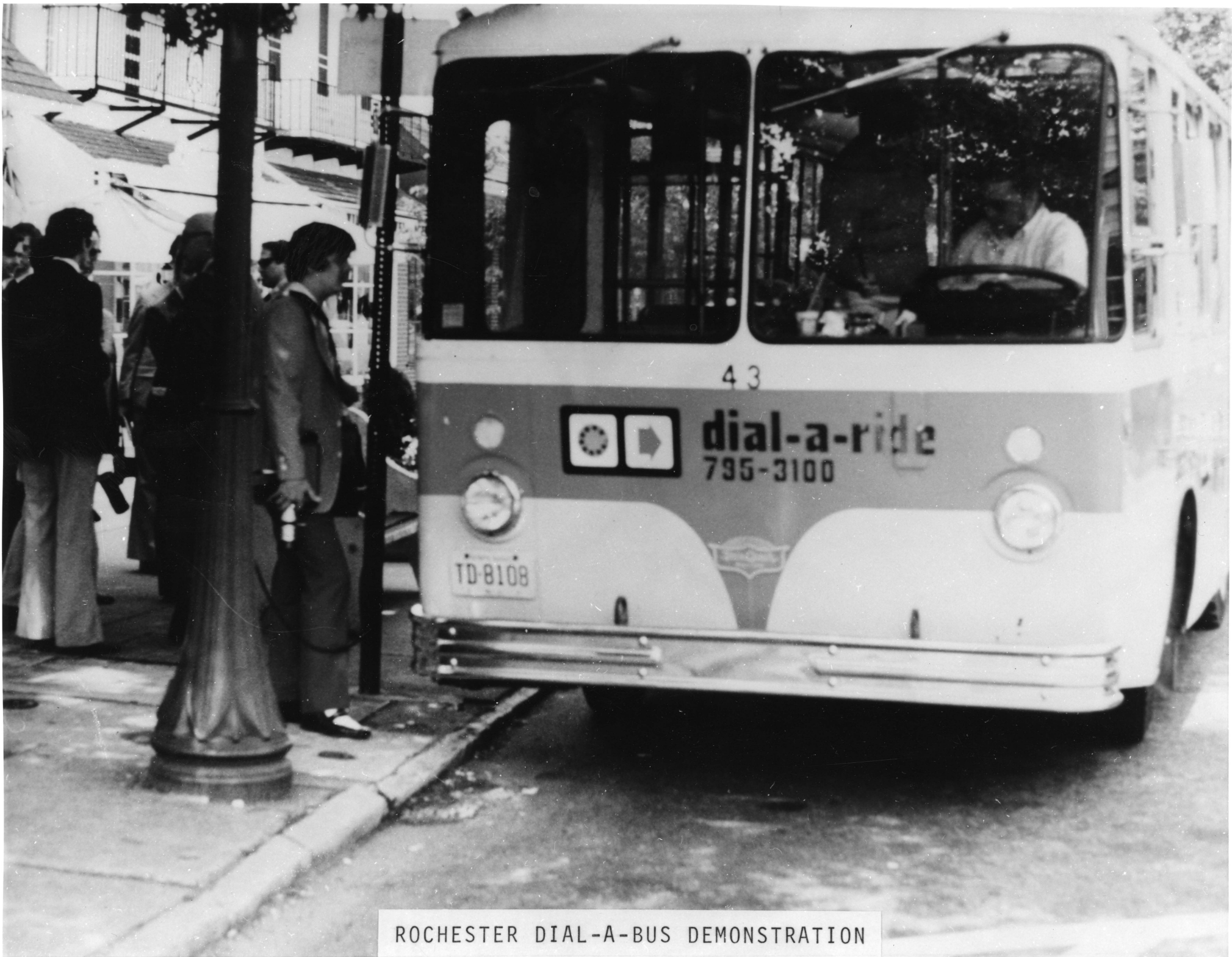
ROCHESTER DIAL-A-BUS DEMONSTRATION