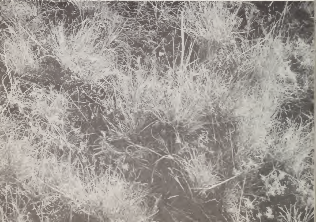
Understory of C. ledifolius / F. idahoensis .