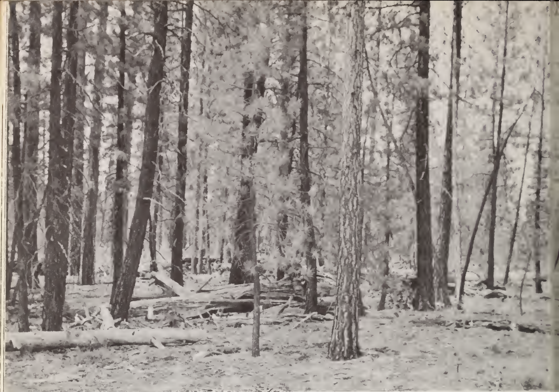
General view of the Festuca phase of the Pinus ponderosa / Purshia tridentata / Festuca idahoensis ecosystem. Note the paucity of P. tridentata .