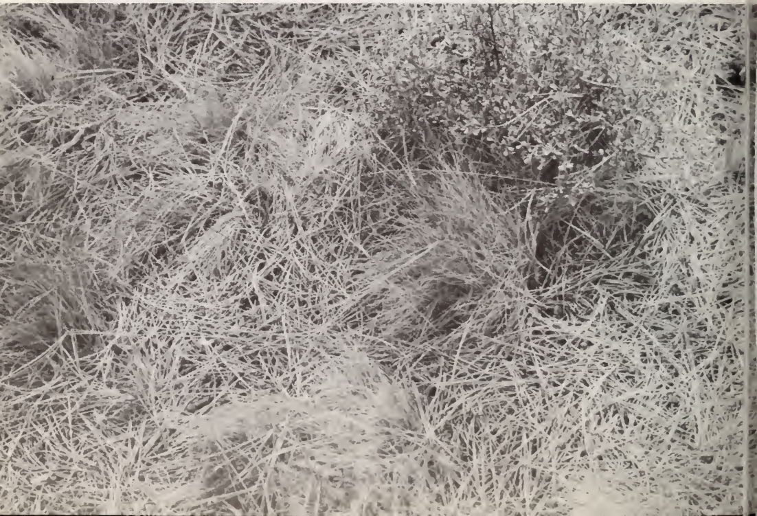
A closeup view of the P. ponderosa / P. tridentata / F. idahoensis ecosystem.