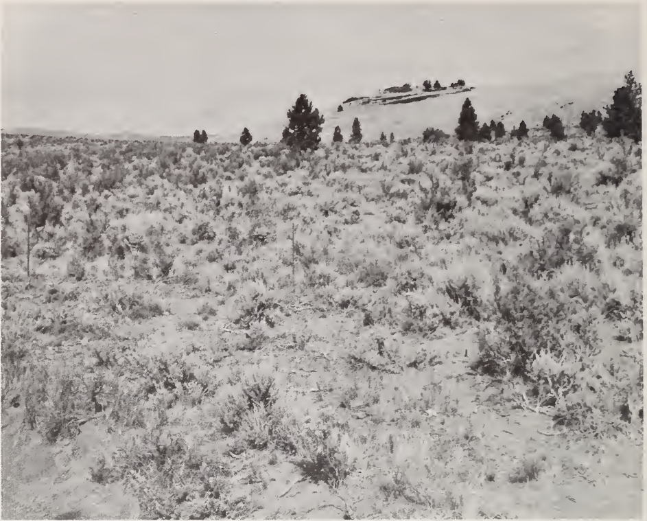
Ground vegetation of the A. tridentata - P. tridentata / F. idahoensis ecosystem. Note the disturbed appearance of the ground surface and the high incidence of broken and trampled shrub stems.

what is generally considered the "transition range," i.e., the spring-fall range. However, in the past 12 years, this area has been accessible for the greater part of most winters and during that time has never been unavailable during an entire winter.