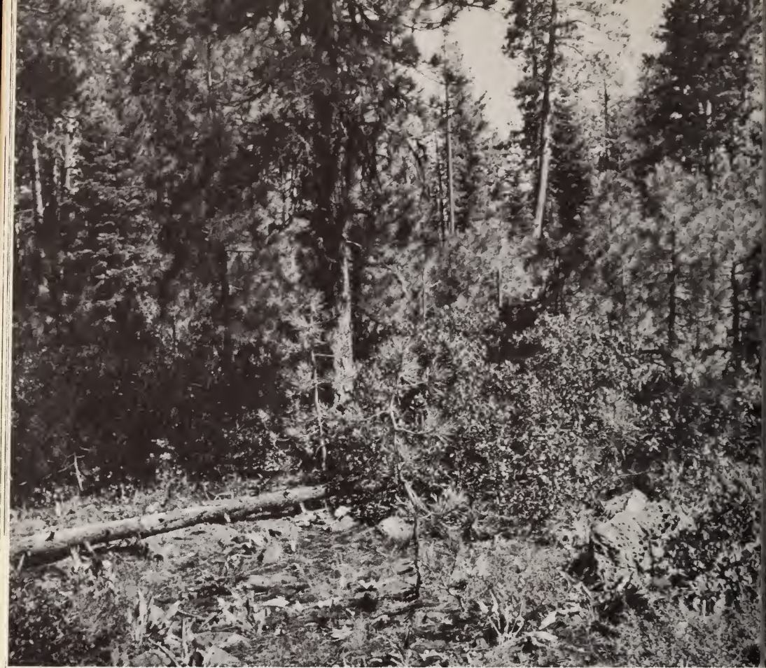
Pinus ponderosa / Arctostaphylos patula / Festuca idahoensis ecosystem.

of their relationship is the occurrence in the parent ecosystem of dead remnants of Arctostaphylos patula which were crowded out by dense patches of tree reproduction.