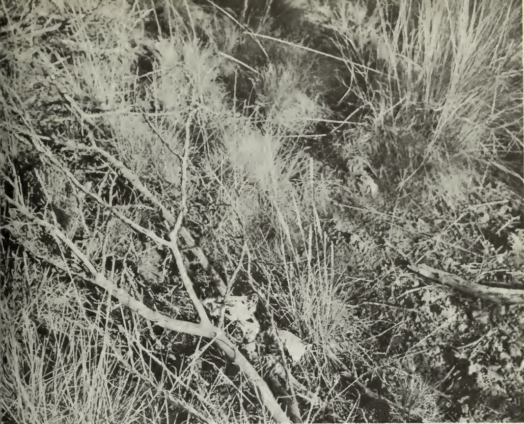
Understory view of C. ledifolius / F. idahoensis - A. spicatum ecosystem. Note the prominence of A. spicatum .

is hiding cover, followed by forage. This relationship might be reversed with rehabilitation.