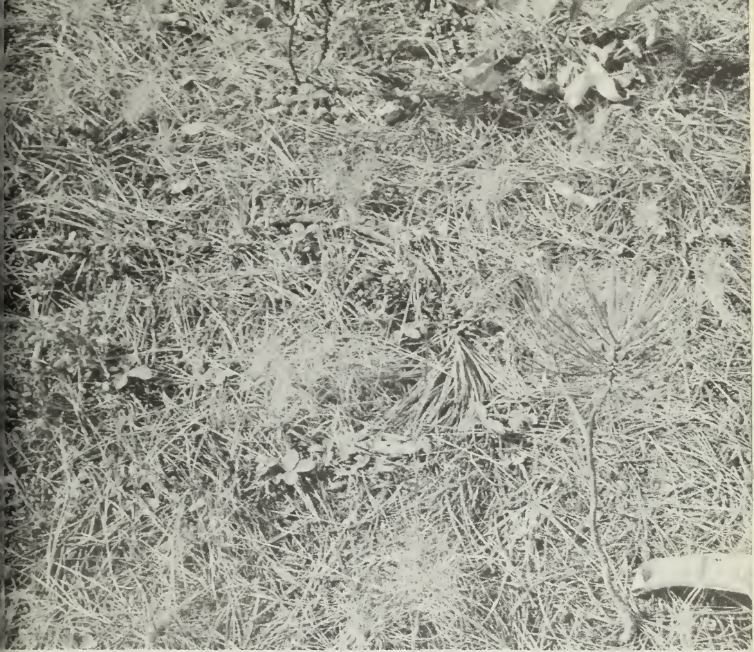
Ground cover closeup of the P. ponderosa / A. patula / F. idahoensis ecosystem.

temporary increase in herbaceous forage, but the long-range value would be small.