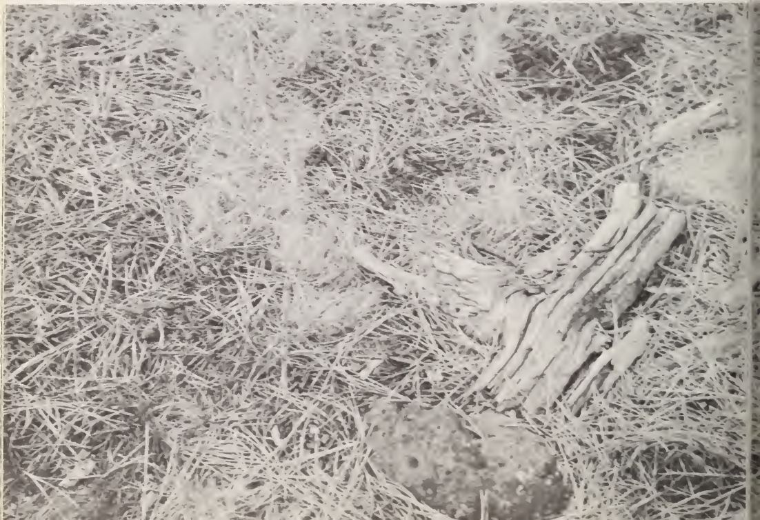
Closeup of the Festuca phase of the P. ponderosa / P. tridentata / F. idahoensis ecosystem.