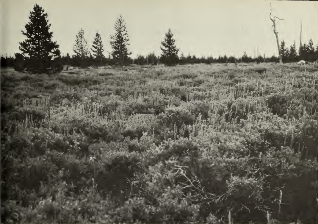
A tall, dense stand of Artemisia tridentata indicates high moisture in the A. tridentata / Stipa occidentalis - Lathyrus ecosystem.