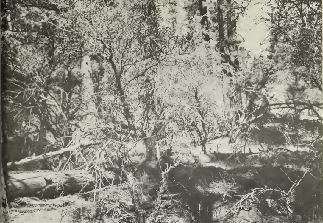
Pinus ponderosa - Cercocarpus ledifolius / Festuca idahoensis ecosystem. Note the paucity of shrubs.