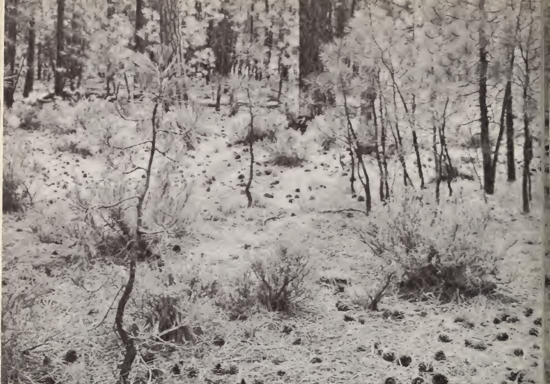
A general view of the Pinus ponderosa / Purshia tridentata / Festuca idahoensis ecosystem. Note the scattered clumping of P. ponderosa reproduction.