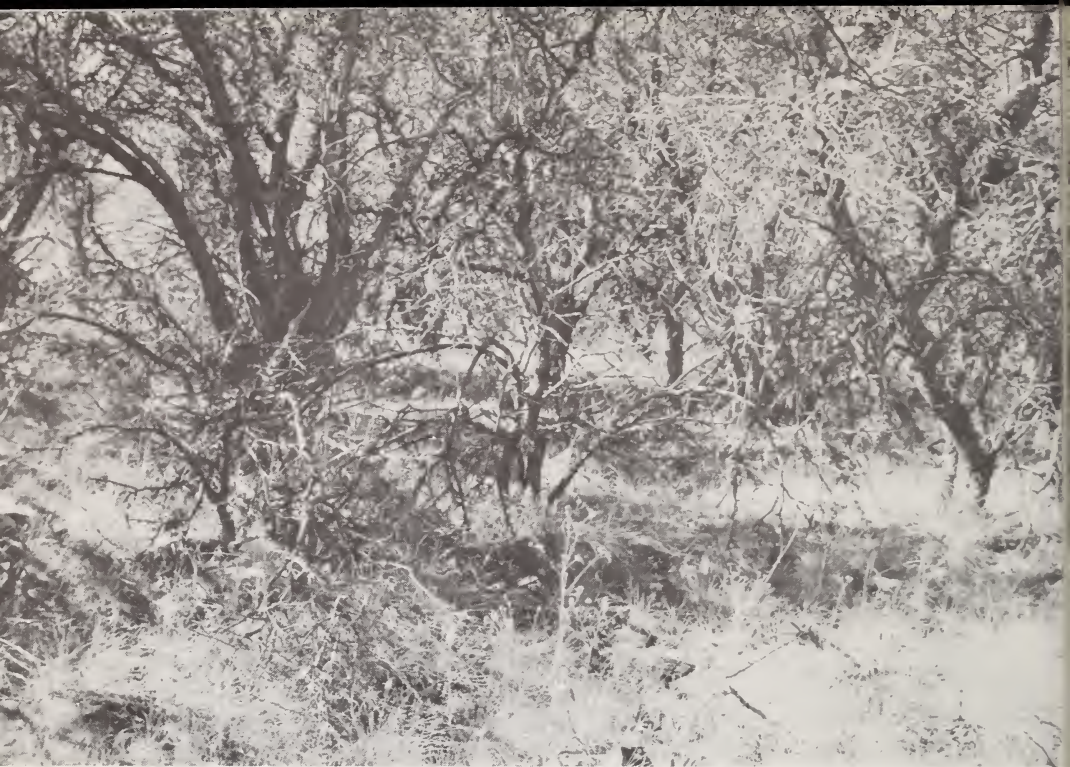
Cercocarpus ledifolius / Festuca idahoensis ecosystem. Note surprisingly dense stand of F. idahoensis under this heavy canopy.