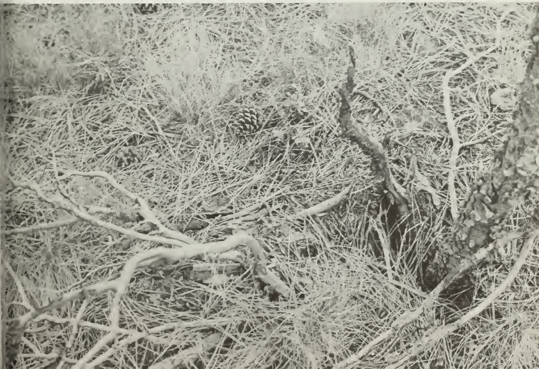
A close view of the ground cover in the P. ponderosa - C. ledifolius / F. idahoensis ecosystem illustrating F. idahoensis dominance.