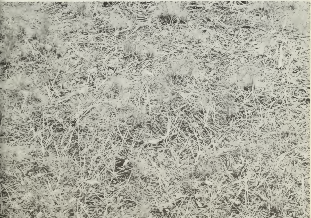
Pinus contorta / Festuca idahoensis ecosystem ground cover illustrating the strong dominance of F. idahoensis .