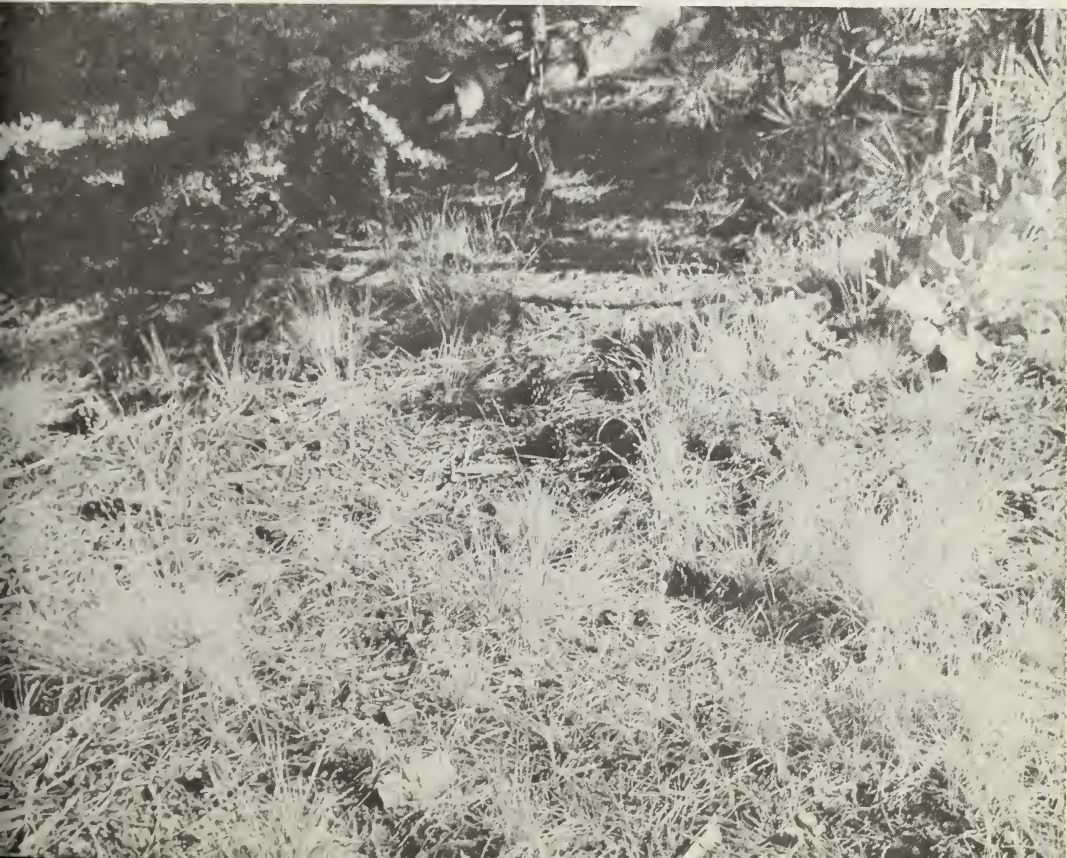
Understory view of P. ponderosa - A. concolor / F. idahoensis .

If a rehabilitation program is considered and grasses, particularly fescue, are dominating the site, scarification may be necessary.