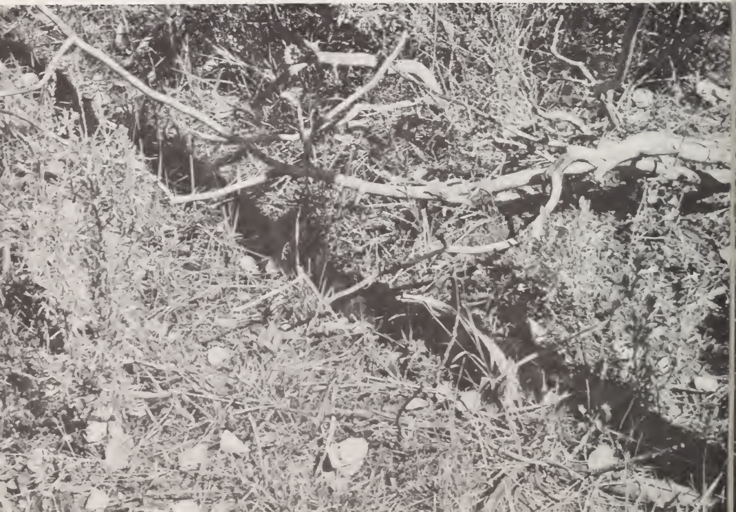
Understory illustration of P. tremuloides / A. tridentata / B. carinatus ecosystem.