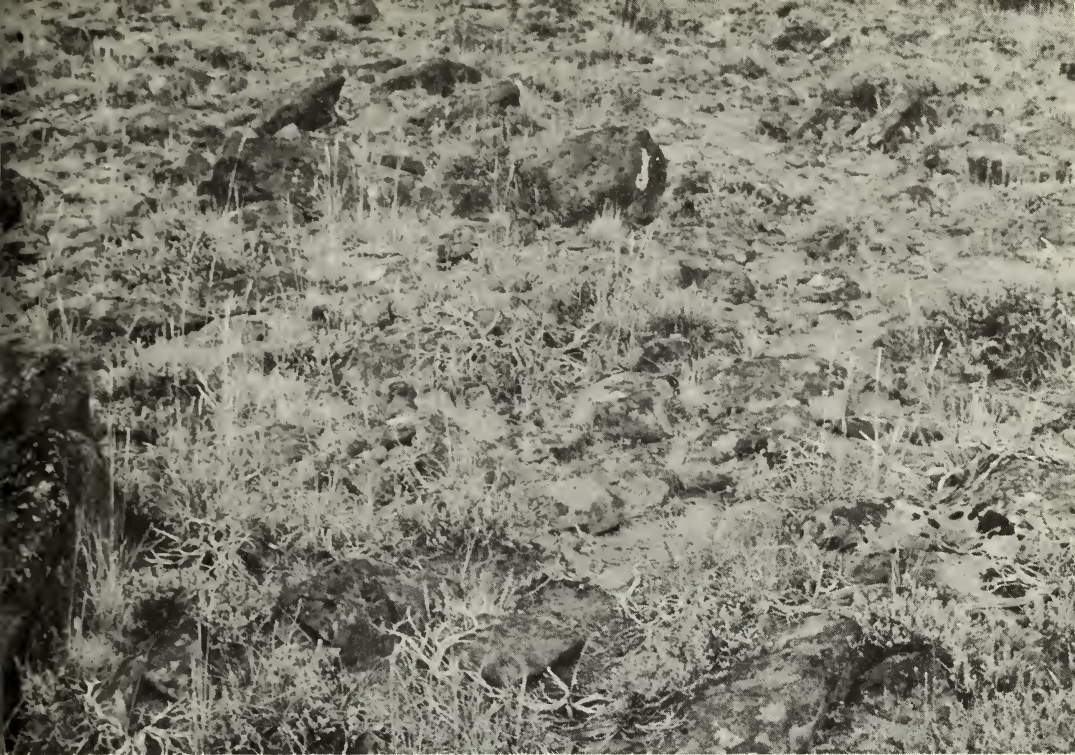
Surface stone in the A. arbuscula / Koeleria cristata ecosystem is highly variable.

Severe frost heave hampers the development of plants in the Artemisia arbuscula / Koeleria cristata ecosystem.