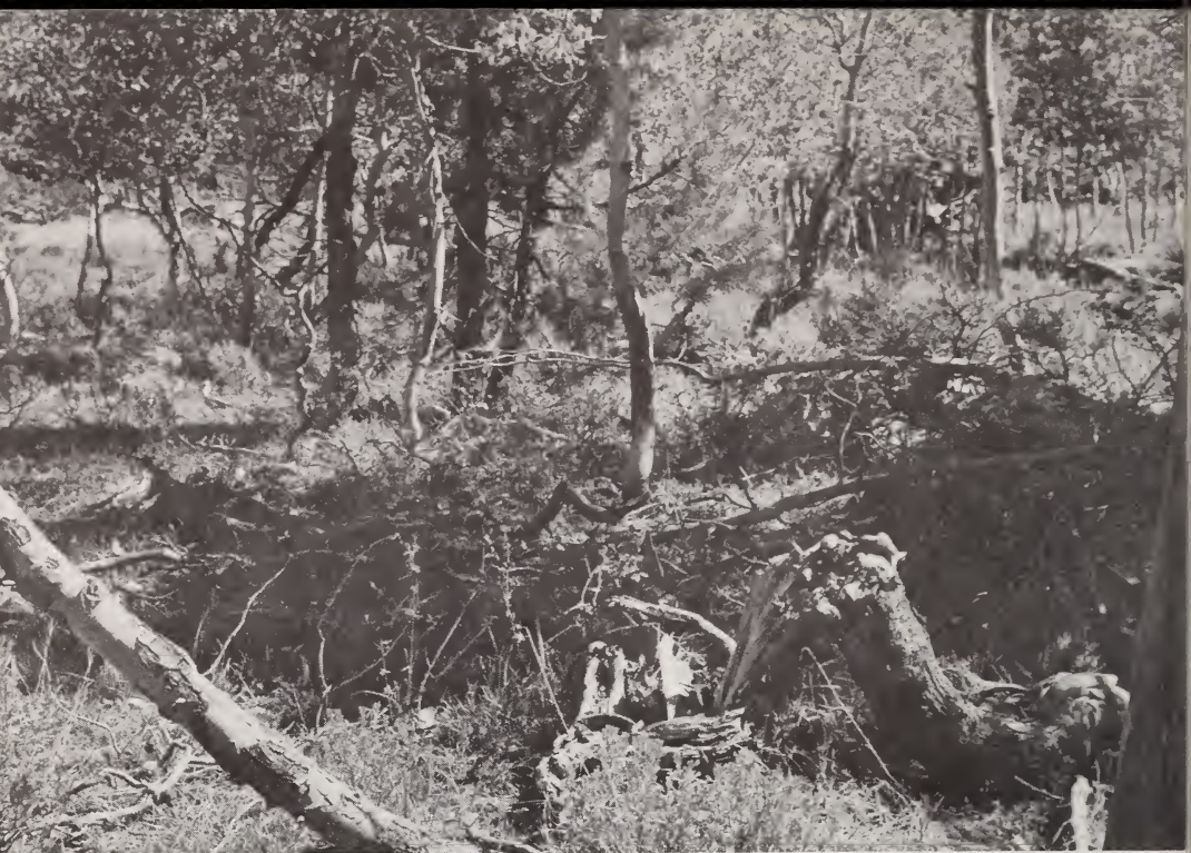
Populus tremuloides / Artemisia tridentata / Bromus carinatus ecosystem.