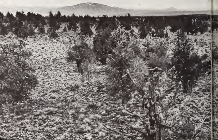
Silver Lake deer range, looking south. Mountains in the background illustrate the summer range and its topography.

of 7,000-foot Winter Ridge, an upthrust escarpment 20 miles long, to a low of 4,700 feet and then gradually climbs to 8,242-foot Yamsay Mountain 30 miles away. From north to south it follows the Winter Ridge-Yamsay Mountain trough from the timber's edge near Silver Lake south for approximately 15 miles, rising from 4,700 feet to 5,500 feet. Hager Mountain, a cone, rises to 7,000 feet out of the trough center near the north edge of the range.