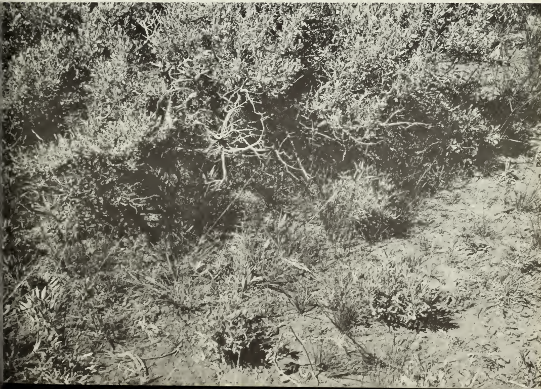
A. tridentata / S. occidentalis - Lathyrus ecosystem showing grass stand in shrub inter-spaces. Note young A. tridentata in openings.