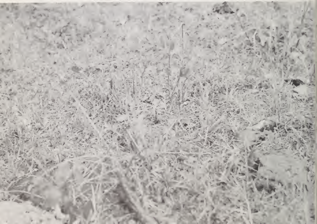
A close view of ground vegetation under a P. tremuloides canopy.