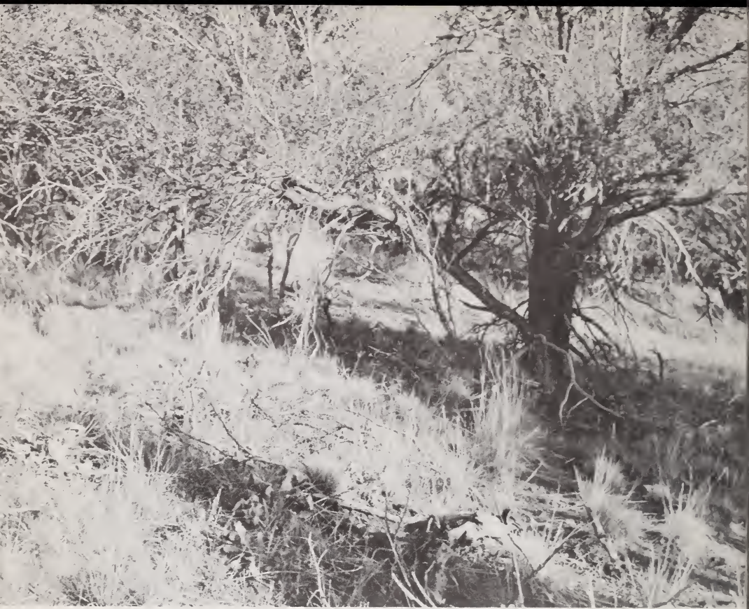
Cercocarpus ledifolius / Festuca idahoensis - Agropyron spicatum ecosystem. Note the relatively open canopy.

on the maintenance or survival of the species and (2) the suppression of young plants by producing a low-hedged or “pincushion” growth form. This heavy utilization does not suppress germination or establishment of young plants. They escape detection in the tall bunchgrass and winter snows until they are 6 to 12 inches tall and have a strong competitive root system and well-branched top.