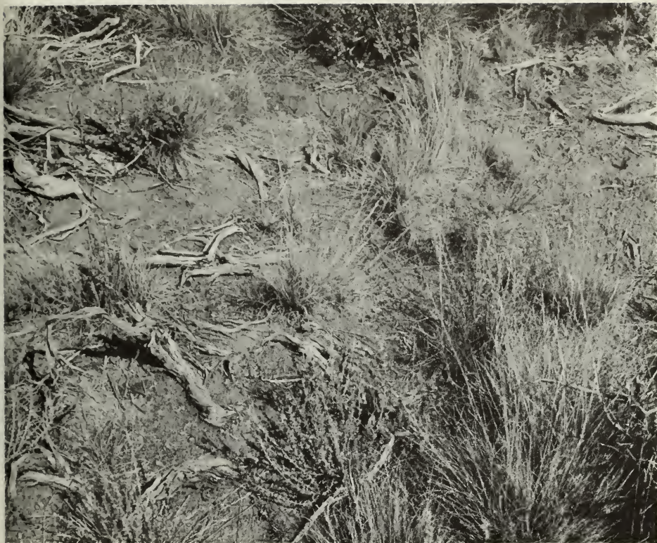
General view of the Artemisia tridentata - Purshia tridentata / Festuca idahoensis ecosystem.

should favor Purshia tridentata . A study of P. tridentata seeded after a burn, being conducted in this immediate area (Dealy 1970), found that after 2 years of treatment the shrub response was greater from browsing protection than from elimination of vegetation competition. Any shrub rehabilitation project may need site preparation and should provide some type of protection from animal use for from 3 to 5 years. This protection could be accomplished either physically by fencing or by a large enough acreage of rehabilitation to absorb the intense use with minimal damage. Protective fencing costs per acre are not unreasonable when considering 1,000-acre blocks or larger.