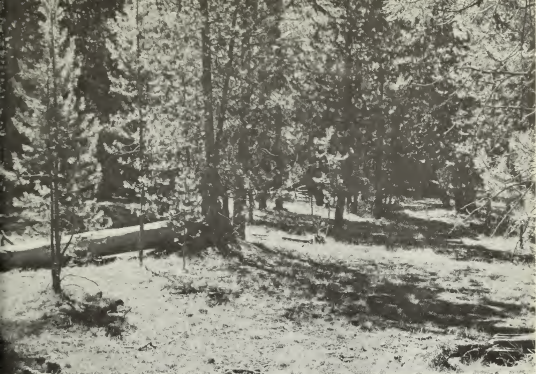
Pinus contorta / Festuca idahoensis ecosystem illustrating logs from old burn and good hiding cover for game. Note absence of shrub cover.