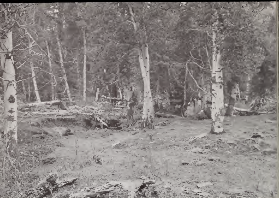
Overall view of a Populus tremuloides colony. Note the understory vegetation cropped short by deer and cattle.