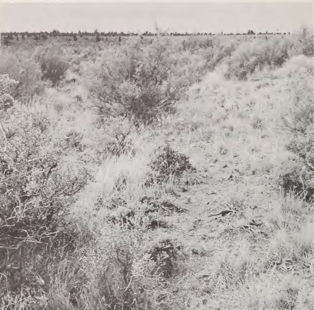
Purshia tridentata - Artemisia arbuscula / Stipa thurberiana ecosystem. Note the A. arbuscula plants in the interspaces.