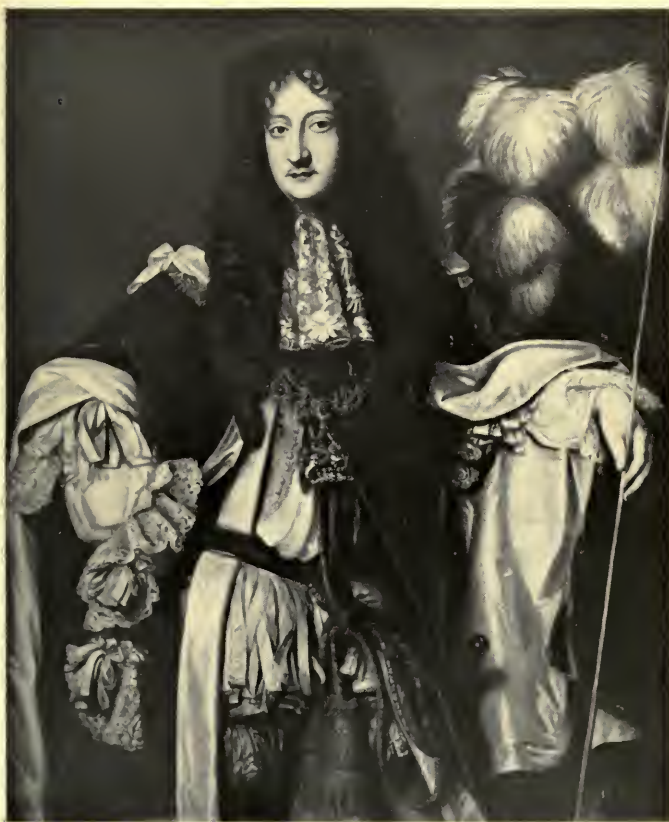
after the picture by Sir Godfrey Kneller in the National Portrait Gallery.