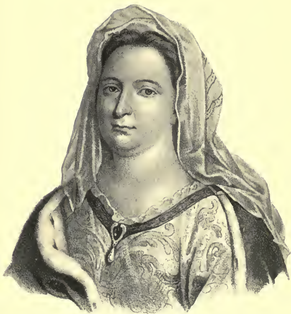
After a contemporary picture. MADAME DE MAINTENON.