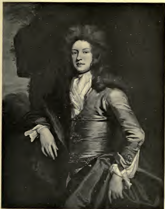
after the picture by Sir Godfrey Kneller in the National Portrait Gallery.