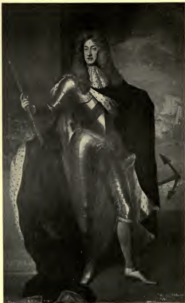
after the painting in the National Portrait Gallery by Sir Godfrey Kneller.