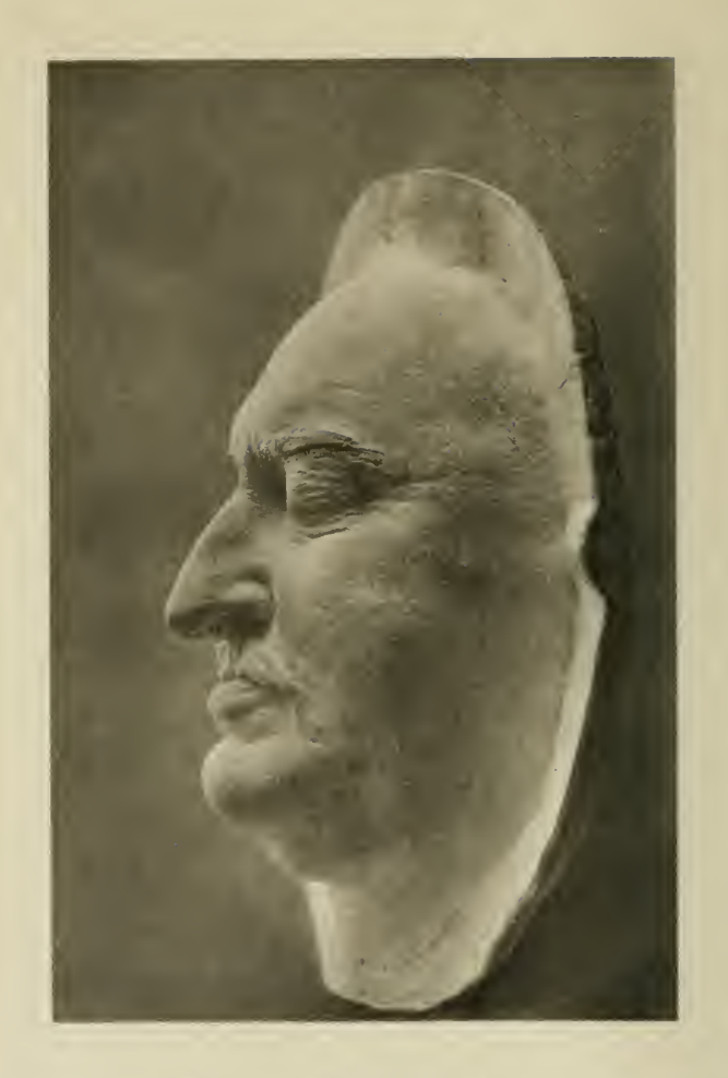
Rhodes Death Mask