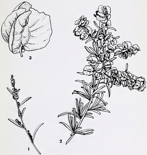
Santa Rita fourwing saltbush : (1) Male flowering branch. (2) Female flowering branch with characteristic leaf arrangement. (3) Seed with four wings.

Used with permission from Trees and Shrubs of the Southwestern Deserts by Benson and Darrow, Tucson. University of Arizona Press, 1981.