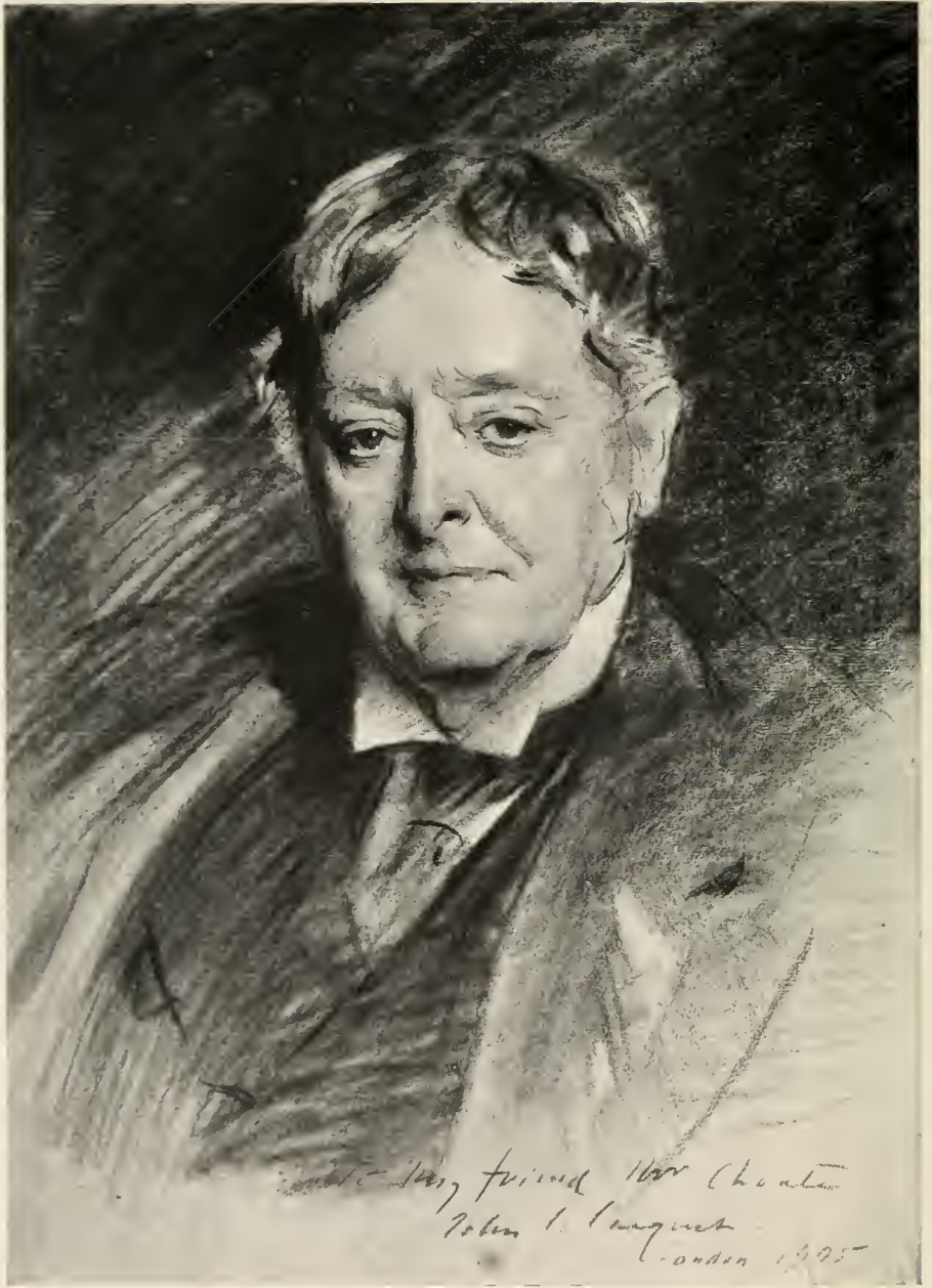
Joseph H. Choate