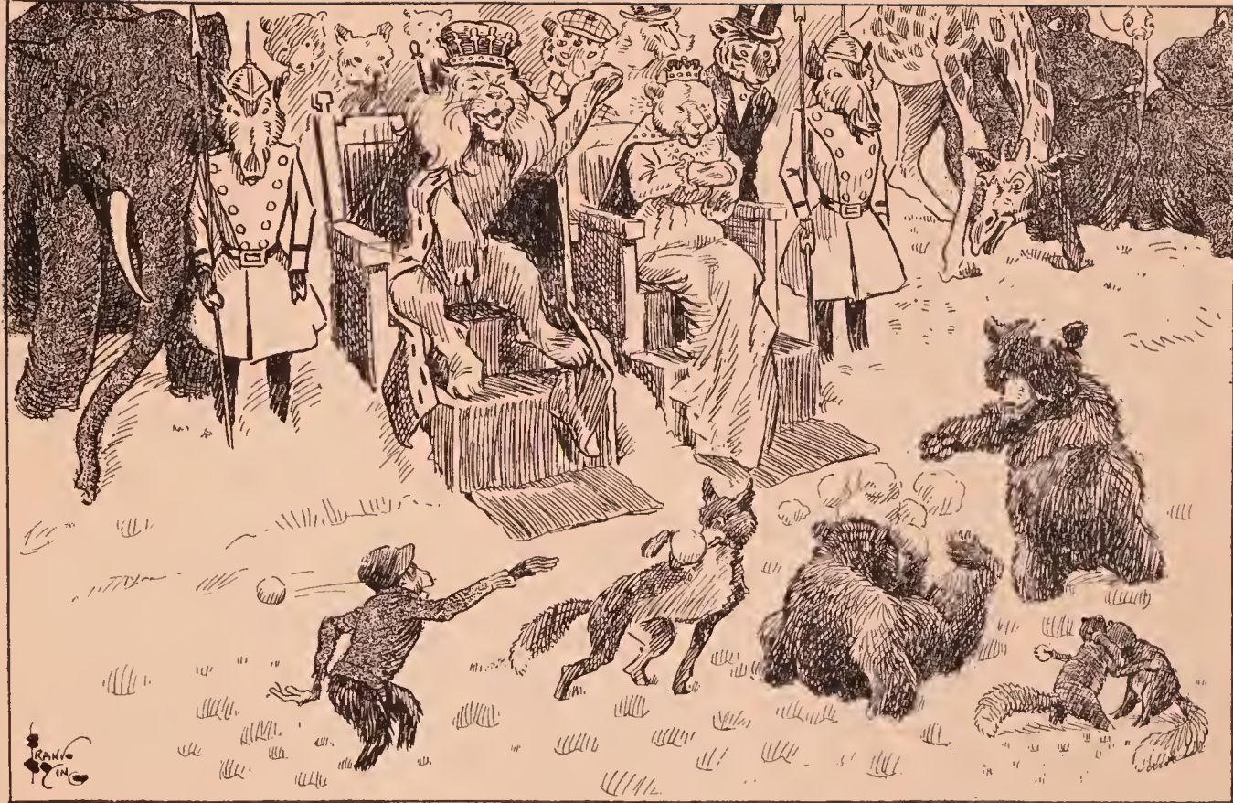
Then the Jolly, Good Time Began.