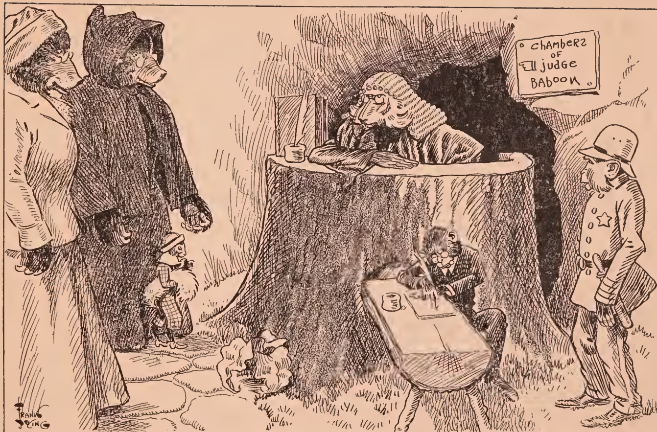
The Bears Legally Adopted Him.