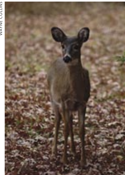
White-tailed deer are common along the Appalachian Trail.