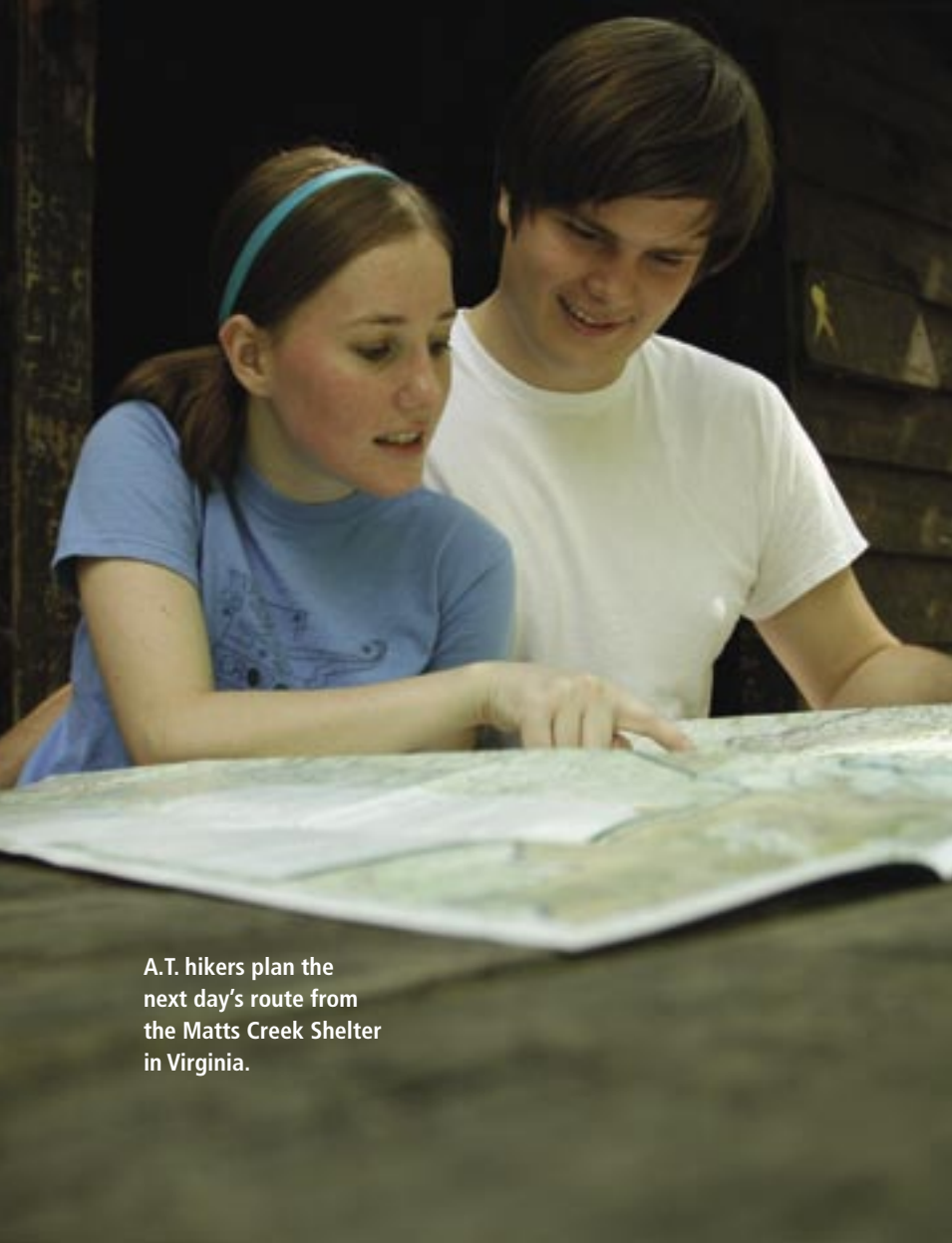
A.T. hikers plan the next day's route from the Matts Creek Shelter in Virginia.