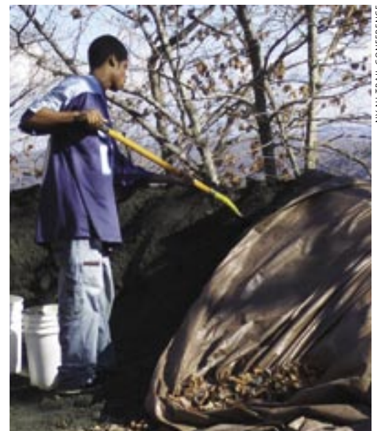
NY-NJ TRAIL CONFERENCE

Although the ATC and ATPO oversee the management of the trail along its entire length,