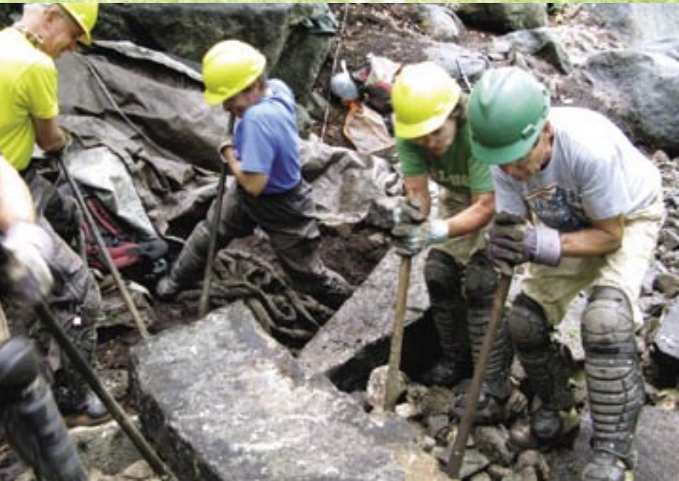
APPALACHIAN TRAIL CONSERVANCY

Above: Children and adults celebrated the 2006 National Trails Day at the ATC's Mid-Atlantic Regional Office in Boiling Springs, Pennsylvania.