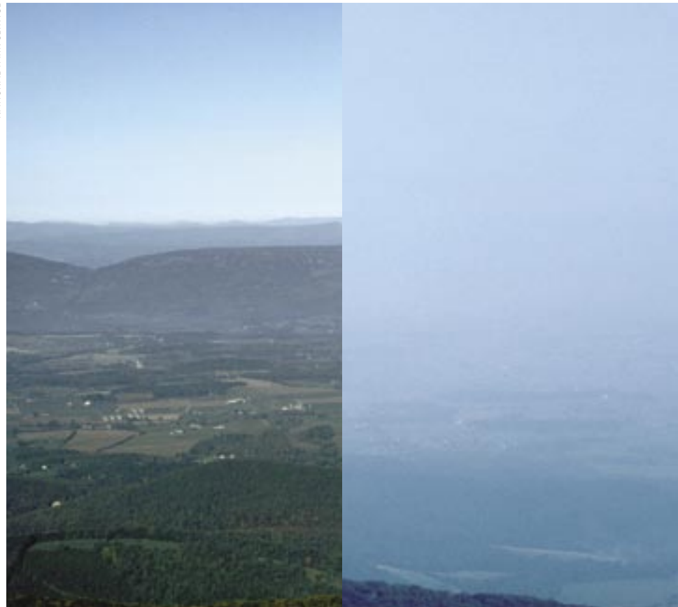
The view of Shaver Hollow (located just west of the A.T.) on a clear day and a hazy day (in Shenandoah National Park).