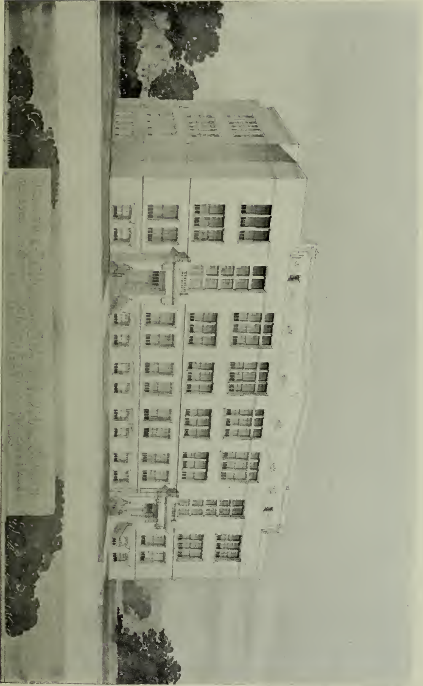
TRAINING SCHOOL BUILDING.