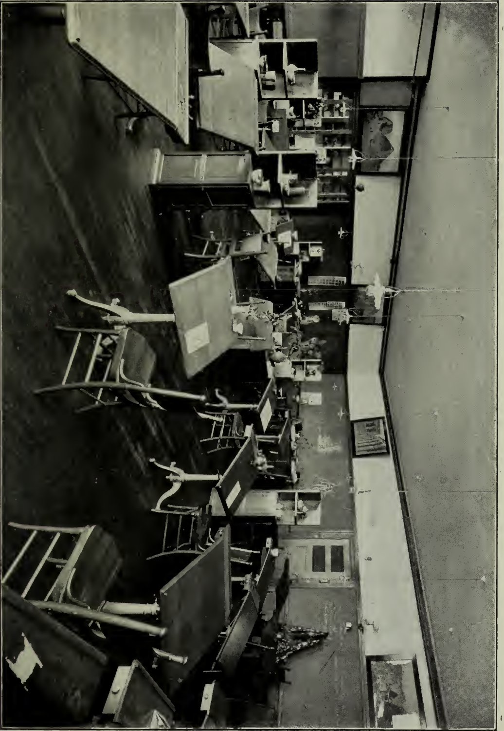
DRAWING AND THE FINE ARTS.