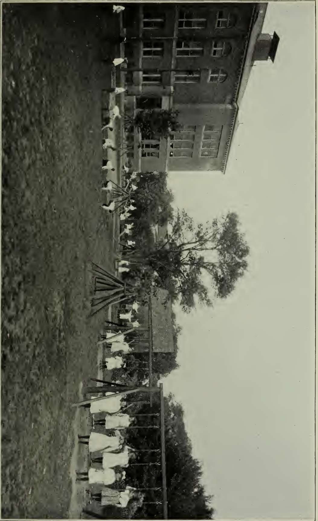
PLAYGROUND EQUIPMENT MADE BY BOYS OF SEVENTH AND EIGHTH GRADES.