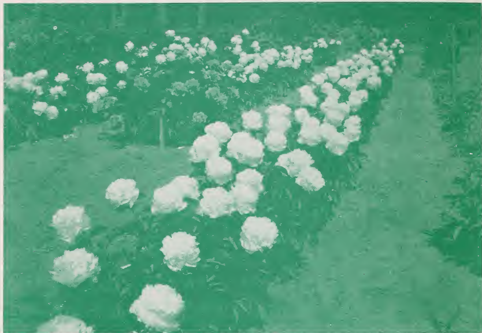
Young plants of Marcella