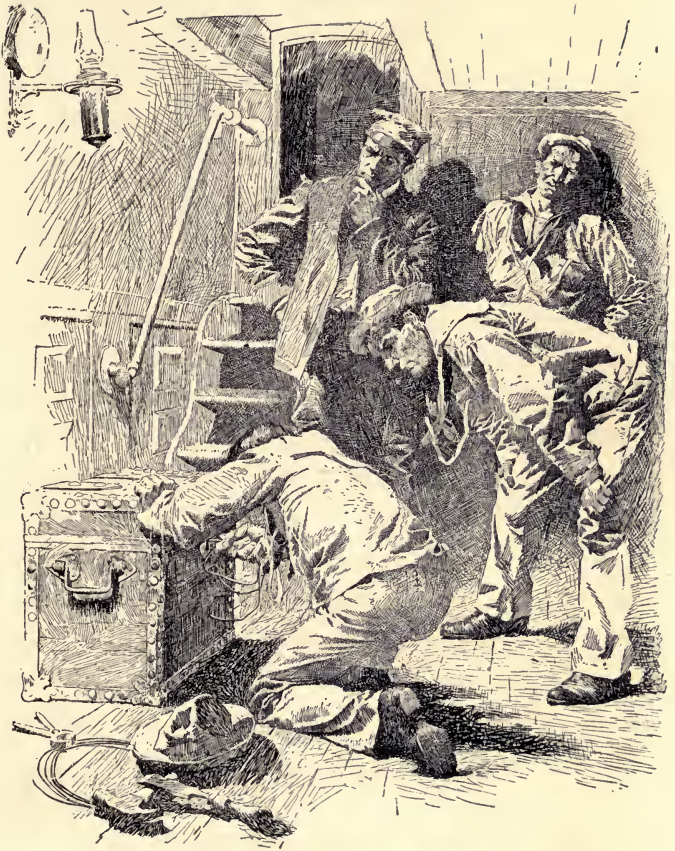
A man who was a bit of a mechanic was set to work to open the chest