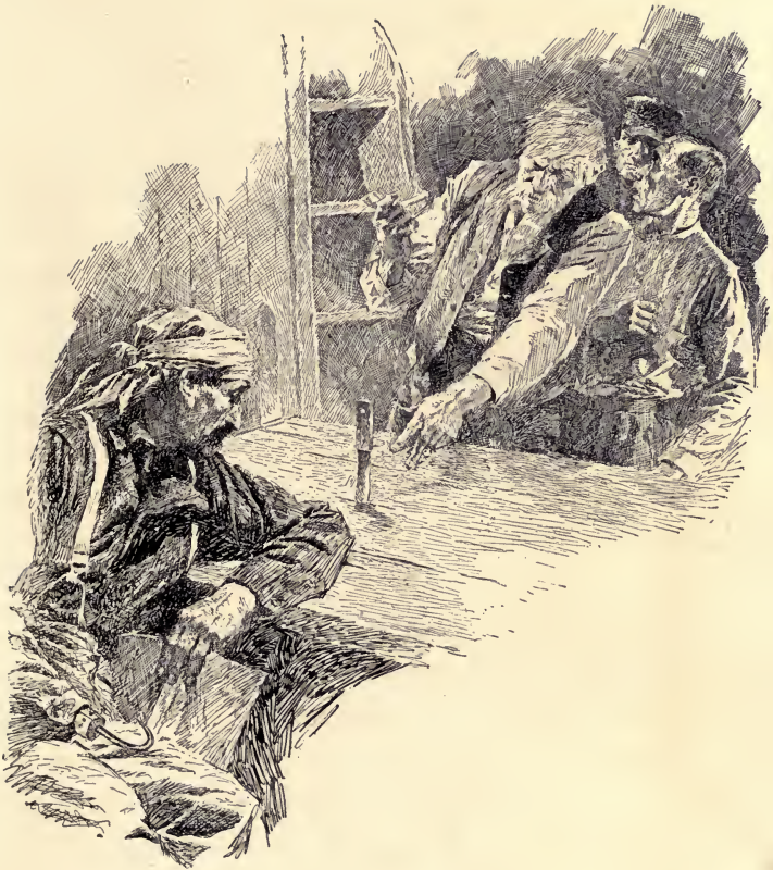
“The spirit of the wild beast, cowed but snarling still”