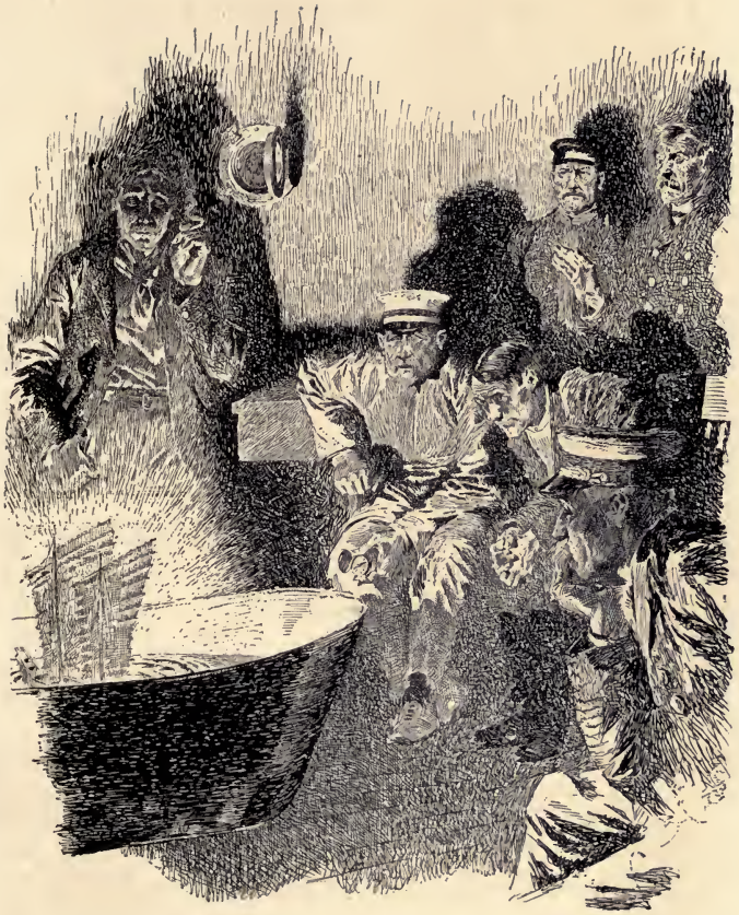
He floated the model in the tub