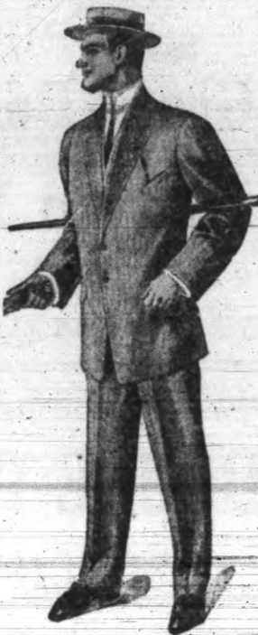
The Way of To-day The Semi-ready Way

If you really believed that you could get better clothes—delivered to you the day you want them—better tailored and designed—better fitted than the retail tailor can fit you—then you would adopt the way of to-day: The Semi-ready way.