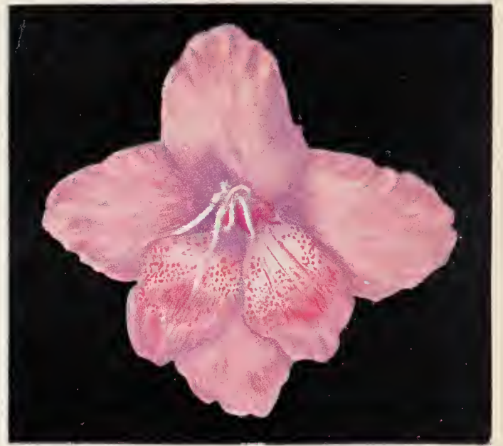
$1.05 for 10 Prince of India $8.50 per 100