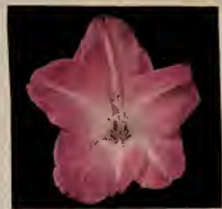
$1.00 for 10 Minuet $7.50 per 100