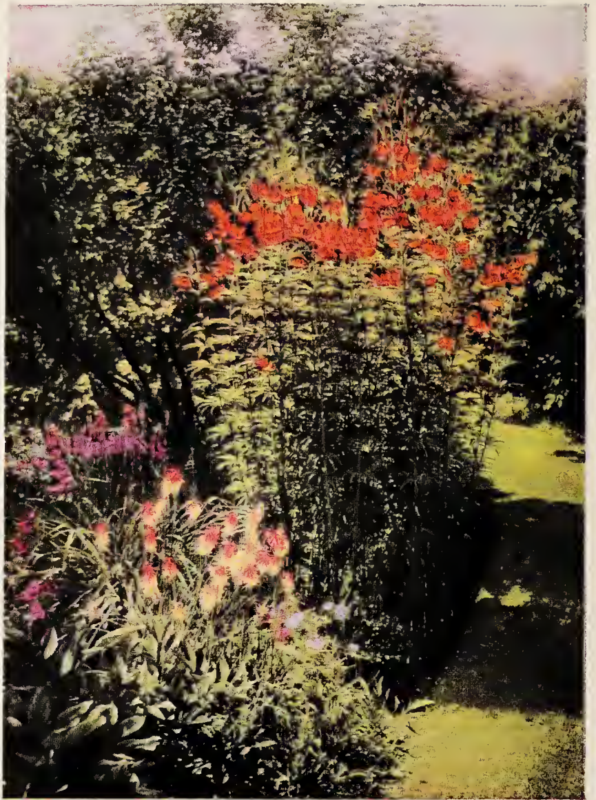
Tritoma Rufa with Liliun Superbum

PAVONIA HYBRIDS MIXED. A selected mixture of all colors. $2.75 for 10, $25 per 100.