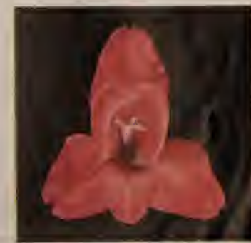
$1.25 for 10 Mrs. S. A. Errey $10.00 per 100