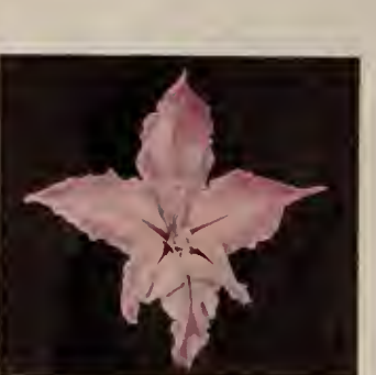
$1.20 for 10 The Orchid $9.50 per 100