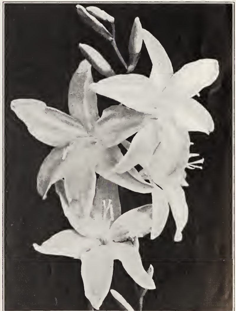
Montbretia "Star of the East"

STAR OF THE EAST. First Class Certificate; Award of Merit. One of the finest Montbretias ever raised; flowers pale orange yellow, with lemon-yellow eye, expanding quite flat and held erect. The flowers are much larger than any other variety in this class, best blooms measuring 5 inches in diameter. The size, vigor, color and habit are magnificent and unequalled. 10 corms, $4; 100 corms, $32.50.