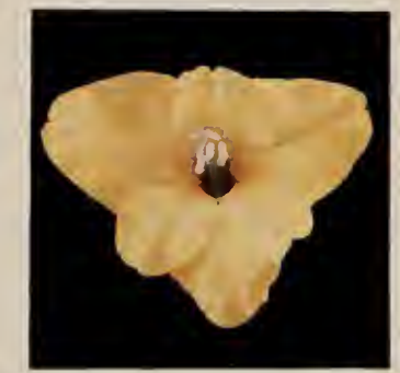
$2.75 for 10 Canberra $25.00 per 100