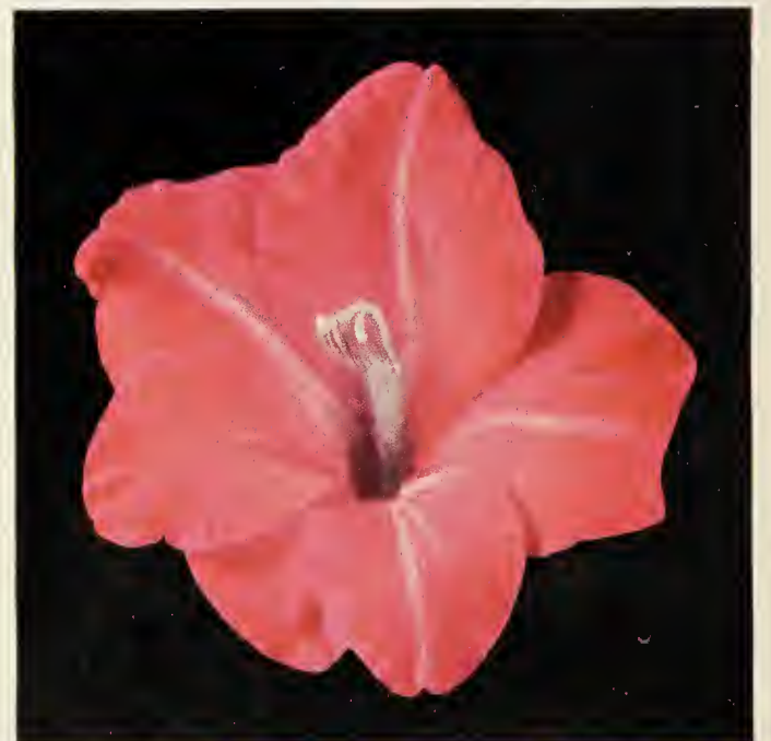
$4.25 for 10 Red Phipps $40.00 per 100