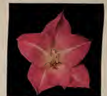
$0.90 for 10 Longfellow $6.50 per 100