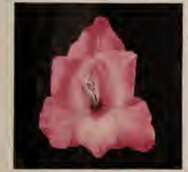
$4.75 for 10 Schwabengirl $45.00 per 100