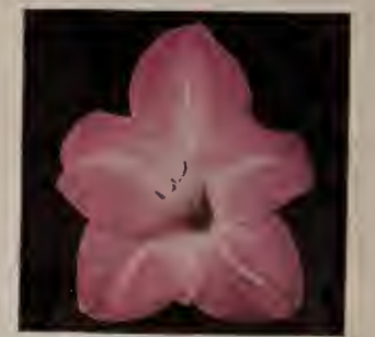
$1.25 for 10 Jane Addams $10.00 per 100

OFFER NUMBER FIVE — Our Rainbow Collection ANNIE LAURIE MURIEL MRS. H. E. BOTTIN IDAMAO PERSIA ORANGE QUEEN MRS. F. C. PETERS GOLDEN MEASURE SUNNYMEDE LONGFELLOW These 10 beautiful varieties, 10 bulbs of each—Total 100 HIGHEST QUALITY BULBS. Regular list price $8.65 Special price $6.00 OFFER NUMBER SIX Same as Offer Number Five, one-half the quantity, varieties as listed, 5 bulbs of each—Total—50 HIGHEST QUALITY BULBS. Regular list price $4.33 Special price $3.25