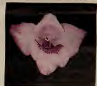
$1.05 for 10 Muriel $8.00 per 100