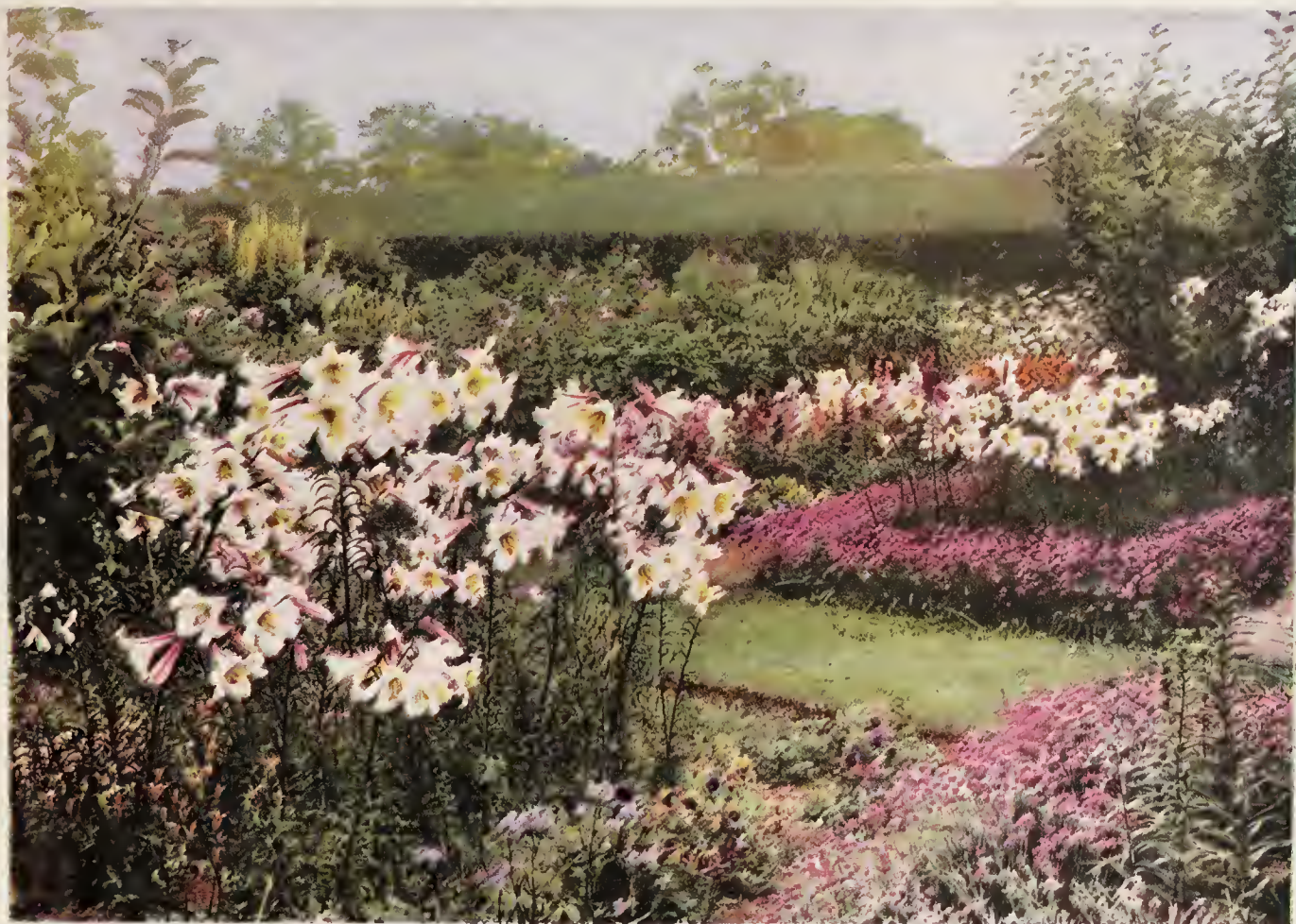
Lilium Regale in the Garden of One of Our Clients