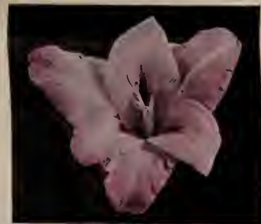
$1.00 for 10 Mrs. Van Konyenburg $7.50 per 100