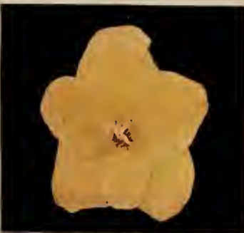
$0.70 for 10 Golden Measure $4.50 per 100