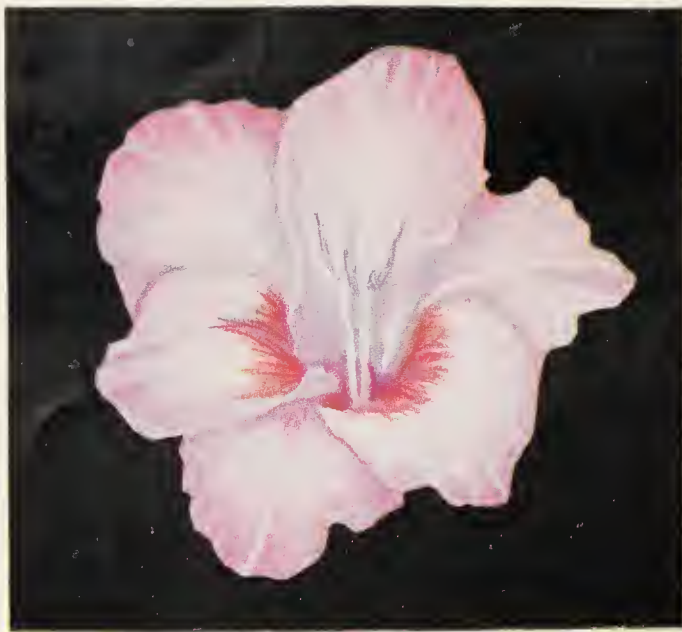
$0.90 for 10 Mrs. H. E. Bothin $6.50 per 100