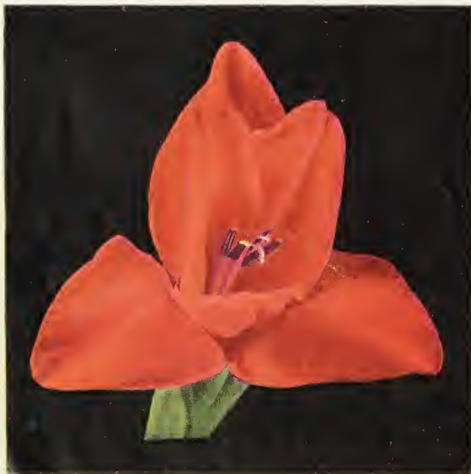
$1.75 for 10 Commander Koehl $15.00 per 100