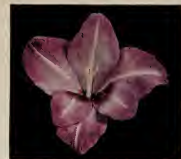
$1.15 for 10 Veilchenblau $9.00 per 100