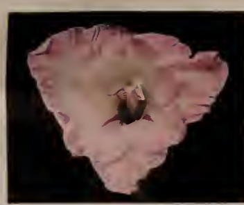
$0.80 for 10 Annie Laurie $5.50 per 100