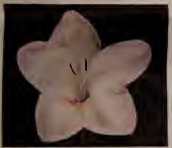
$1.15 for 10 Idamao $9.00 per 100