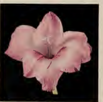
$1.10 for 10 Marmora $8.50 per 100