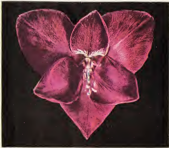
$0.85 for 10 Persia $6.00 per 100