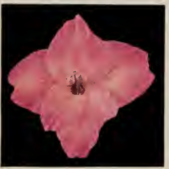
$4.25 for 10 Bagdad $40.00 per 100