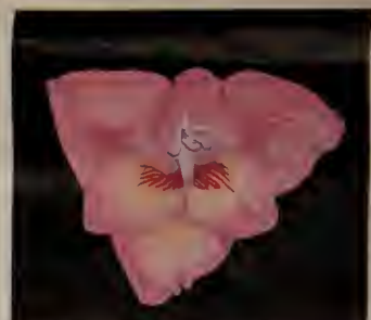
$0.75 for 10 Orange Queen $5.00 per 100

OFFER NUMBER ONE Our Exhibition Collection ALBATROSS MARMORA BAGDAD MRS. S. A. ERREY CANBERRA PELEGRINA COMMANDER KOEHL RED PHIPPS JANE ADDAMS SALBACH'S PINK MAMMOTH WHITE SCHWABENGIRL These 12 very beautiful varieties, each an Exhibition Gladiolus, 10 bulbs of each, separately packed and labeled, planting instructions included—Total 120 HIGHEST QUALITY BULBS. Regular list price $33.65 Special price $30.00