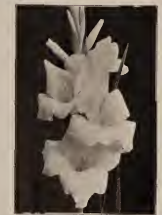
$1.75 for 10 Albatross $15.00 per 100

OFFER NUMBER TWO Same as Offer Number One, only half the quantity, varieties as listed, 5 bulbs of each—Total 60 HIGHEST QUALITY BULBS. Regular price list $17.83 Special price $15.50