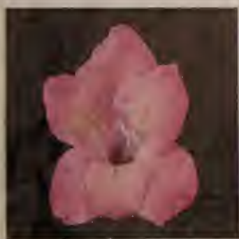
$2.00 for 10 Salbach's Pink $17.50 per 100