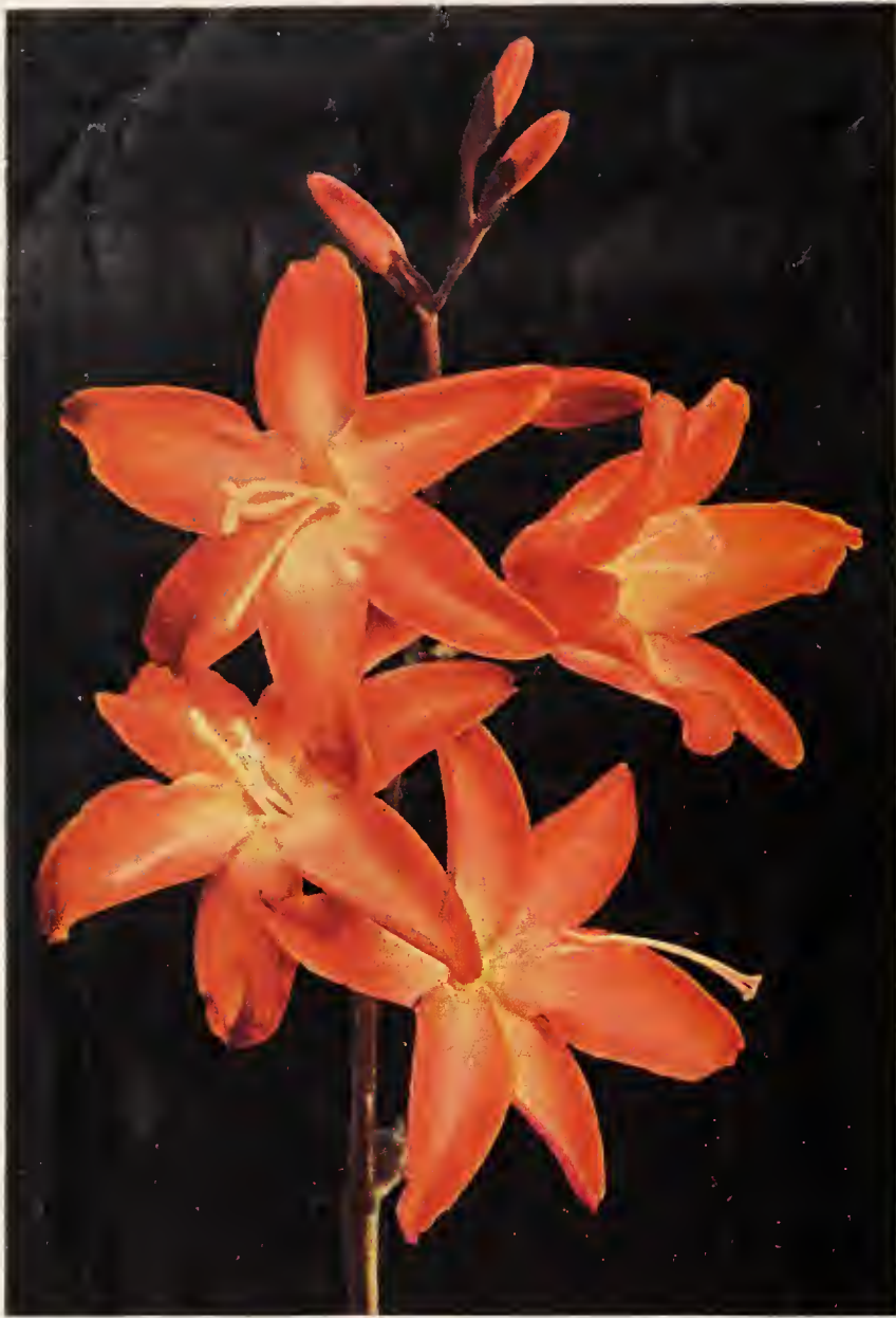
Montbretia "His Majesty"