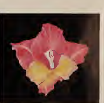
$1.10 for 10 Phaenomen $8.50 per 100