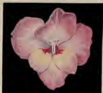
$0.75 for 10 Mrs. F. C. Peters $5.00 per 100