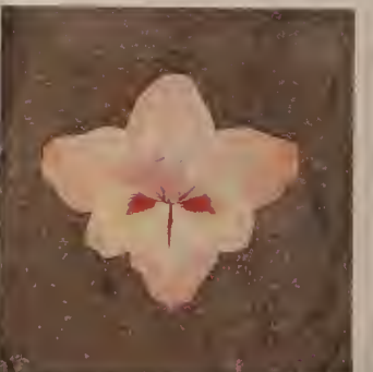
$0.80 for 10 Sunnymede $5.50 per 100