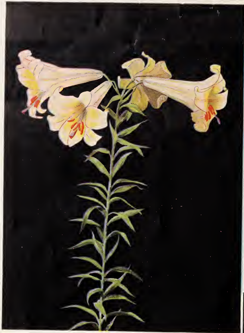
Lilium Sulphureum (Wallichianum, Var. Superbum)

SULPHUREUM ( Wallichianum var. Superbum ). A magnificent Lily from upper Burma, very amenable to cultivation. With ordinary care and attention it will flower year after year. In our northern sections it had better be grown in deep pots, where it will attain a height of 6 feet and more, plunging the pots out of doors or in frames for blooming in late Summer and Autumn. The trumpet-shaped flowers, 9 inches long, of great substance and deliciously fragrant, are creamy white with a flushed rose tinge on the outside; the interior is suffused with rich yellow. It seems difficult to convey a suggestion as to the beauty and delicacy of this rare and beautiful Lily. The latest to flower outside, often later than September. Stem roots. Extra selected bulbs, $2.25 each, $20 for 10. A smaller, high quality bulb, $1.25 each, $11 for 10, $100 per 100.