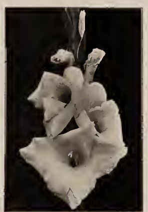
$2.75 for 10 Mammoth White $25.00 per 100

ALBATROSS Unquestionably one of the finest pure white Gladioli. The flowers are large, of fine substance, and carried in perfect placement on a strong, sturdy spike. MAMMOTH WHITE As its name implies, this is one of the largest flowered Gladioli; the blossoms often measure 7 inches in diameter and are carried on tall, straight spikes. The pure white florets are well placed with many open at one time.