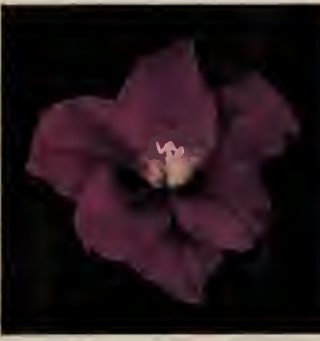
$7.75 for 10 Pelegrina $75.00 per 100