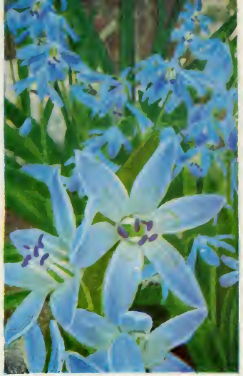
SCILLA SIBIRICA Excellent border

Before Mid-December Spring Planting Will Be Too Late