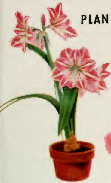
AMARYLLIS Equally striking potted or in garden