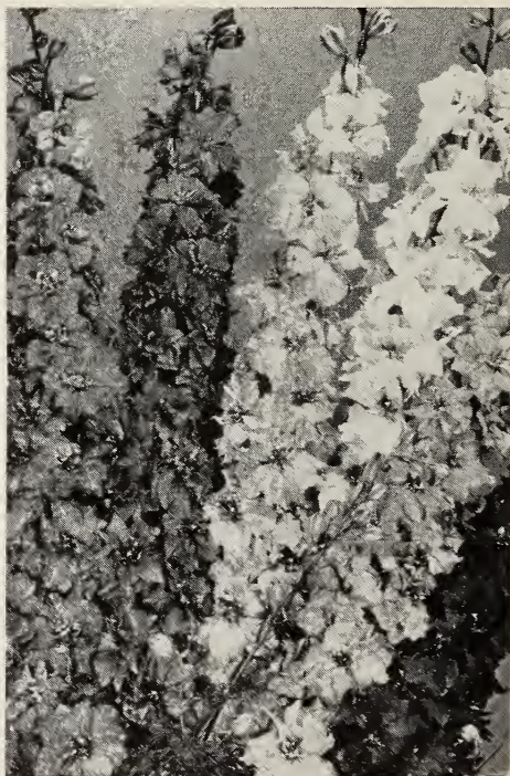
REGAL LARKSPUR, MIXED

1543. Gold Medal Hybrids . Choice mixture. Pkt. 15c; 1/8oz. 50c. 1545. Bellamosum . Bright, dark blue. Pkt. 15c; 1/8oz. 75c. 1548. Belladonna . Light blue. Pkt. 15c; 1/8oz. 75c.