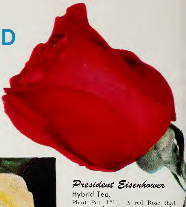
President Eisenhower Hybrid Tea.

Plant Pat 1217. A red Rose that combines beauty, charm and dependability. Rich unfading color. Free blooming. Each $2.25; 3 for $6.00.