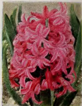
HYACINTH QUEEN OF PINKS