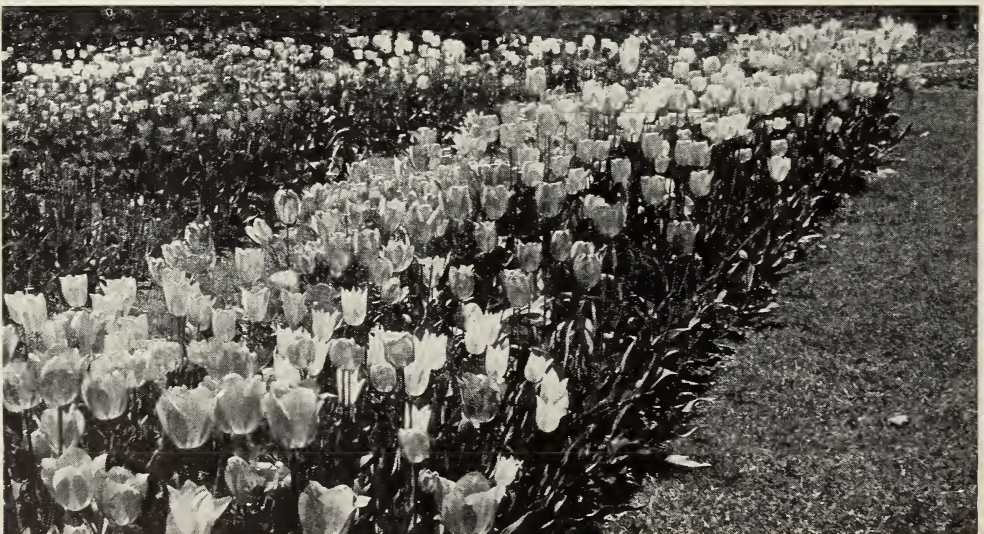
PLANTING OF COTTAGE TULIPS

SMILING QUEEN. Possibly the "last word" in pink Cottage Tulips. Pure rose, shading satin-rose toward edge of petal. An excellent novelty. 3 for 40c; 6 for 70c; 12 for $1.30; 25 for $2.35; 100 for $8.40.