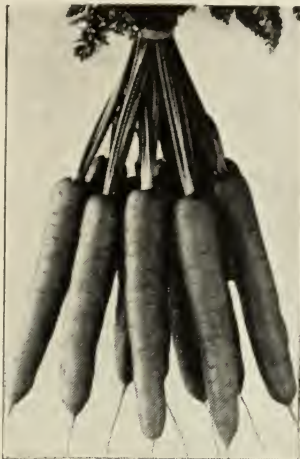
181. CARROTS, GOLD PAK