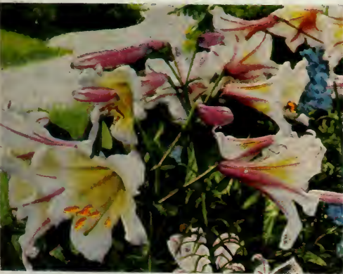
REGAL LILY. Hardy, 4 to 6 feet

Write Our Staff About Your Garden Problems or Plant Selections