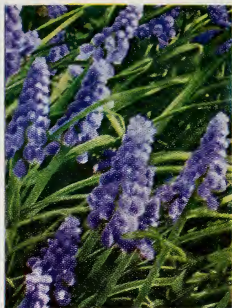
GRAPE HYACINTHS (Muscari)