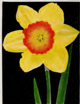
NARCISSUS SCARLET ELEGANCE