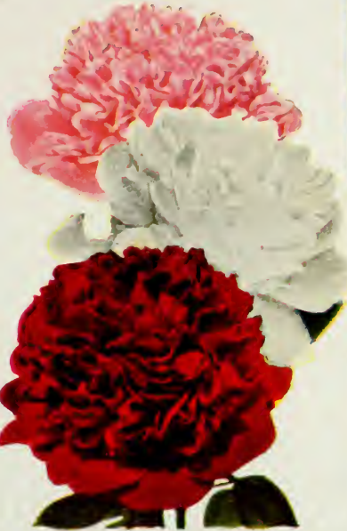
PEONIES Northern grown select stock Red, White, Pink