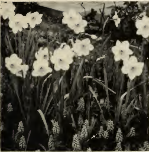
NARCISSUS and GRAPE HYACINTHS