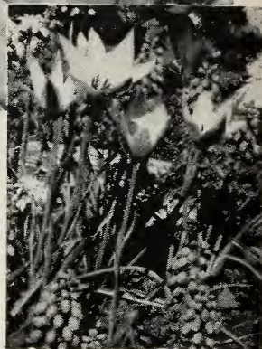
TULIP SPECIES CLUSIANA and GRAPE HYACINTHS

RED EMPEROR. "One of the most brilliant of all flowers is the enormous scarlet T. fosteriana . The flowers open out flat on a sunny day and all others pale beside them. None of them can match Red Emperor, for either size or brilliance."— Horticulture , May, 1950. 3 for 50c; 6 for 90c; 12 for $1.60; 25 for $2.90; 100 for $10.35.