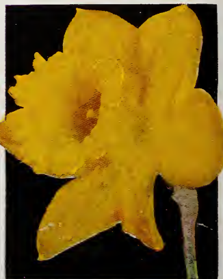
NARCISSUS KING ALFRED