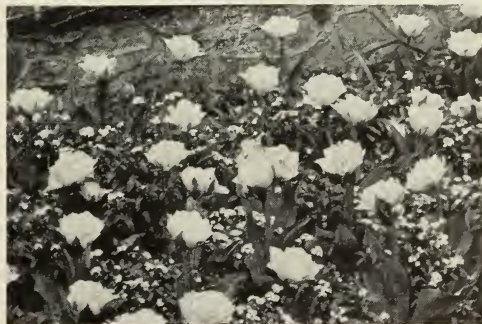
PLANTING OF PEONY TULIPS

UNCLE TOM. Deep dark red, double peony type. A most striking color. 3 for 45c; 6 for 80c; 12 for $1.50; 25 for $2.75; 100 for $9.90.