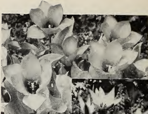
TULIP SPECIES RED EMPEROR

PRAESTANS FUSILIER. This species is quite interesting in that it produces brilliant orange flowers in clusters of about four per stem. Attractive, dark green foliage. Height about 8 inches. 3 for $1.10; 6 for $2.00; 12 for $3.65; 25 for $6.65; 100 for $23.70.