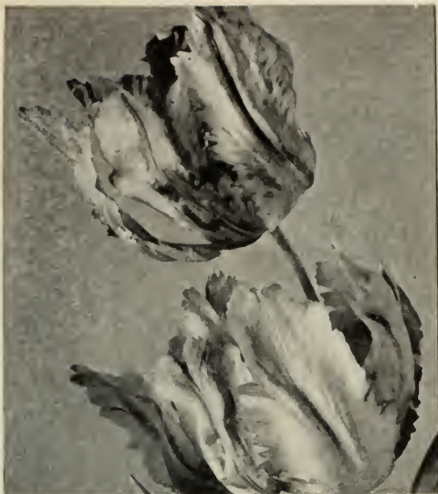
PARROT TULIP, FANTASY