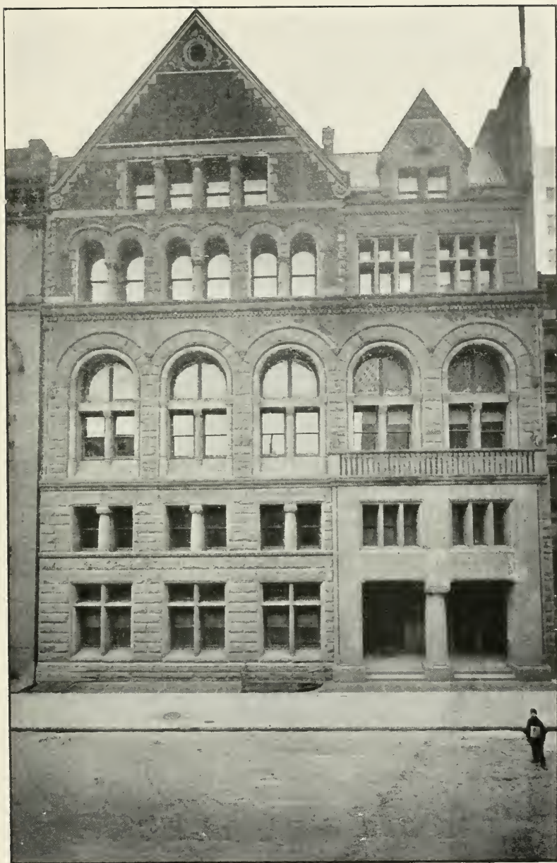
THE NEW YORK ACADEMY OF MEDICINE.