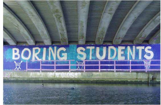
When Jack and Mo hang out, they often see graffiti they can relate to. 1

The reason why Jack has been making all these silly edits is because he actually finds Wikipedia really interesting. Years from now, when he's out of school and more mature, there will be a day when he signs in with a username and becomes a trusted member of the community. Today is not that day.