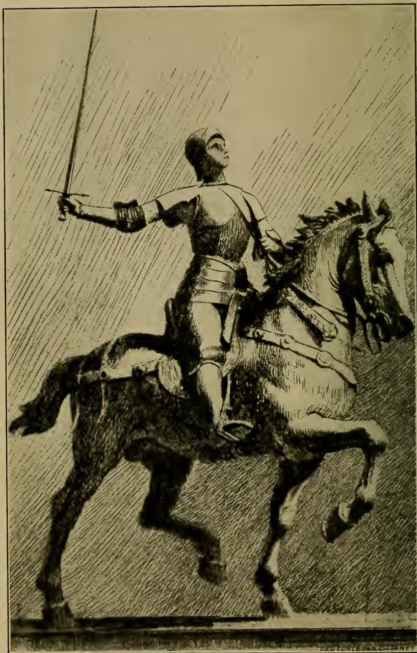
JOAN OF ARC