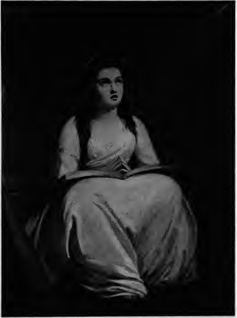
LADY HAMILTON AS ST. CECILIA FROM THE PAINTING BY ROMNEY, IN THE POSSESSION OF WATSON FOTHERGILL, ESQ.