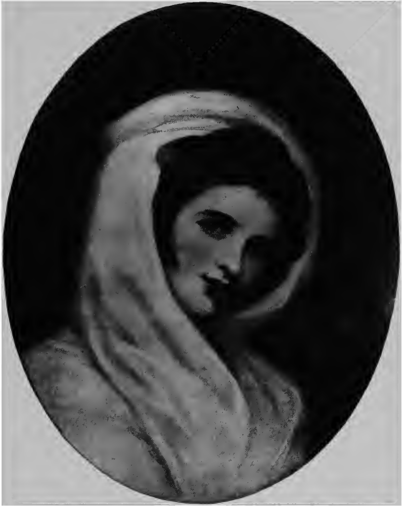
LADY HAMILTON IN A WHITE HOOD FROM THE PAINTING BY ROMNEY, IN THE POSSESSION OF LORD GLENCONNER