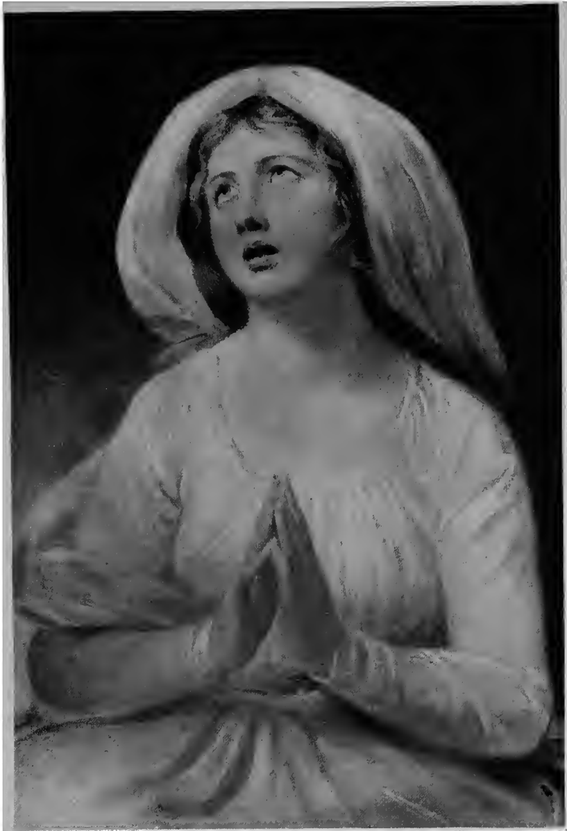
LADY HAMILTON; THE NUN FROM THE PAINTING BY ROMNEY, IN THE POSSESSION OF MONSIEUR M. SEDELMAYER