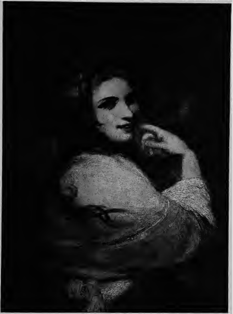
LADY HAMILTON AS A BACCHANTE FROM THE PAINTING BY SIR JOSHUA REYNOLDS, IN THE POSSESSION OF THE EARL OF DURHAM