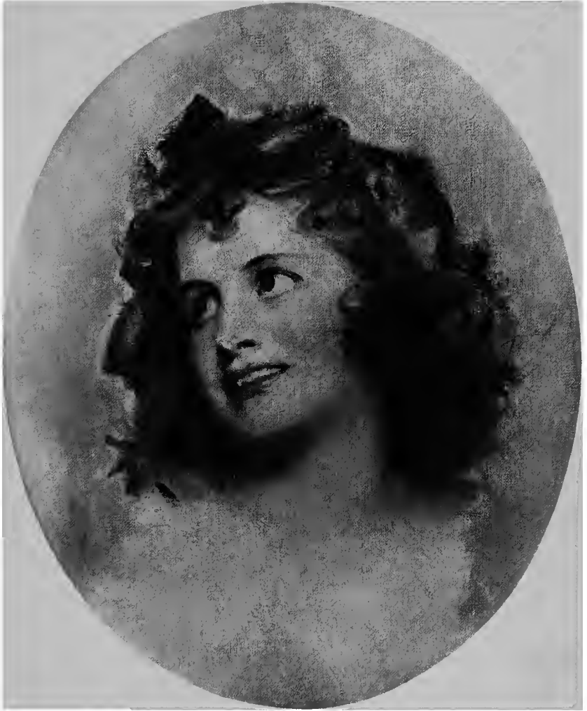
LADY HAMILTON AS EUPHROSYNE FROM THE PAINTING BY ROMNEY, IN THE POSSESSION OF G. HARLAND PECK, ESQ.