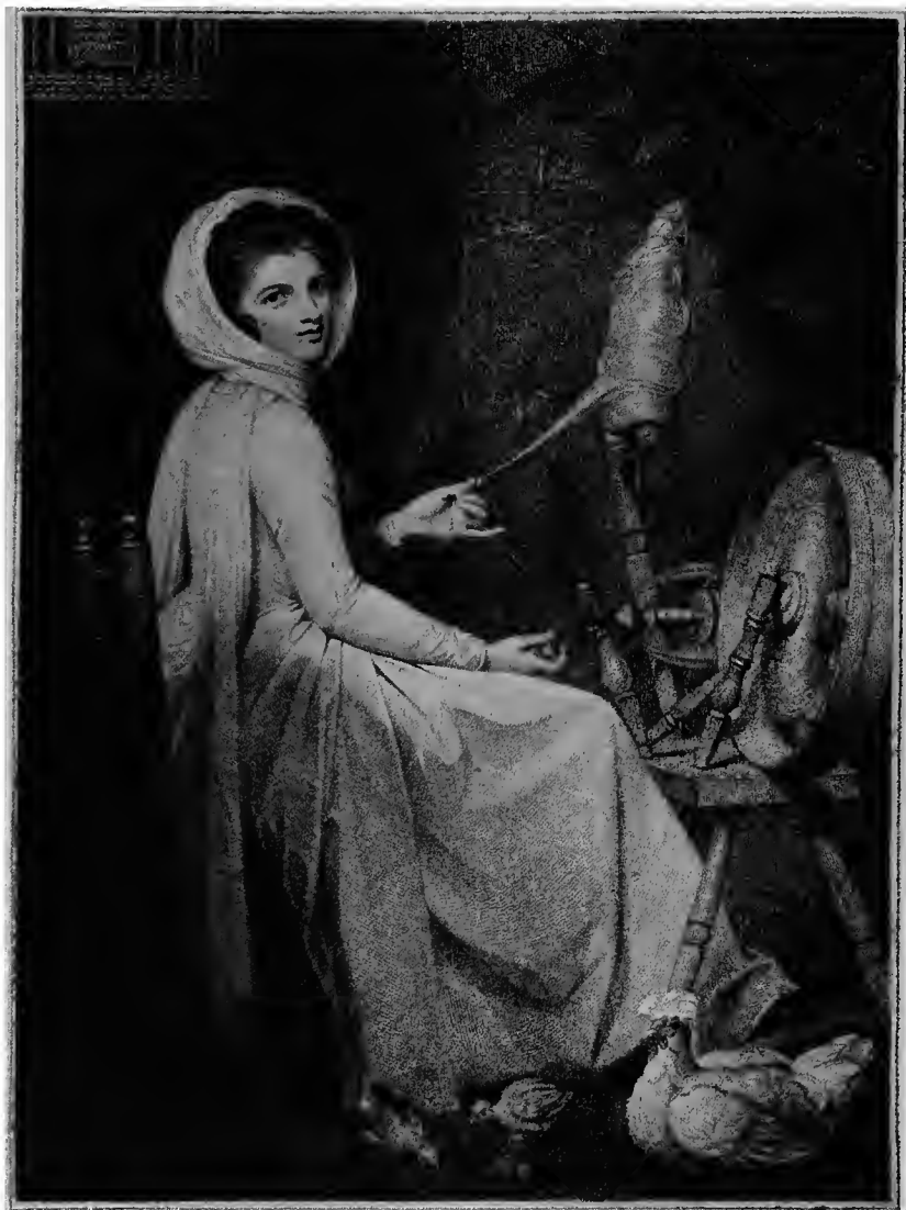
THE SPINSTRESS FROM THE ENGRAVING BY T. CHEESEMAN, AFTER THE PAINTING BY ROMNEY