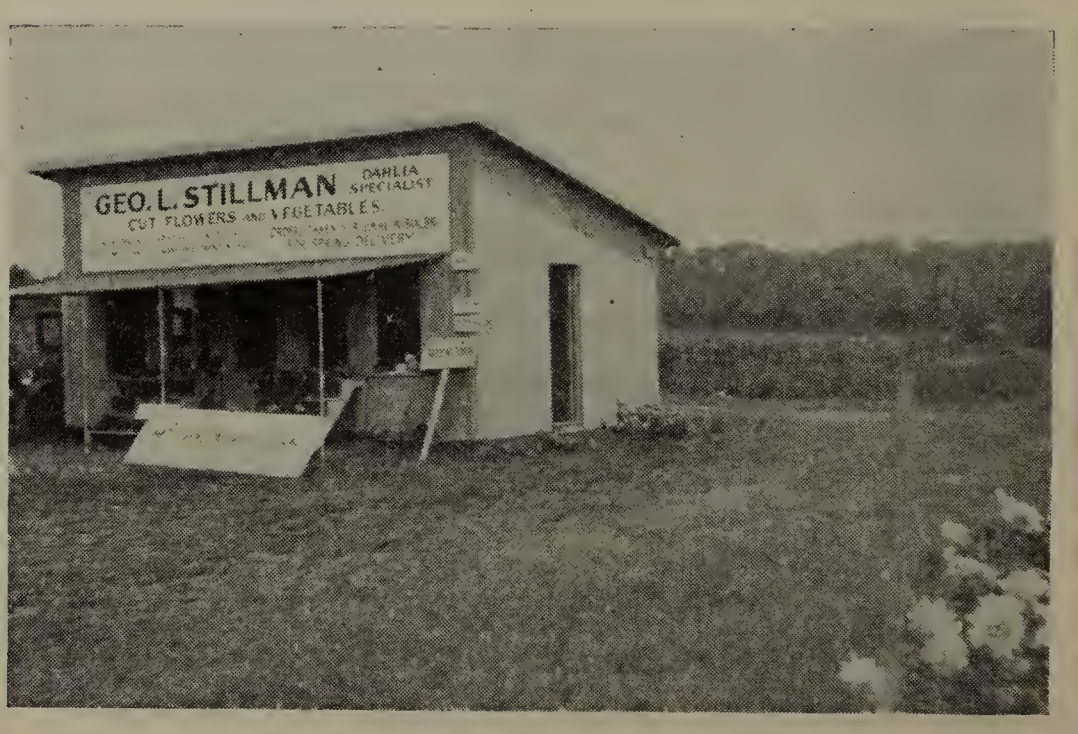
Roadside Stand at my field on Watch Hill Road, Westerly, R. I.

Be sure your full name and address is written plainly on every letter and order.