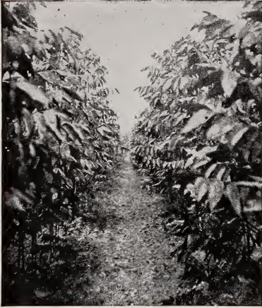
Looking Down One of the Rows in Our Nursery of Bred-Up Pecans

There are more than fifty different varieties of the paper-shell pecan, and out of this number we have selected the kinds we list as the best all-round varieties. One variety will excel others in one particular or more, but fall so far short of equalling them in other ways that it has to be discarded as an undesirable sort. The varieties we list have all been tested and proved to be suitable to the different kinds of soil we have in the Cotton belt of the South. Naturally one kind will suit one soil better than another, and it is for this reason that every buyer should tell the nurseryman the kind of soil he has and get his advice about variety. But we have no hesitancy in saying that the Stuart, Success, Schley, and Bass Paper-shells are the peer of them all as all-around nuts, and are the safest of all to plant.