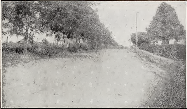
A Bred-Up Pecan Tree Loaded with Pecans on a Beautiful Highway