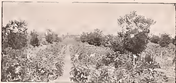
Our Beautiful, Vigorous and Healthy Pecan Stock

The Success has probably attracted more attention than any other variety of papershell pecan that has been recently introduced. Although it is not the largest nut, the kernel has proved to be the heaviest in a test of fourteen varieties made during recent years. The Success is ovate in form. It has a thin shell and cracks readily. The kernel is plump and heavy and of excellent flavor. The tree is of good, sturdy growth and a heavy bearer. The Success is one of the most popular varieties of our fine, bred-up papershell pecan trees.