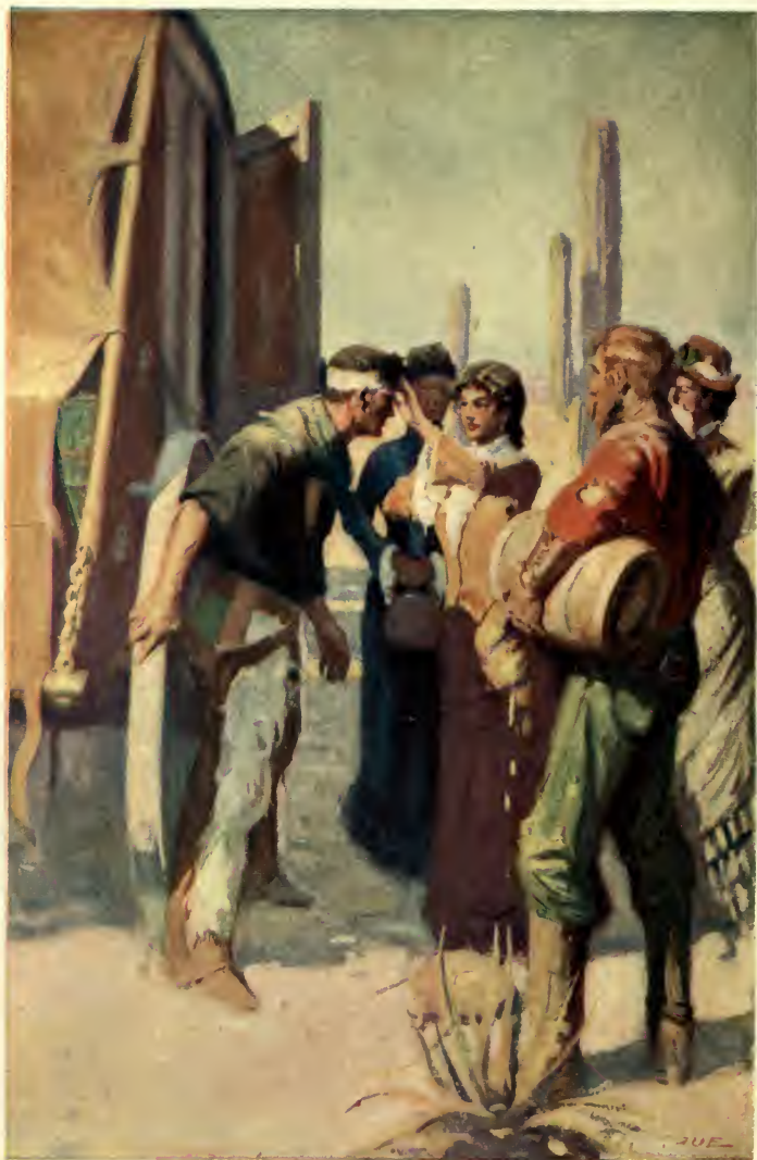
“ She unfastened the gold breast-pin which she wore at her throat and pinned the bandage into place.” (See page 95.)