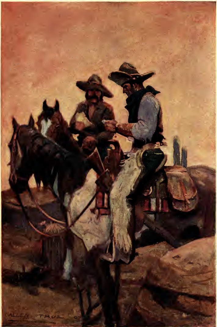
The Orphan gives Blake Shields' note. (See page 213.)