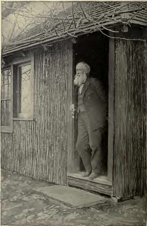
AT THE STUDY DOOR