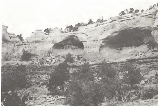
FIGURE 2. 1977 photograph of 5MT 1828. This view of the same site as Figure 1 shows the lack of destruction to isolated sites and the extraordinary preservation qualities of rock shelters. Note the lack of change in the vegetation over a 100-year period.