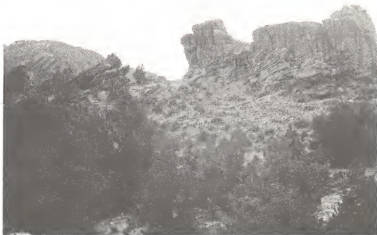
FIGURE 4. 1977 photograph of 5MT 1825, which is the same site as Figure 3. This site is located near a modern road and has suffered extremes in vandalism. Note the radical changes between 1875 and 1977.