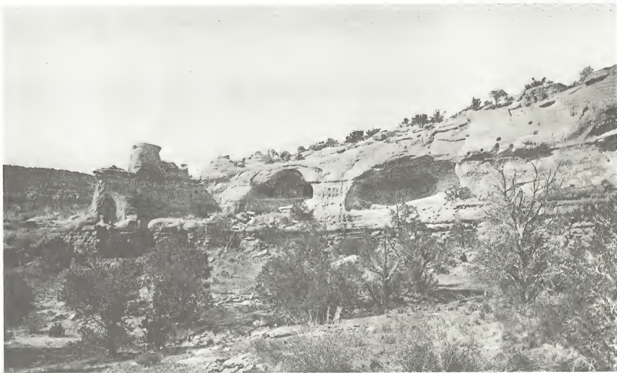
FIGURE 1. Circa 1875 photograph of cliff dwelling in Sand Canyon by W. H. Jackson. Courtesy Smithsonian Institution National Anthropological Archives.