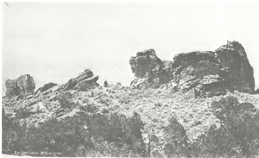
FIGURE 3. Circa 1875 photograph of surface pueblo in McElmo Canyon by W. H. Jackson. The caption on the photo is in error. The site is near but not on Battle Rock. Courtesy Smithsonian Institution National Anthropological Archives.