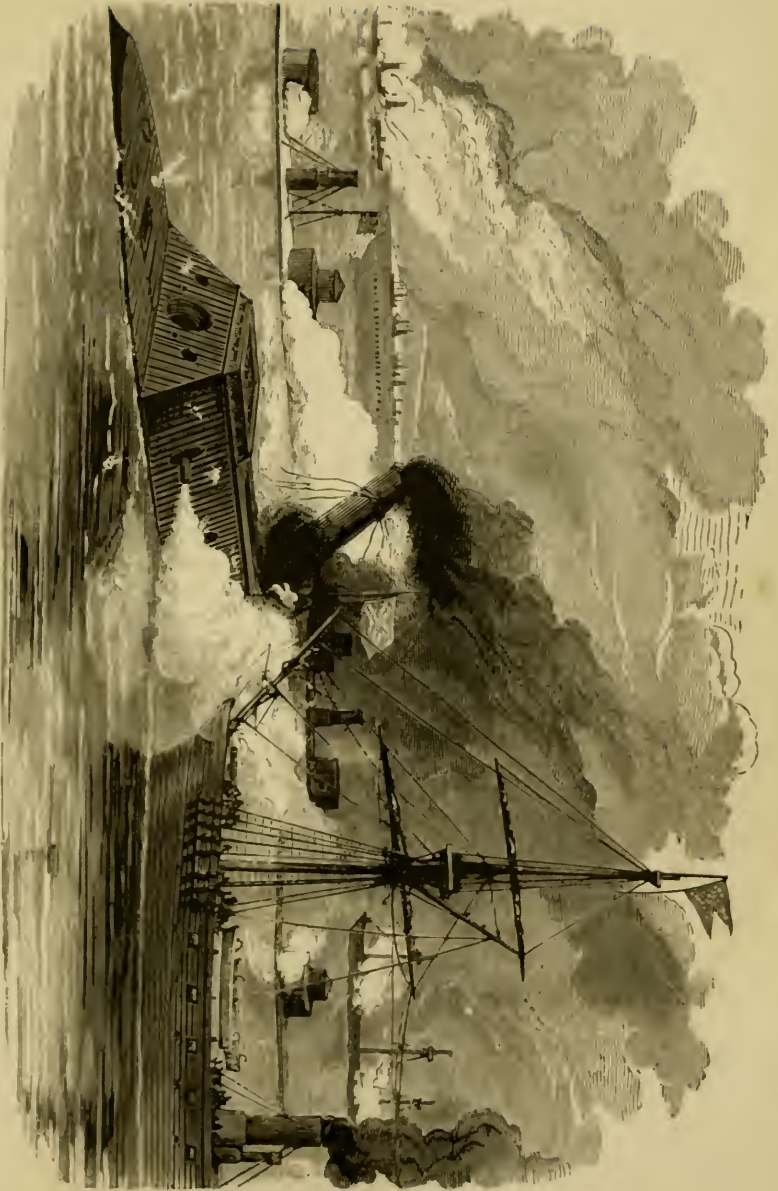
The Battle of Mobile Bay. Page 268.