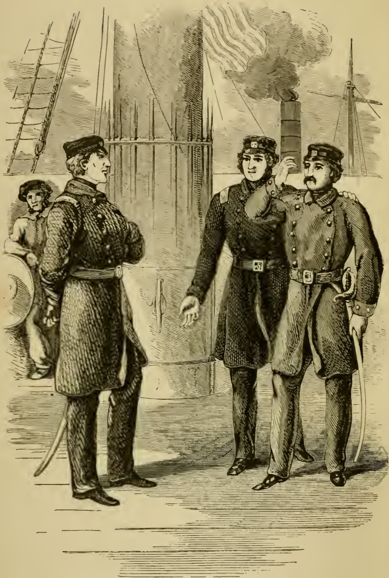
Somers and the Admiral. Page 202.