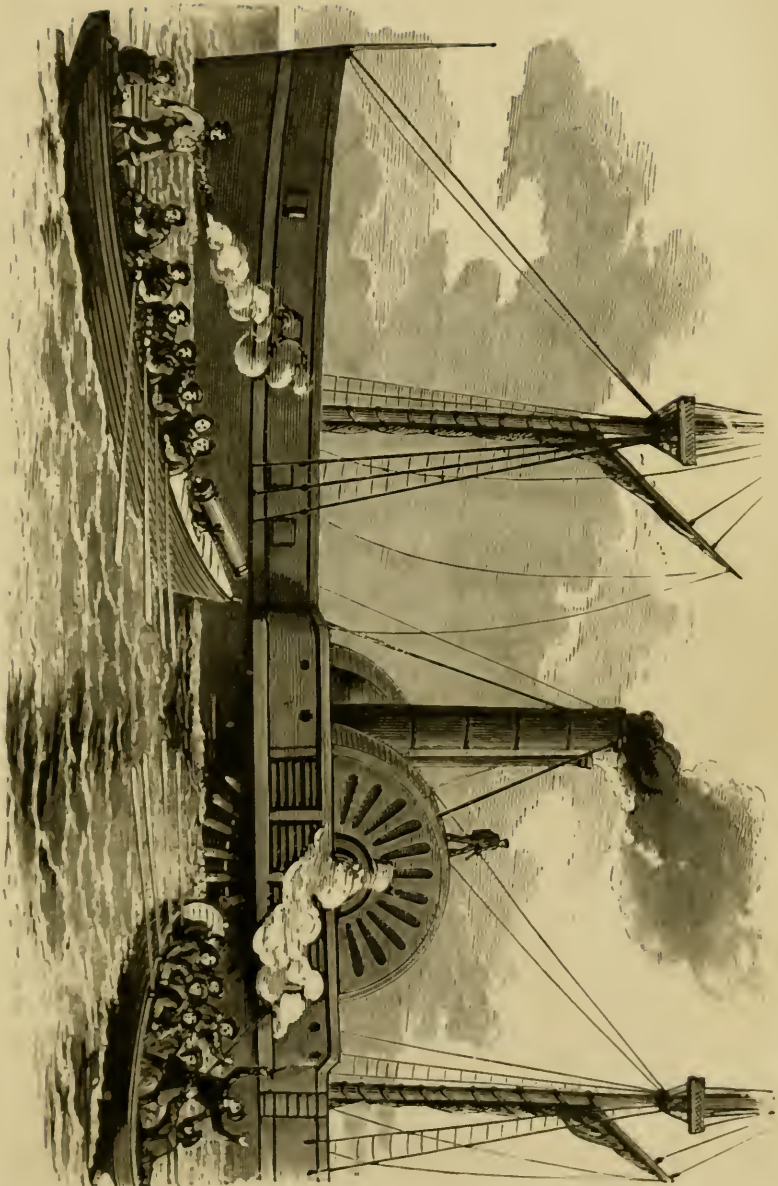
A Conflict of Authority. Page 148.