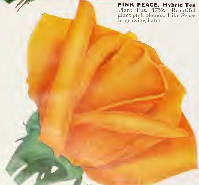
LADY ELGIN. Hybrid Tea. Plant Pat. 1469. Bright orange-apricot. A tall plant with rich green foliage.