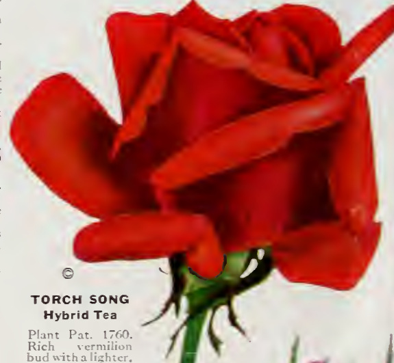
TORCH SONG Hybrid Tea Plant Pat. 1760. Rich vermilion bud with a lighter, brighter glow on the inside and a deeper smoky reverse.