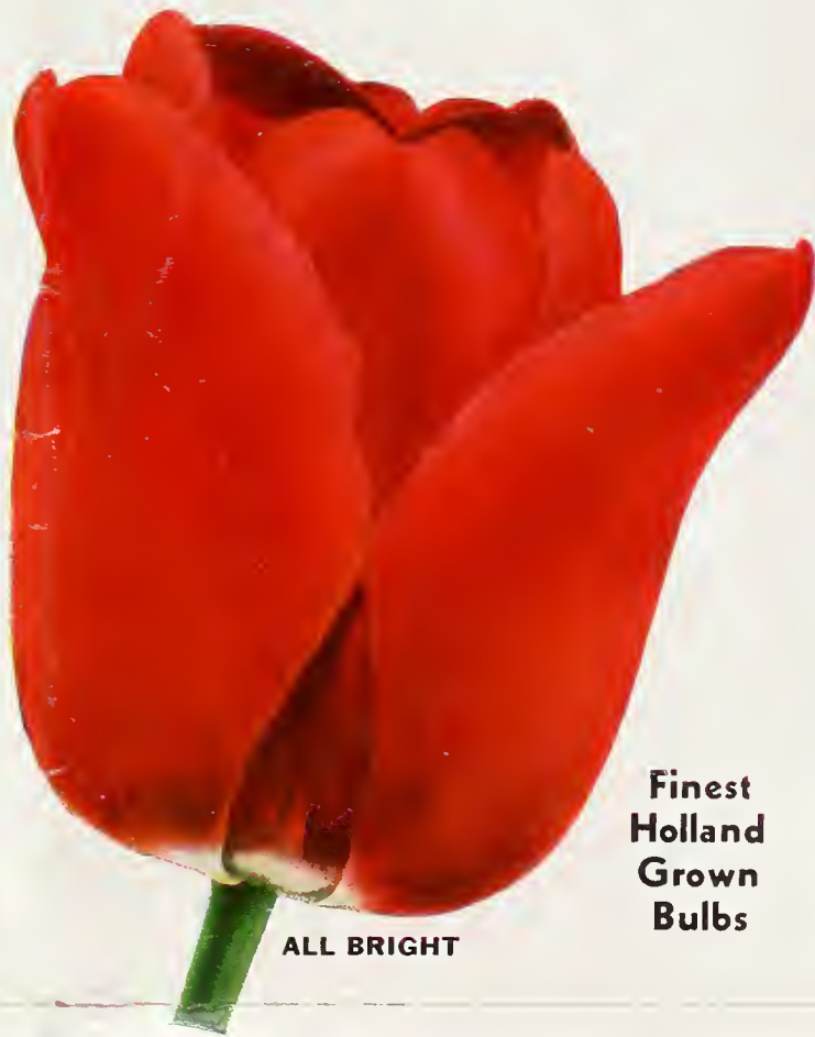
Finest Holland Grown Bulbs

Perry Como. (D) Graceful variety. The tall stems carry a magnificent well-shaped solid pink bloom, with silvery reflex at the edges. Stately and refined. Sturdy and solid. 3 bulbs 65c; 12 for $2.10; 100 for $13.80, postpaid.