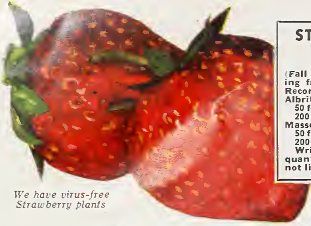
We have virus-free Strawberry plants