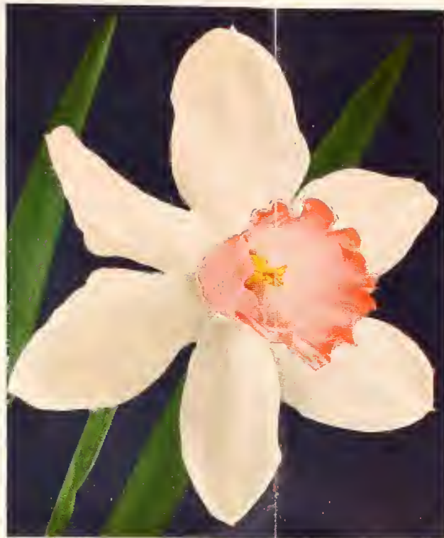
PINK DAFFODIL, MRS. R. G. BACKHOUSE

Peach Blossom. Soft rosy pink, lushed white. Flowers are fully double and long lasting. Grown chiefly for their showy effect where a display of color is desired. Well suited to forcing and bedding. Dwarf growth—6 to 8 inches—makes this variety ideal for foreground planting. An exceptionally fine forcer. 3 bulbs 40c; 12 for $1.35; 100 for $8.70, postpaid .