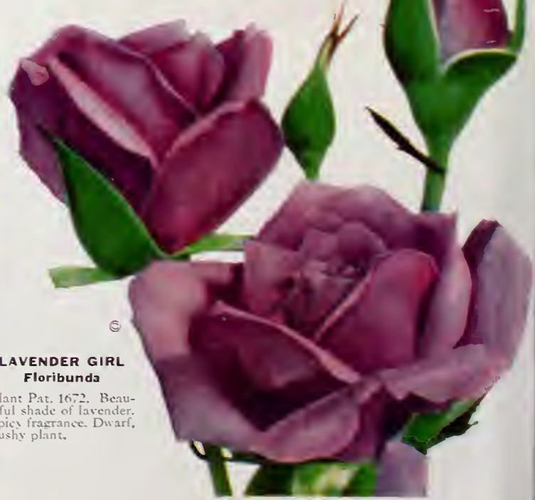
LAVENDER GIRL Floribunda Plant Pat. 1672. Beautiful shade of lavender. Spicy fragrance. Dwarf, bushy plant.