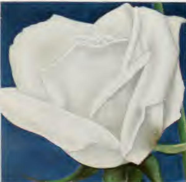
WHITE KNIGHT. Hybrid Tea. Plant Pat. 1359. Good buds and big double blooms of snowy white. Very fine plant.