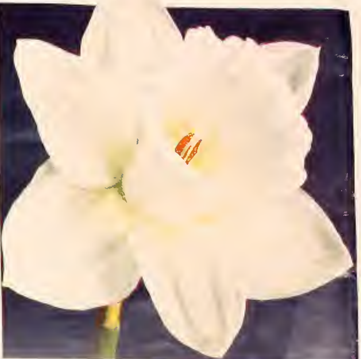
DAFFODIL, MOUNT HOOD

Especially Prepared for the Cultivation of Bulbs Indoors You can easily grow bulbs indoors during the winter months in W-Q Prepared Bulb Fiber. The fiber can be used in any bowl or dish without drainage. It is clean and odorless. Complete instructions will be sent with your order. Qt. bag 25c; 2 qts. 45c; 4 qts. 60c., postpaid .