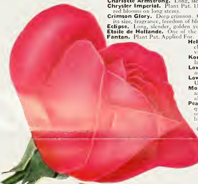
PINK PEACE. Hybrid Tea Plant Pat. 1759. Beautiful giant pink blooms. Like Peace in growing habit.