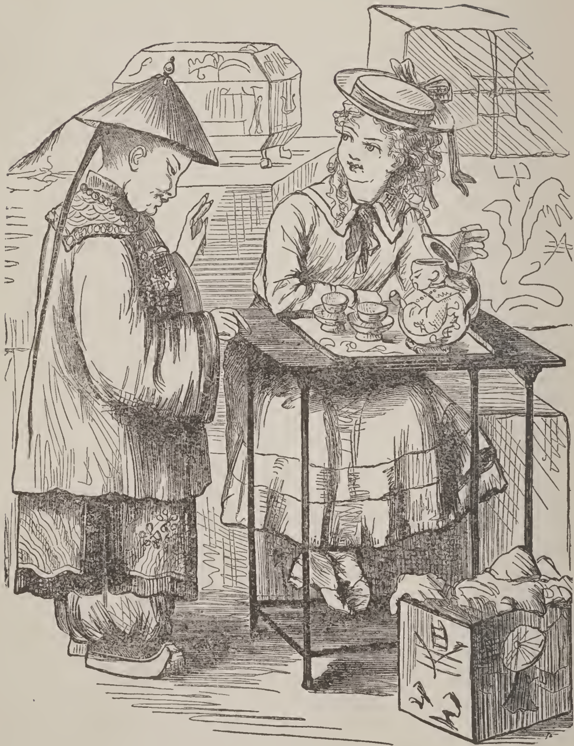
FUN SIGNIFIED IN PANTOMIME THAT THEY WERE HERS.— Page 79.