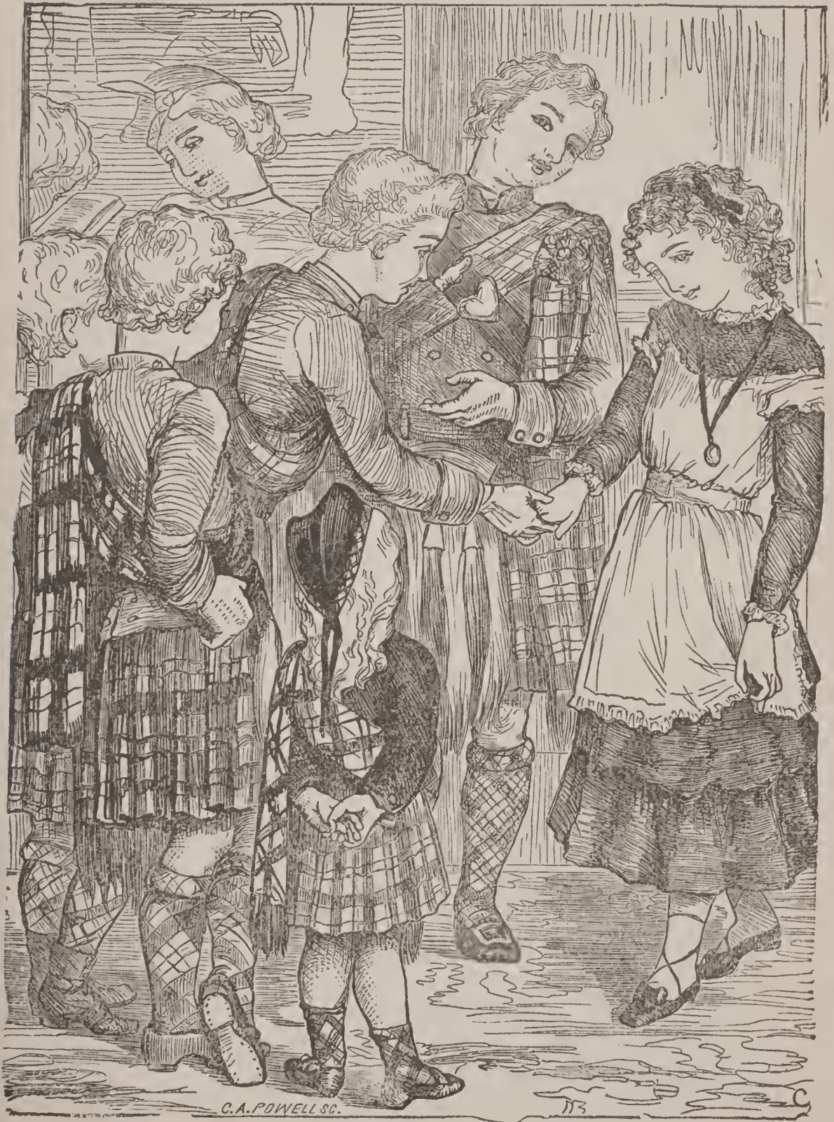
THE EIGHT COUSINS. — Page 10.