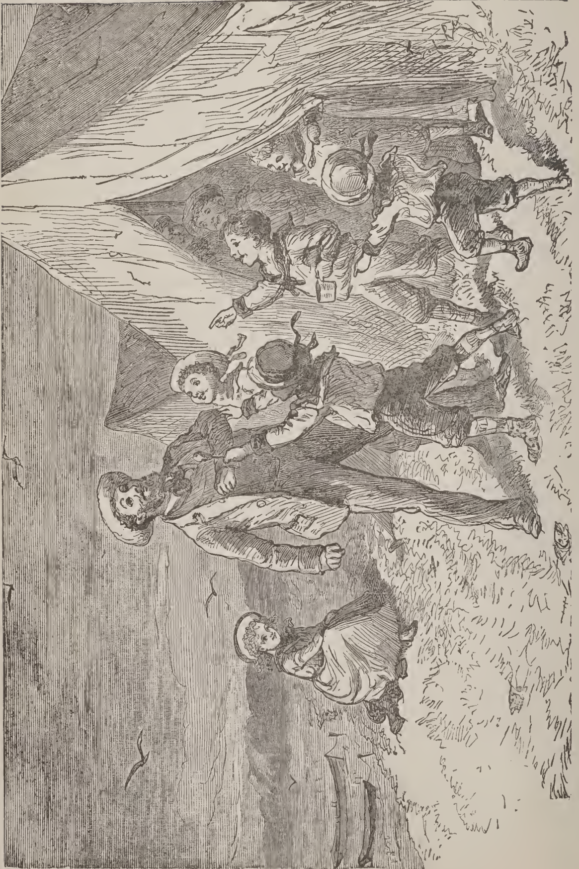
A CRASH, A SHOUT, A LAUGH, AND OUT CAME THE SAVAGES. — Page 99.