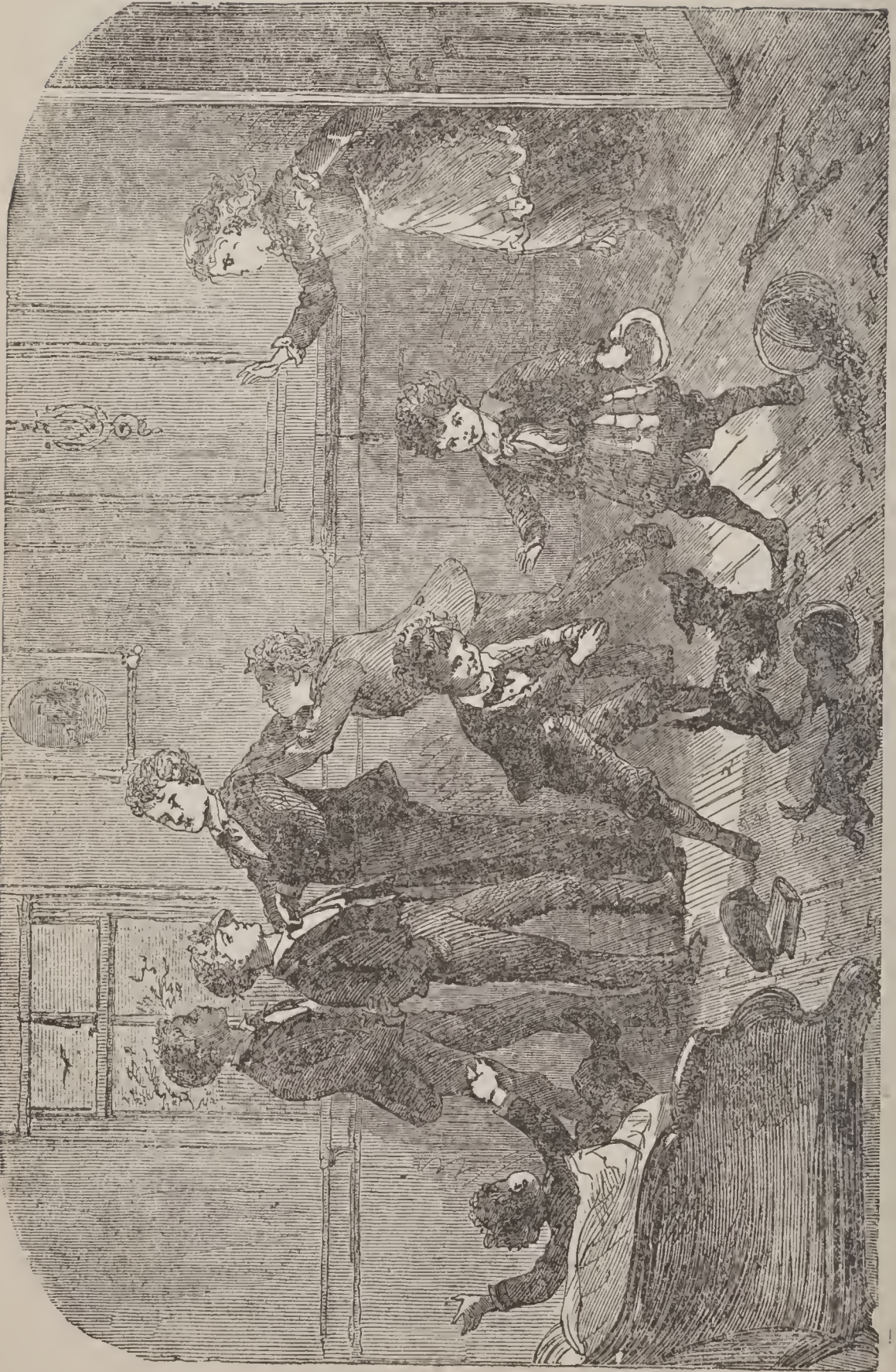
“THE SPECTACLE THAT MET NURSE ROSE’S EYE WAS A TRYING ONE.” — Page 131.