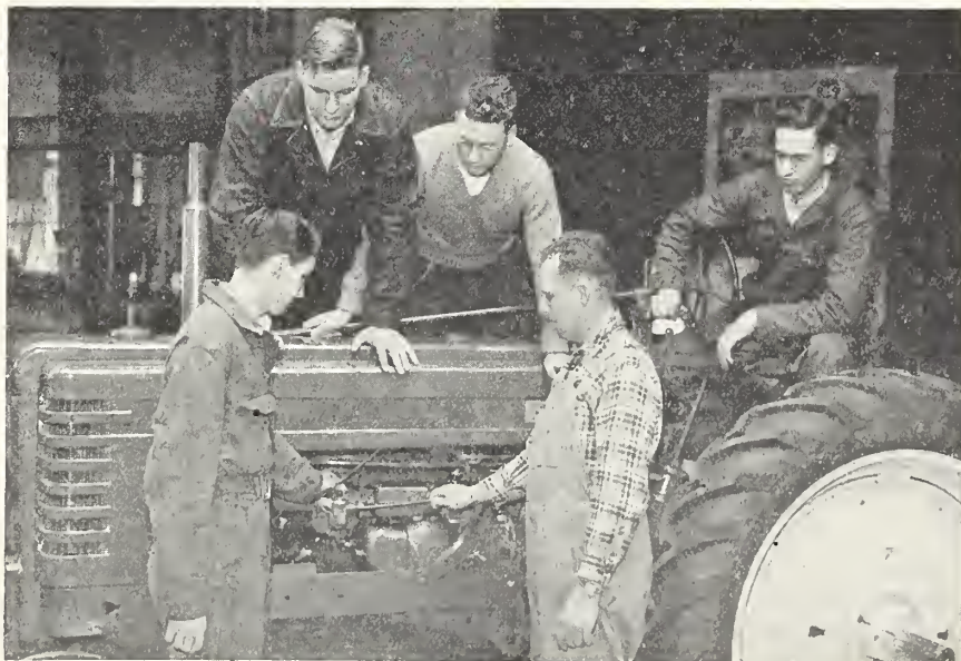
Colorado boys study the workings of a modern farm tractor.

The instruction was provided by the extension agricultural engineers, the teaching staff in the agricultural engineering departments at the colleges, and the automotive engineers of a nationally known oil company. Plans are already under way for developing similar short courses in other sections of the United States.