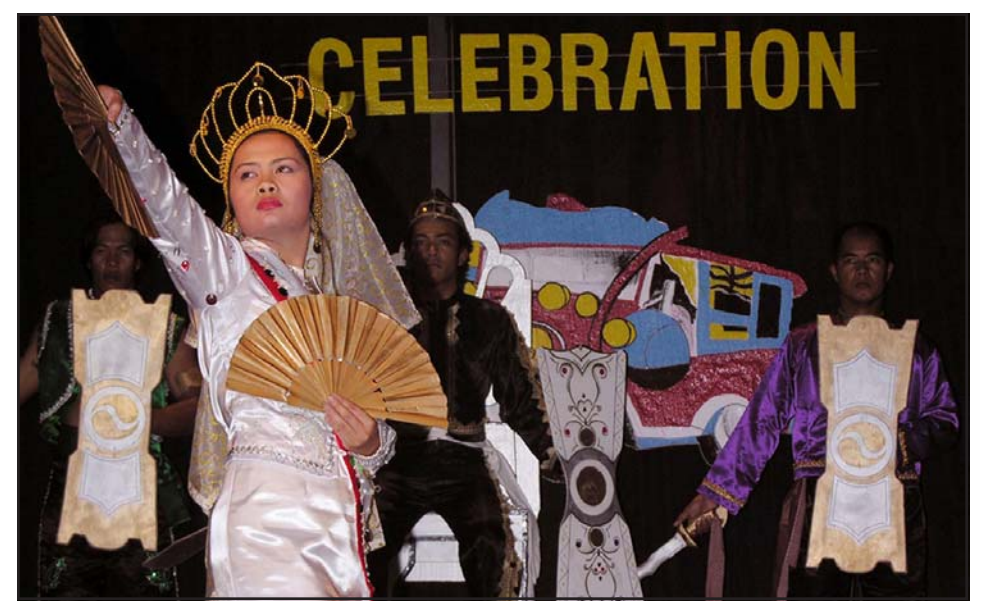
Philippine Independence Day Celebration — Dancers performed the "Singil" during the Philippine Independence Day Celebration at the Windjammer Ballroom, June 17. This is one of the oldest Filipino dances, drawing its name from the bells worn on the ankles of a princess.