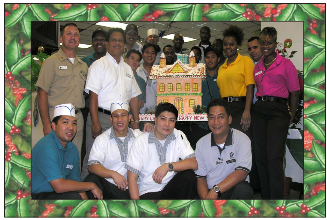
The staff at Gold Hill Galley is wishing the GTMO community a happy holiday season.