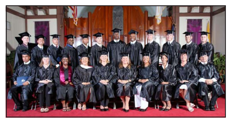
College graduation — Prior to Columbia College's first commencement, graduates of Columbia College-Guantanamo Bay pose for a group photo before being presented their graduation diplomas on Sunday, March 26, at the base Chapel.