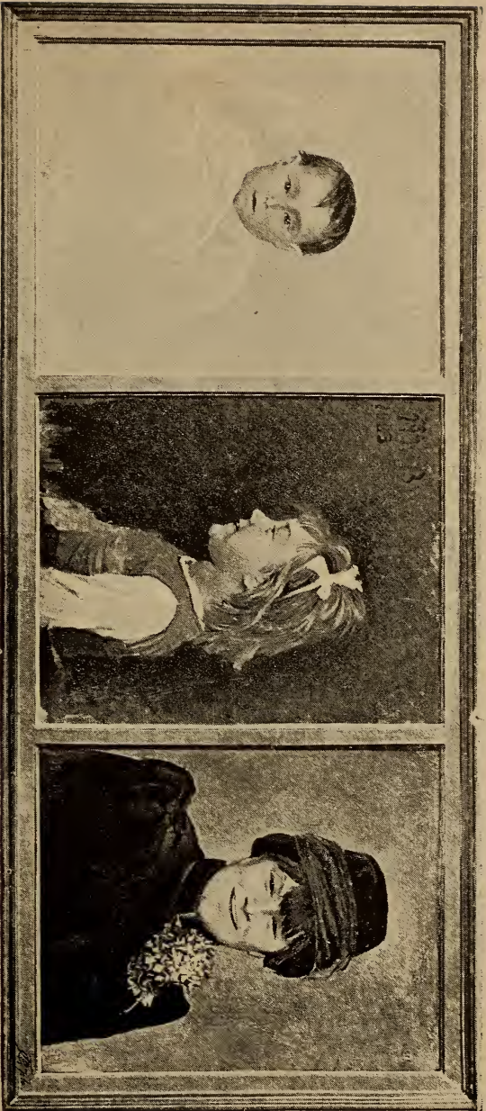
THE THREE LADIES,