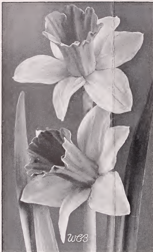
Giant Trumpet Daffodils Defy April's Strong Winds

SIX PEONIES. One strong division of each of the six splendid Peonies described above, a complete collection, for $2.50