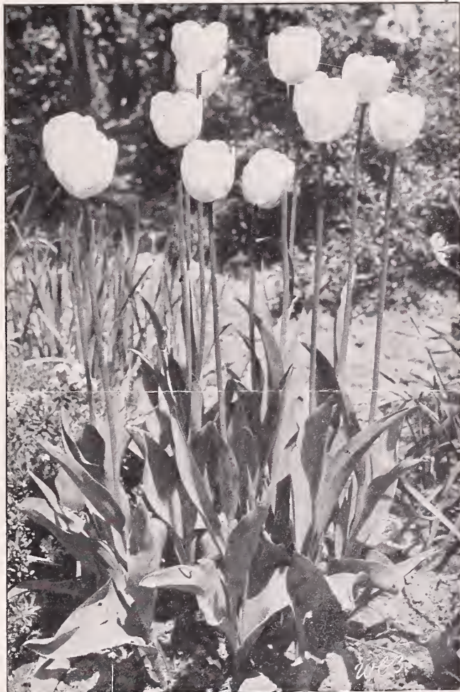
Darwin Tulip Dream, Planted in a Clump

We prepay the forwarding charges on all flowering bulbs at prices quoted. Six bulbs of a variety furnished at the dozen rate; twenty-five of a variety at the hundred rate; and two hundred and fifty at the thousand rate.