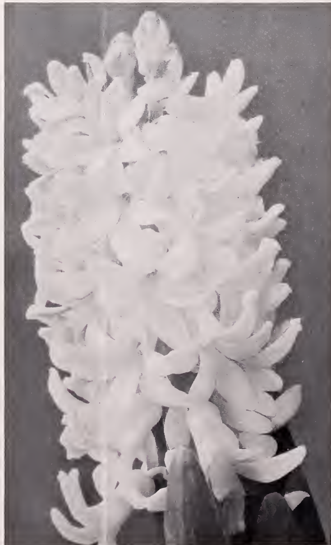
Exhibition Hyacinth L'Innocence