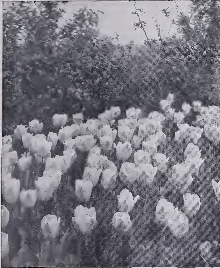
Planting Gorgeous Breeder Tulips, Prolongs Tulip Time