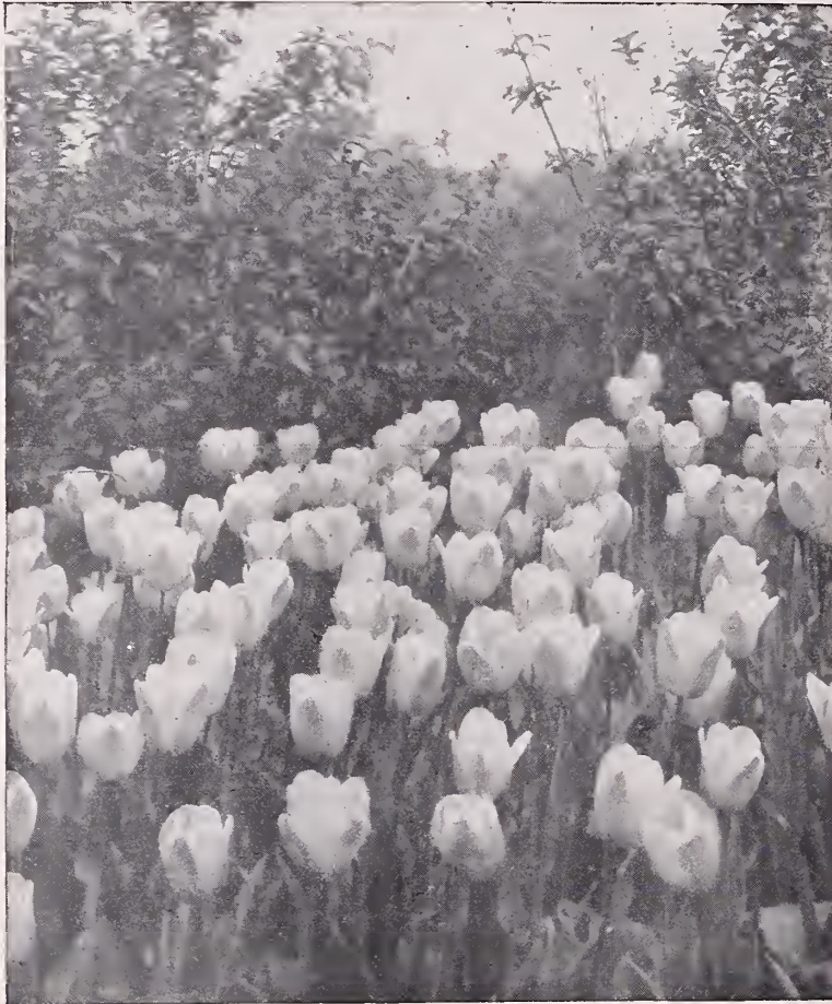
Planting Gorgeous Breeder Tulips, Prolongs Tulip Time