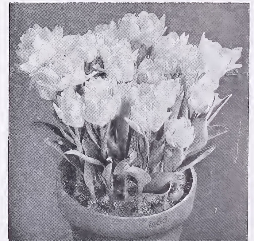
For Early Blooms Use Double Early Tulips