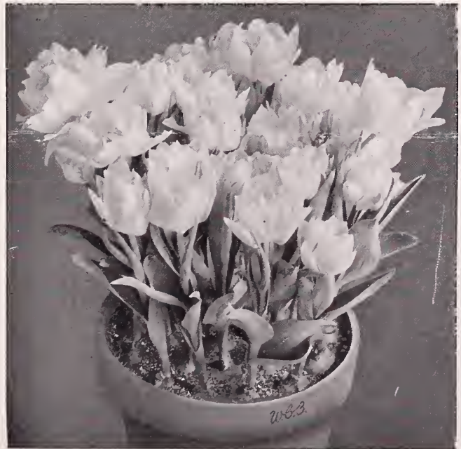
For Early Blooms Use Double Early Tulips