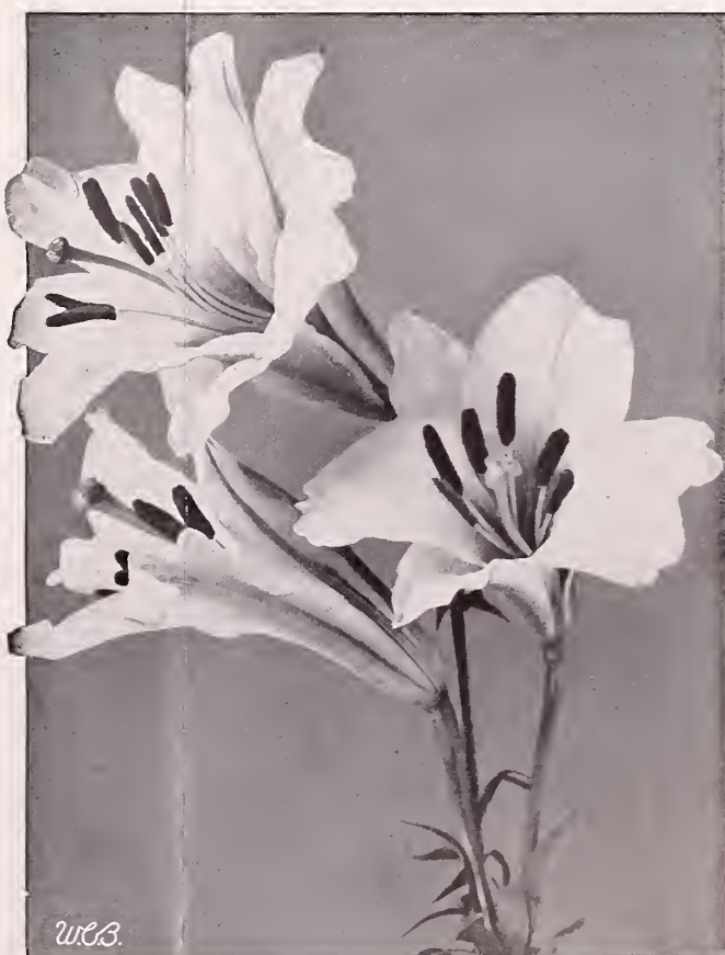
Hardy Lilium Regale, the Regal Lily

Prepared fibre for growing Bulbs indoors in jardiniere. Pk.....$ .25 Bu.....$ .75