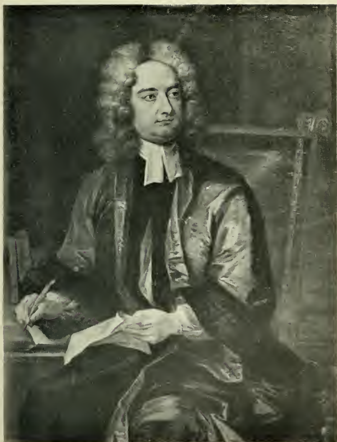
From a photo by Emery Walker, after the picture by Charles Jervas in the National Portrait Gallery.