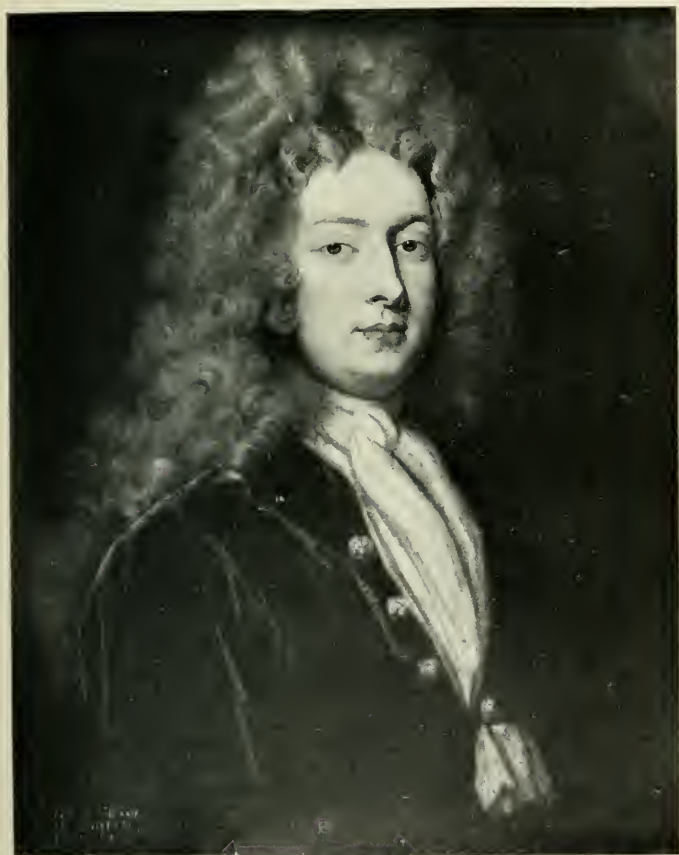
after the picture by Sir Godfrey Kneller in the National Portrait Gallery.