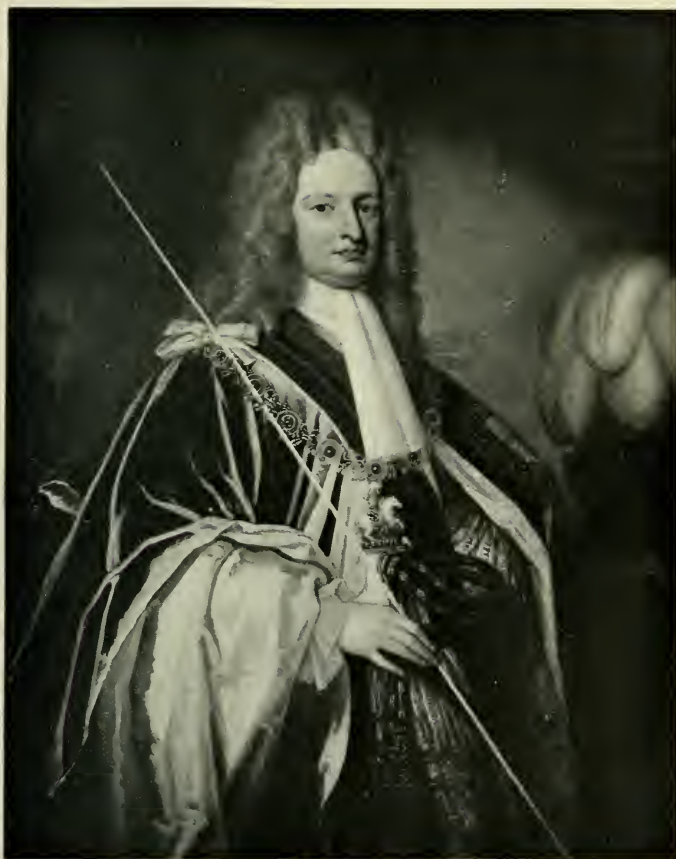
after the picture by Sir Godfrey Kneller in the National Portrait Gallery.

ROBERT HARLEY, EARL OF OXFORD AND MORTIMER, K.G.