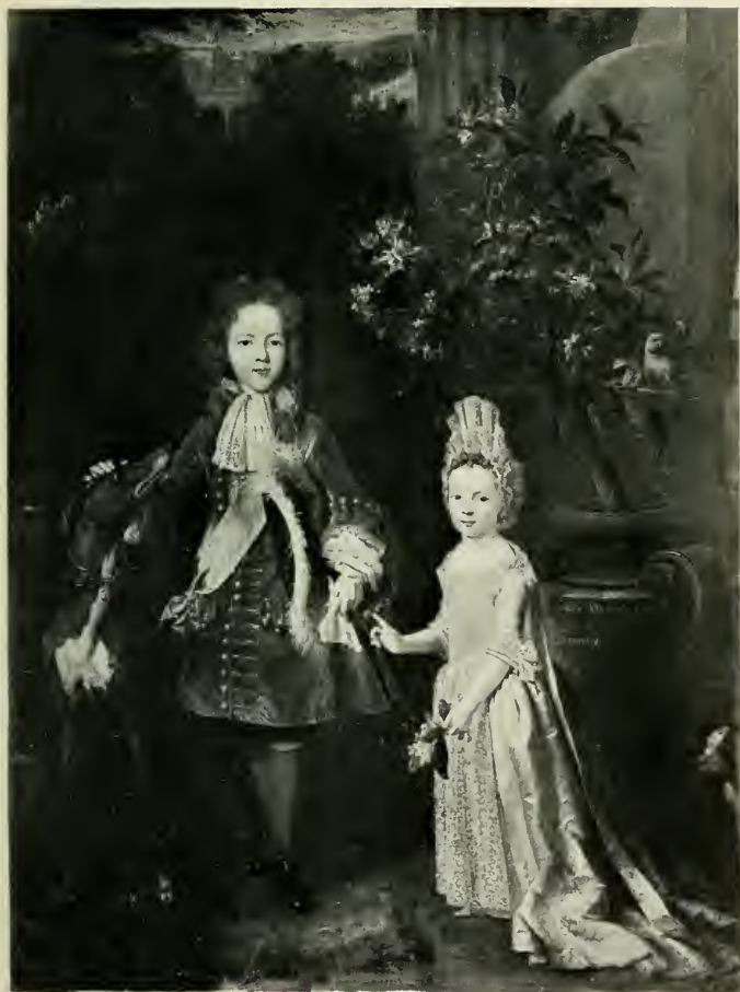
after the picture by Nicolas de Largillière in the National Portrait Gallery.

QUEEN ANNE'S BROTHER, PRINCE JAMES, AND HER SISTER, THE PRINCESS LOUISA, EXILES AT THE COURT OF FRANCE.