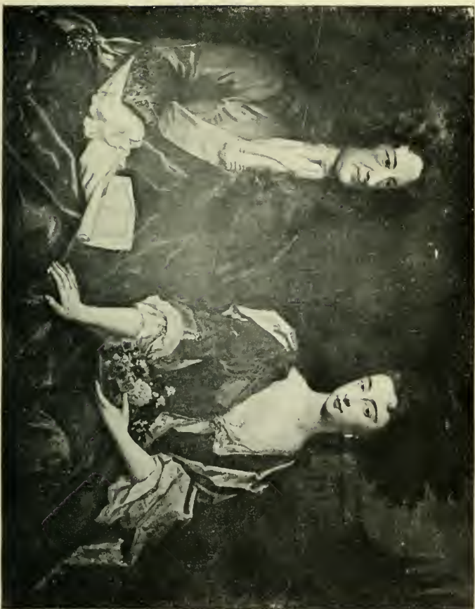
After the picture by Sir Godfrey Kneller.

JOHN SHEFFIELD, AS DUKE OF BUCKINGHAMSHIRE, AND HIS THIRD WIFE, LADY CATHERINE DANVERLEY, HALF-SISTER OF QUEEN ANNE.