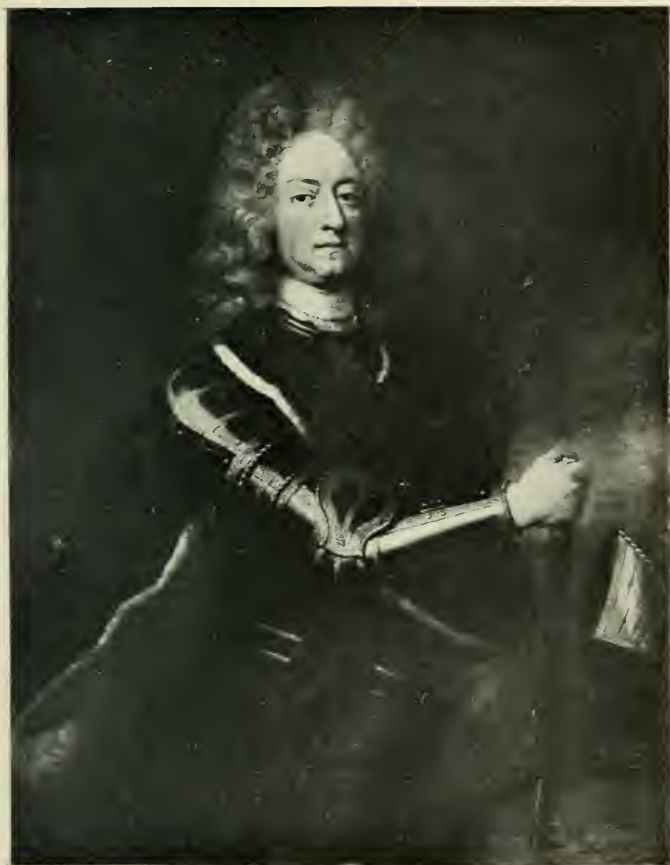
after the picture by Michael Dahl in the National Portrait Gallery.

JAMES BUTLER, SECOND DUKE OF ORMONDE, K.G.