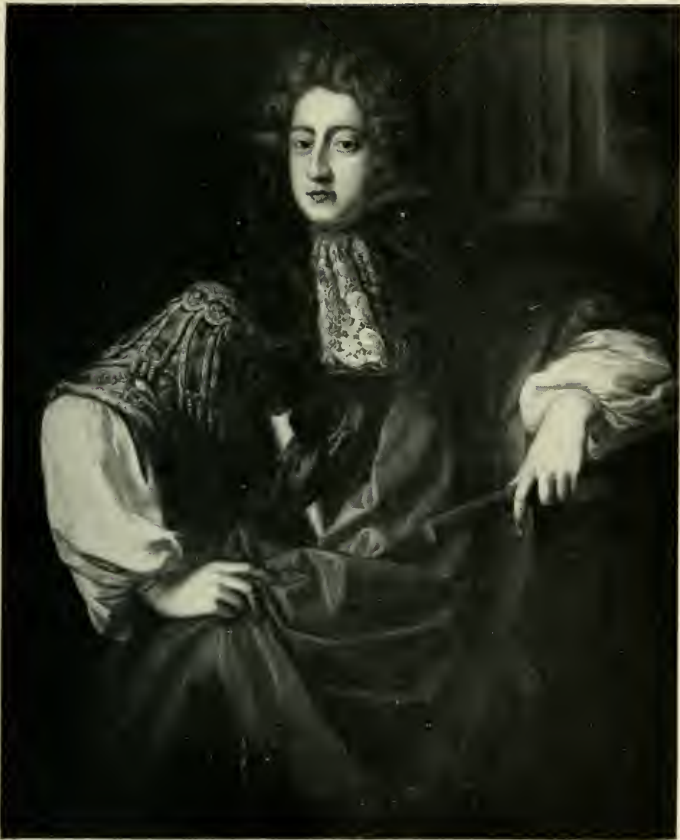
From a photo by Emery Walker, after a picture in the National Portrait Gallery by Wissing.