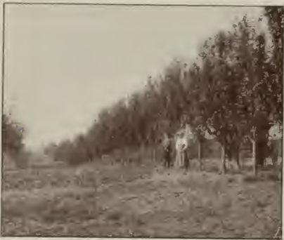
An eighty rod row of Kieffer Pear Trees on Home Nursery grounds. Taken from a photograph.

Montmorency —Large, red, very productive, ten days later than Early Richmond.