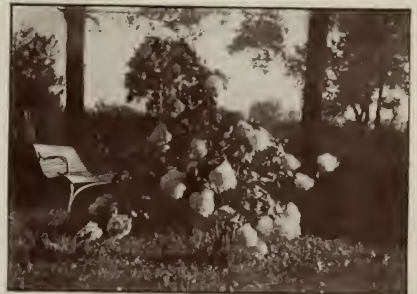
Hardy Hydrangia. From a photograph taken last summer on our grounds.

Yucca Filamentosa —Green during winter, blossom white. Each, 25c.