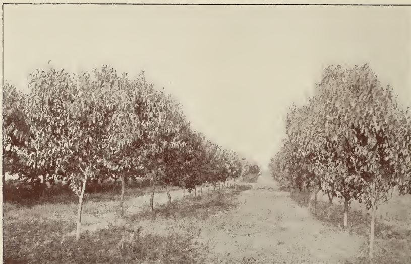
Photograph of Peach Orchard on Home Nursery grounds, the largest in this part of the State. Trees three years planted.