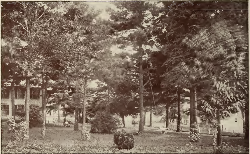
Photo of proprietor's front lawn as seen from the rear. Partial view of residence on the left. Tenant houses on the right.