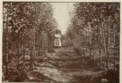
Looking down nursery row of three-year Apple Trees. From a photograph.

Transcendent —This is one of the best and largest of the Siberian Crab. The fruits are 1½ to 2 inches in diameter; bright yellow, striped red; excellent for culinary; immensely productive.