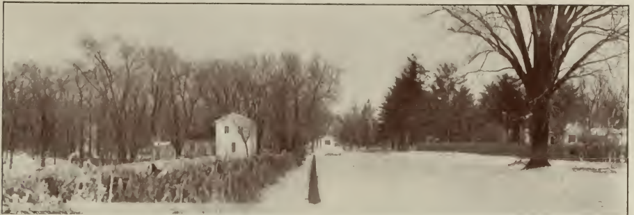
General view of Home Grounds, showing residence at right. Tenant houses in foreground. From a photograph.