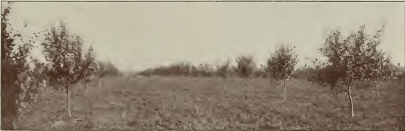
Our young Apple Orchard of twenty acres. Rows eighty rods long, thirty-two feet apart. From a photograph.