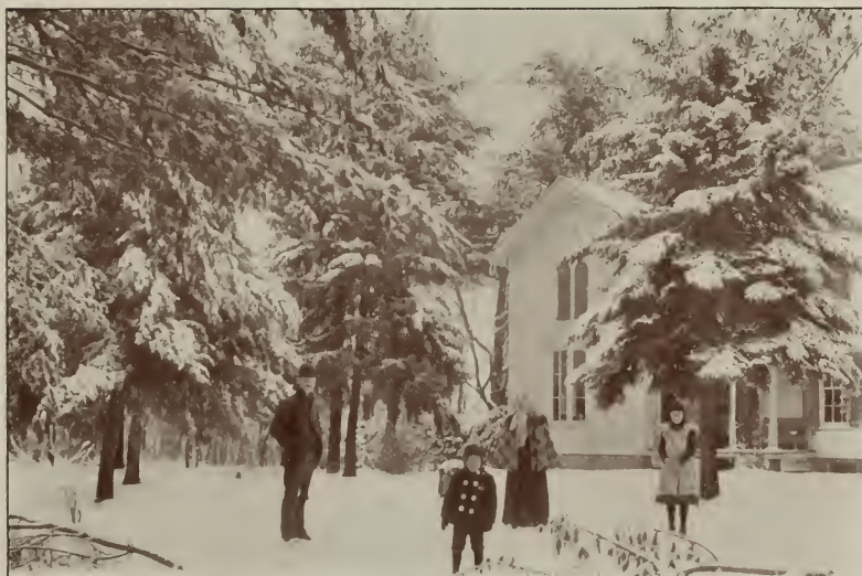
Partial view of Residence in winter. From a photograph.