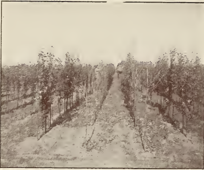
Young Apple Trees in the nursery row stripping leaves preparatory for fall digging. From a photograph.