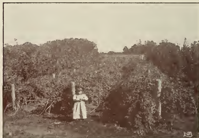
Photograph of Palmer Raspberry, showing growth of vines, extremely hardy, exceptionally free from disease.

Kansas (Black Cap) —Vigorous grower, berries very large and fine, ripens soon after Palmer. Per 10, 40c; per 100, $3.50.