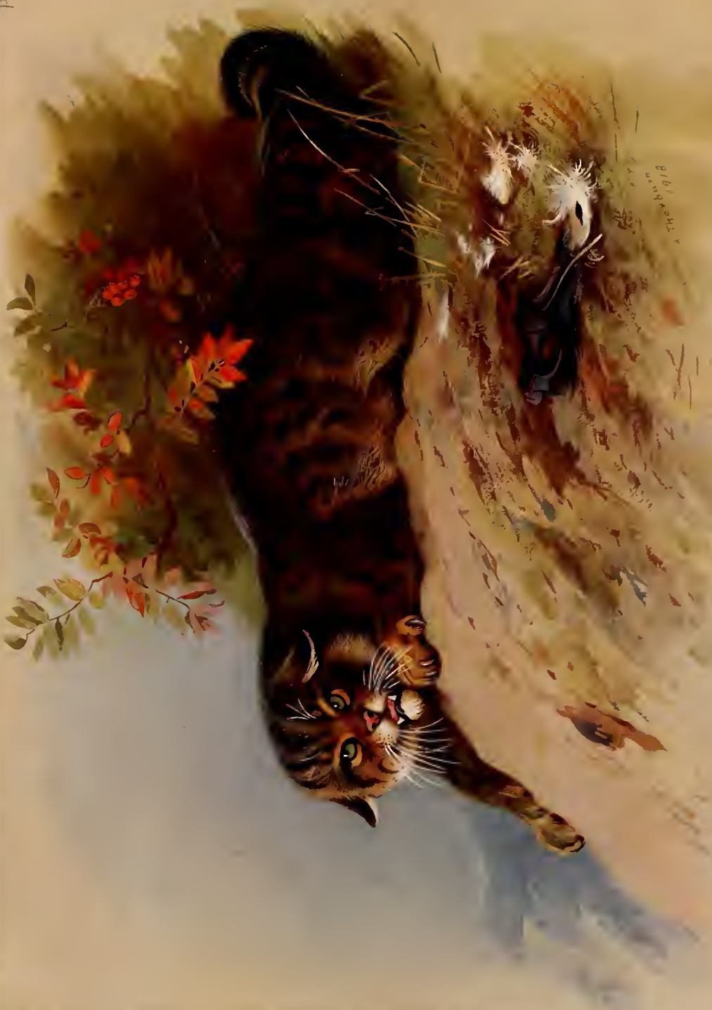
Wild Cat. 4