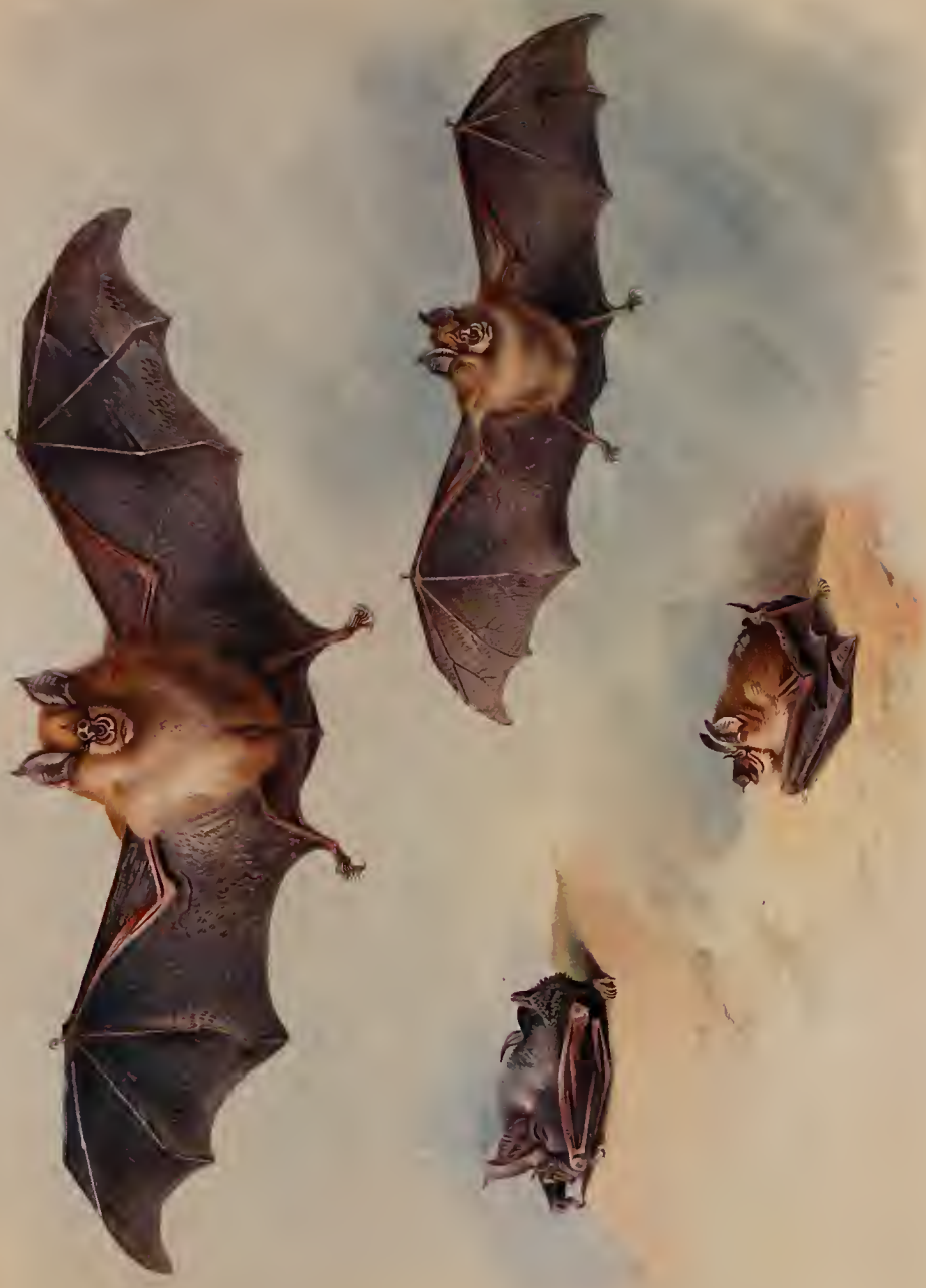
THE COMMON BAT (Vesperugo pipistrellus)