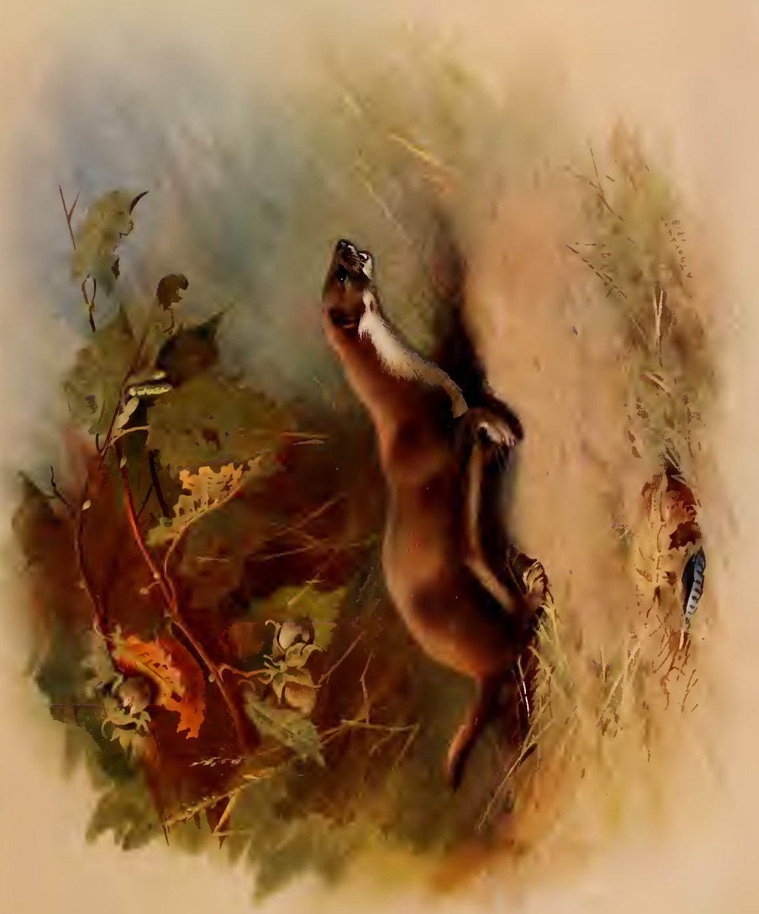
Weasel l. \frac{2}{3}