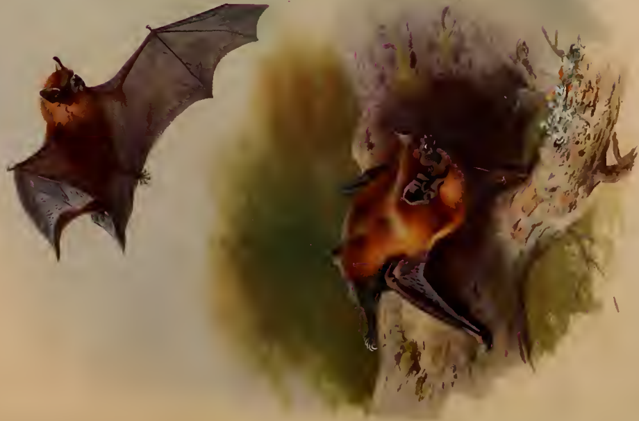
Pipistrelle or Common Bat