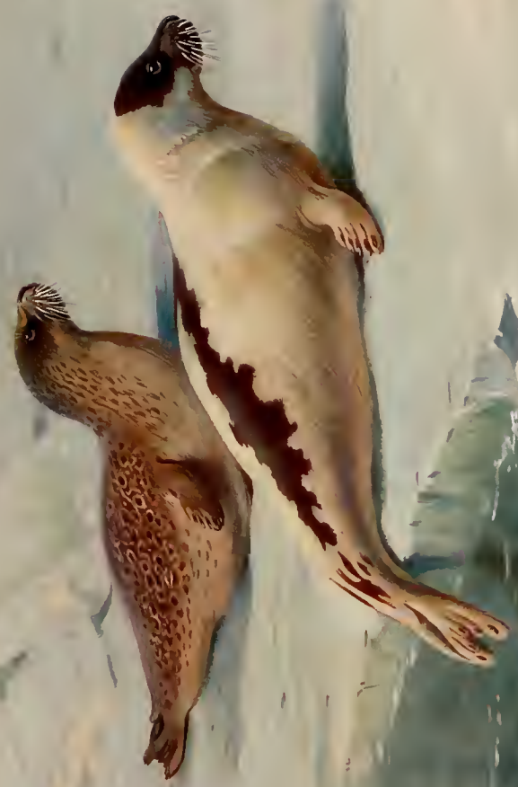
Ringed Seal Harp Seal