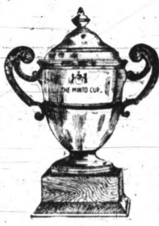
THE MINTO CUP.

Coveted lacrosse trophy of Canada. Its holders, New Westminster, continue to demonstrate that they will be able to hold it against Vancouver in the series of games now being played with the challengers.