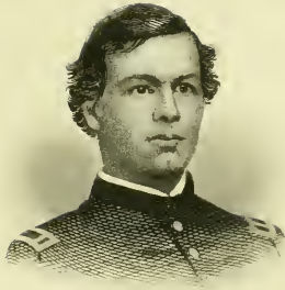
John C. Fremont